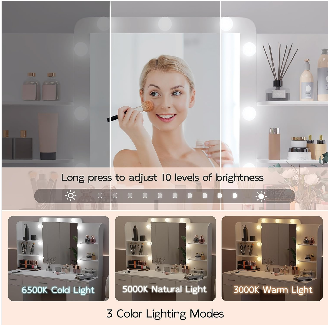
Figure 3: Adjustable Lighting Modes.

This image illustrates the three distinct color temperatures available for the mirror's LED lights: 3000K Warm Light, 5000K Natural Light, and 6500K Cold Light, along with the brightness adjustment feature.