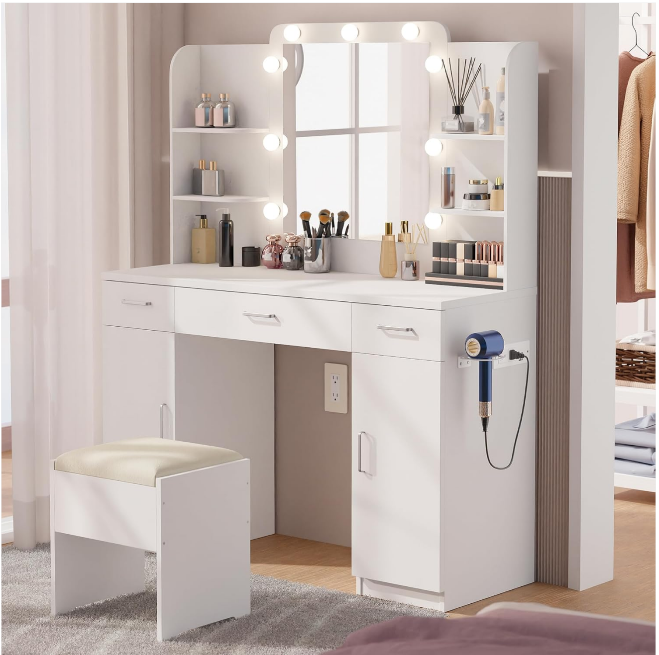
Figure 1: Complete Xilingol Vanity Desk with Mirror, Lights, and Stool.

This image displays the full vanity desk setup, showcasing the lighted mirror, multiple storage compartments, and the accompanying stool. The white finish provides a clean and modern aesthetic.