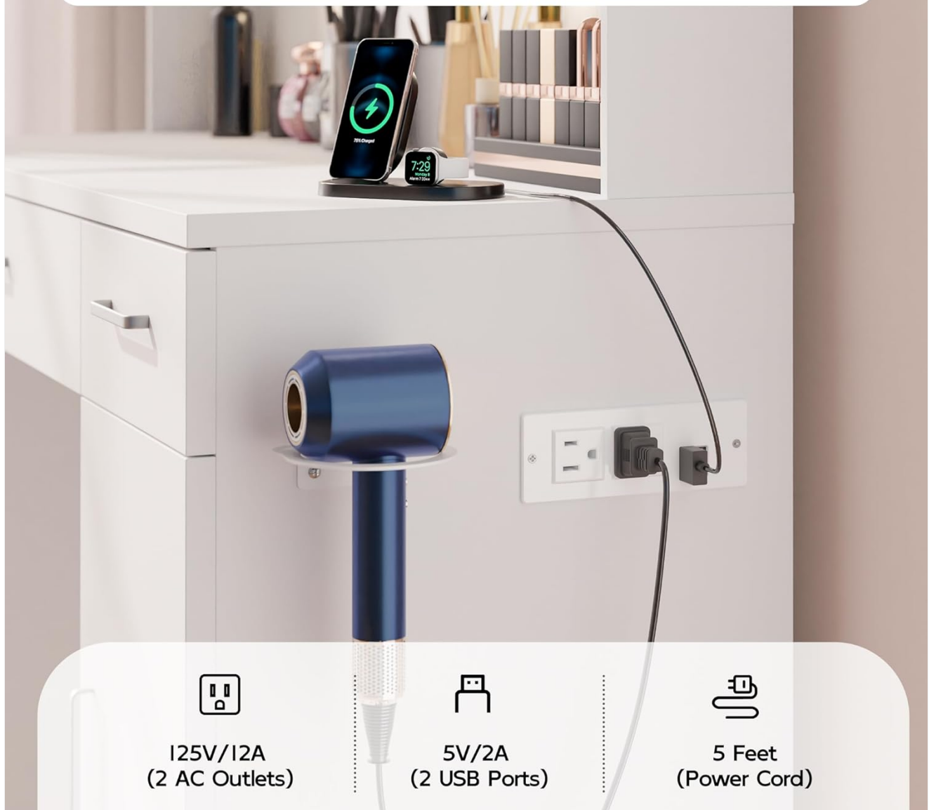
Figure 4: Built-in Power Strip.

Ideal for charging phones and using hair dryers