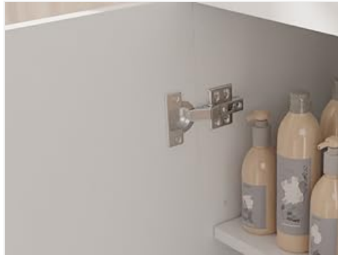
Figure 6: Cabinet Interior.

This image shows the interior of one of the vanity's drawers, illustrating its depth and potential for organizing various cosmetic items.