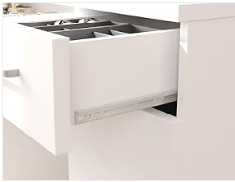
Figure 5: Drawer Interior.

This image shows the interior of one of the vanity's drawers, illustrating its depth and potential for organizing various cosmetic items.