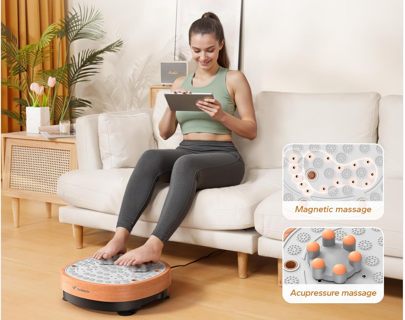
Image: Foot Massage Function in Use.

With massage function, it can effectively stimulate the soles of the feet, improve body circulation and relieve body fatigue.