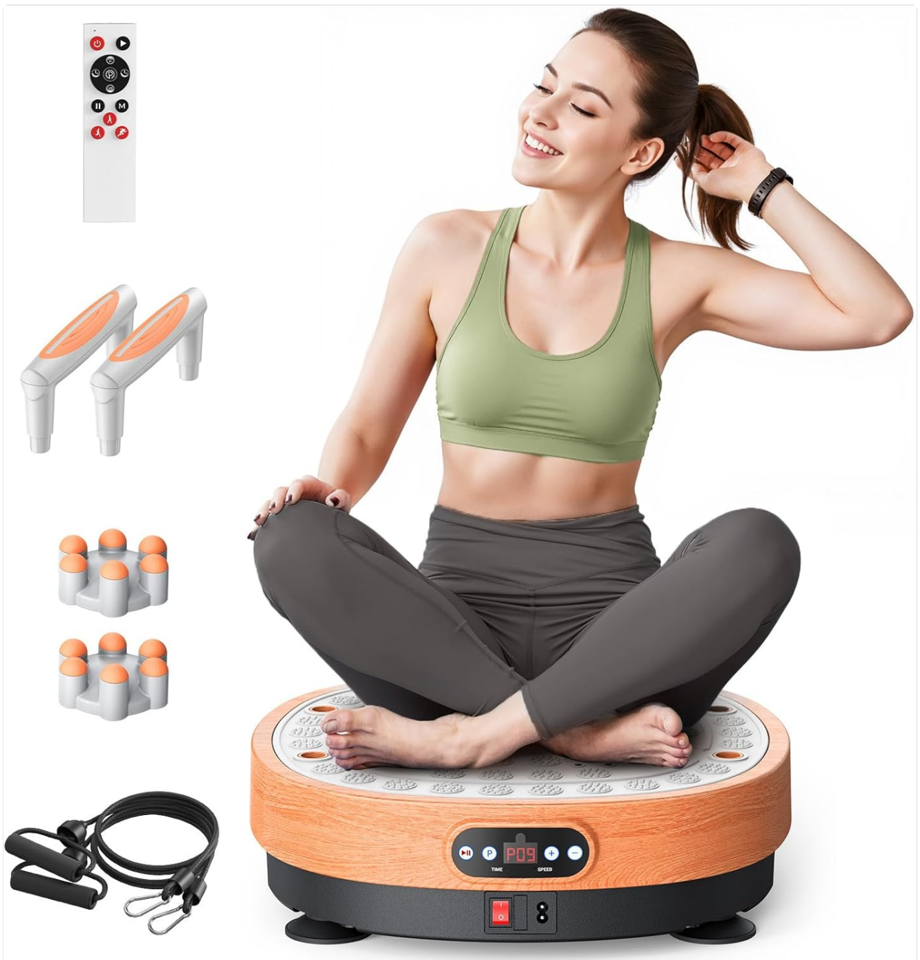
Image: MERACH Vibration Plate with included accessories.