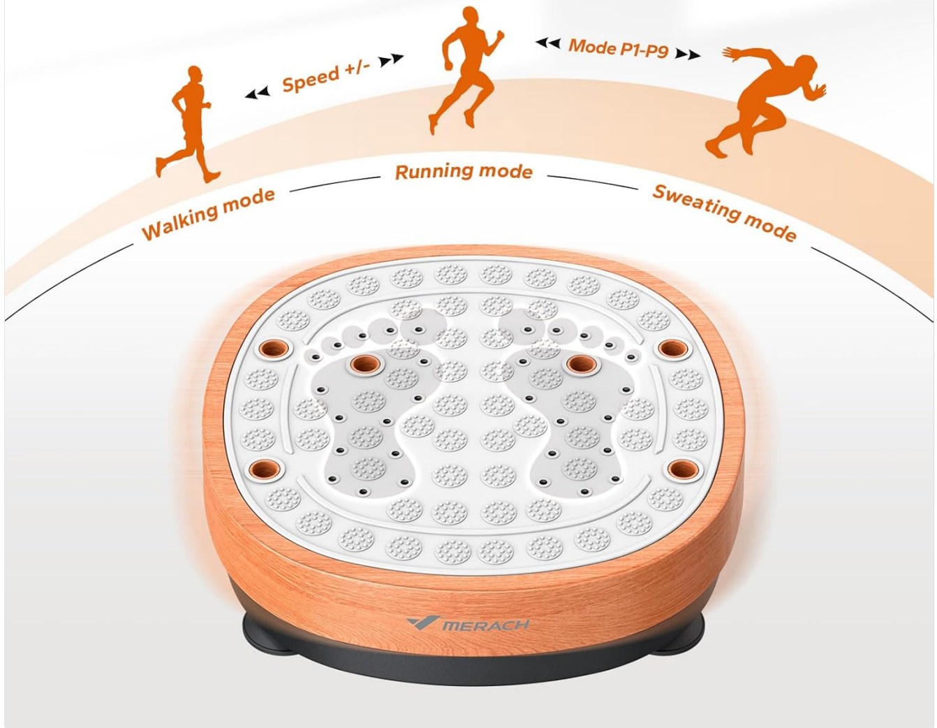
Image: Exercise Modes and Controls.

Equipped with 9 modes and 99 speeds, it can meet various training intensity requirements.