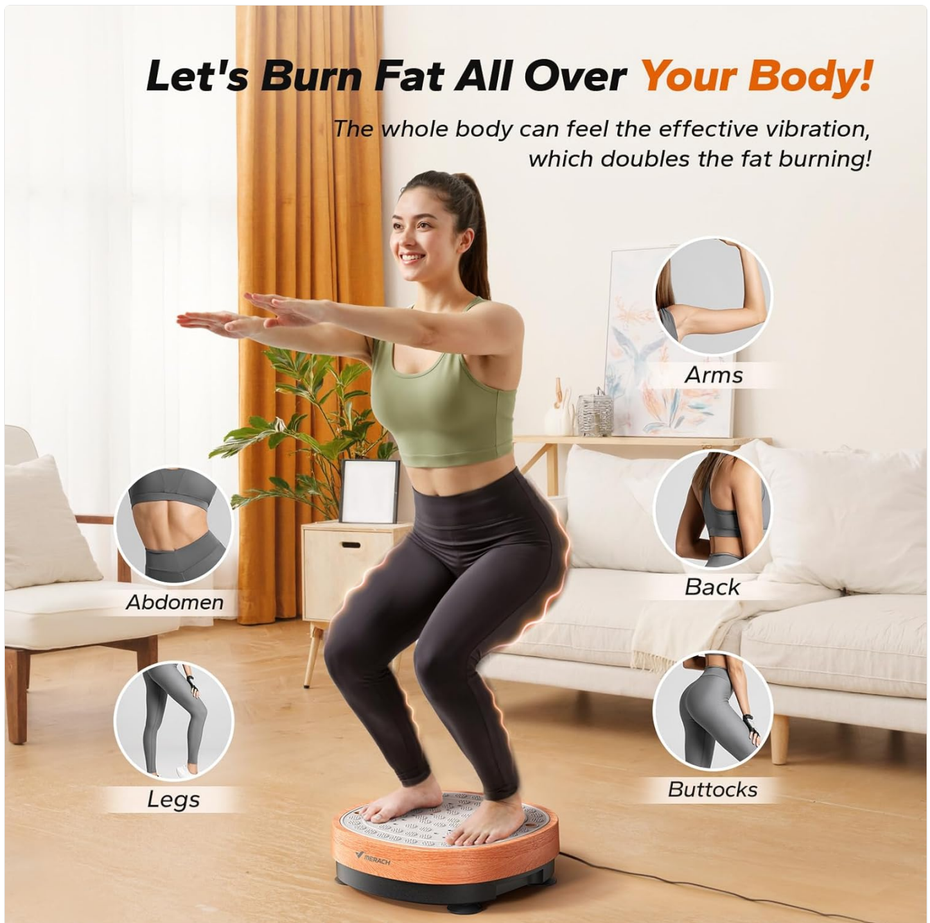
Image: Targeted Muscle Groups during Exercise.