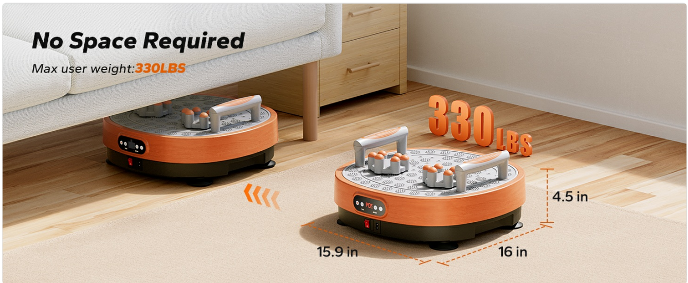
Image: Compact Design for Easy Storage.