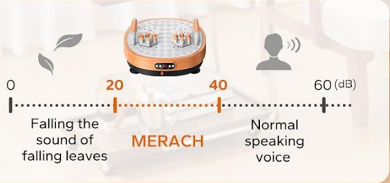
Image: Quiet Operation Feature.