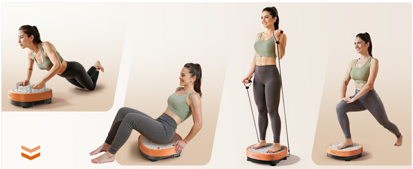
Image: Various Exercise Poses on the Vibration Plate.