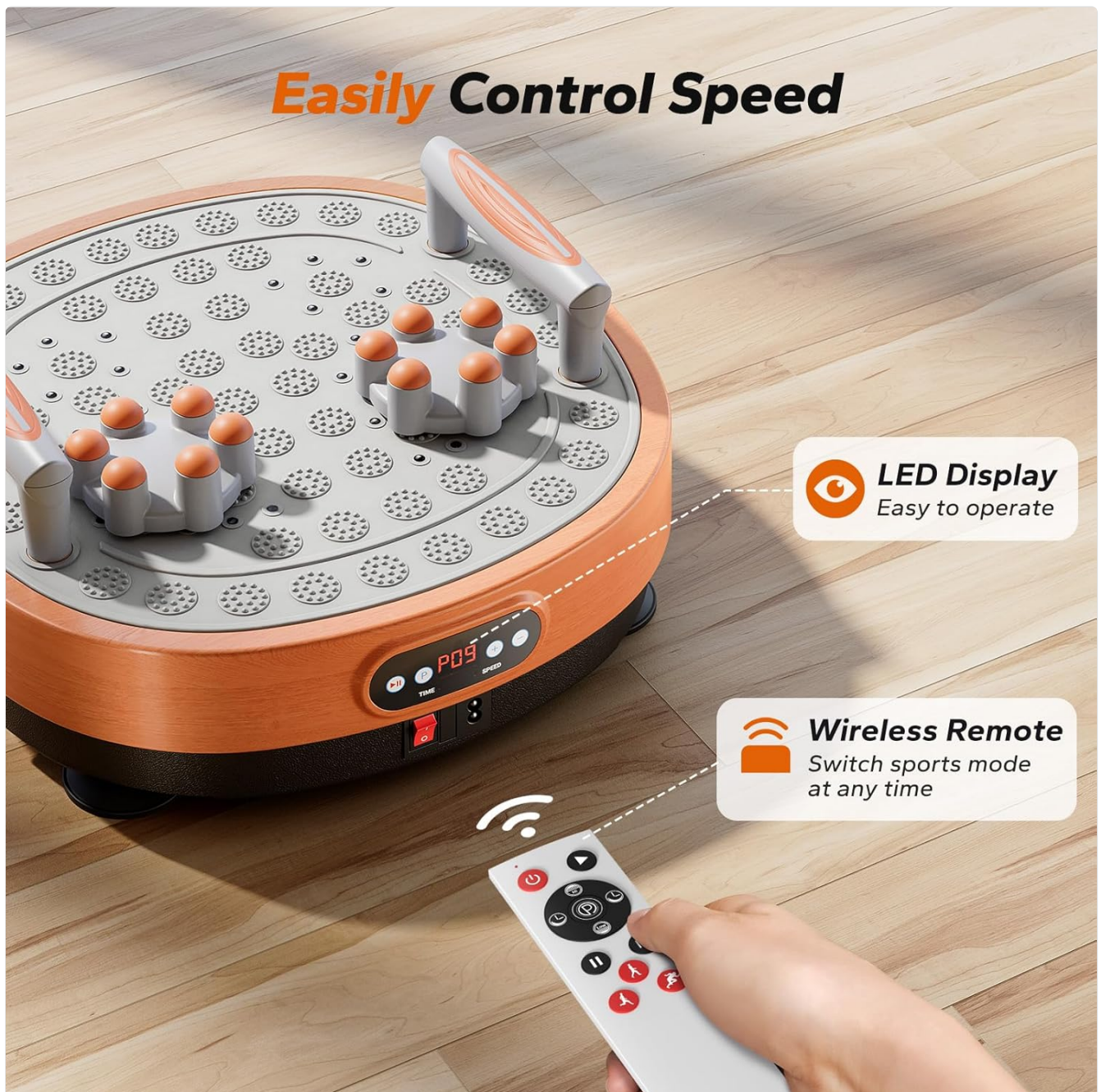
Image: LED Display and Wireless Remote Control.