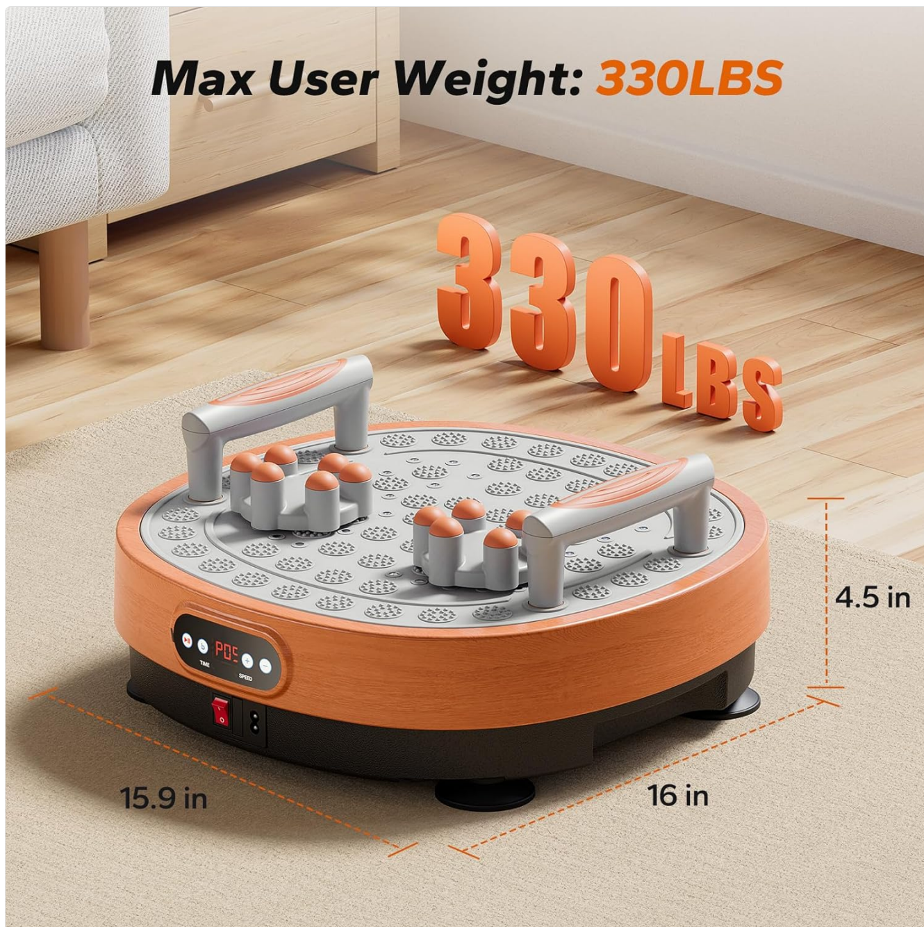
Image: Product Dimensions and Maximum User Weight.

The machine is designed for quiet operation, producing noise levels comparable to falling leaves (approx. 20 dB) to normal speaking voice (approx. 40-60 dB), allowing for use without disturbing others.