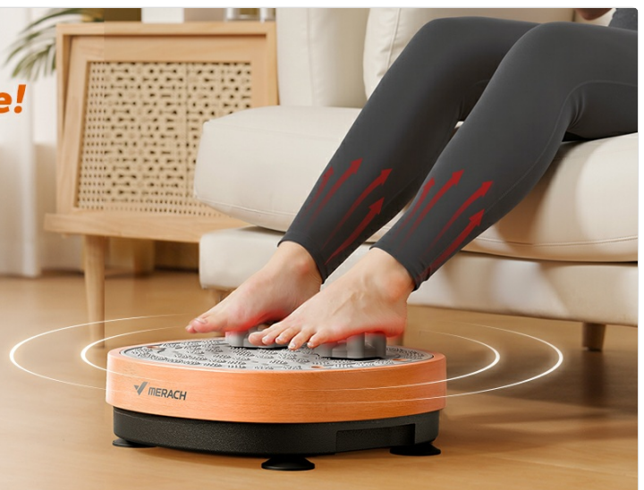
Image: Magnetic and Acupressure Massage Features.