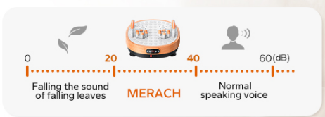
Image: Quiet Operation for Undisturbed Environments.