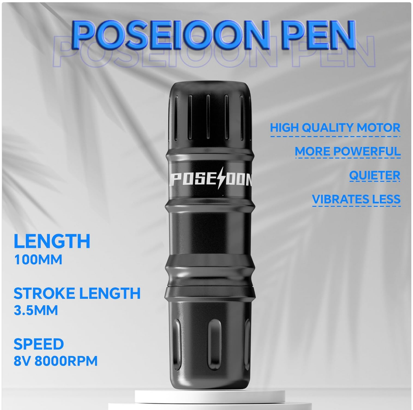
Figure 3: POSEIDON Tattoo Pen highlighting its dimensions and motor performance.