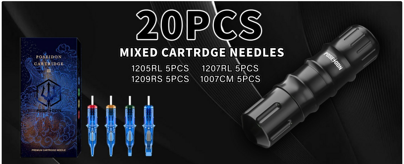
Figure 2: Detailed view of all items included in the POSEIDON Tattoo Pen Kit.