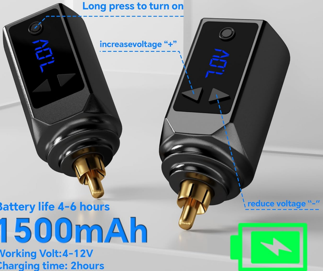
Figure 4: The two included 1500mAh batteries with voltage display and charging indicators.