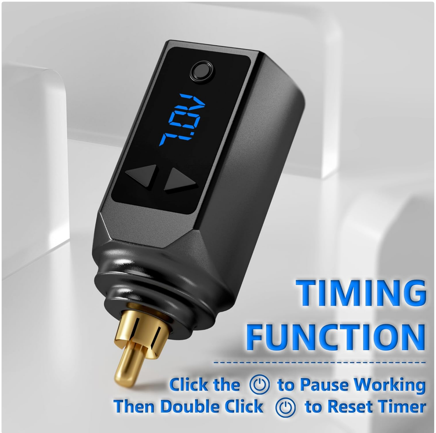
Figure 8: The timing function on the tattoo battery for tracking session duration.

5. Power Off: Long press the power button to turn off the tattoo pen after use.