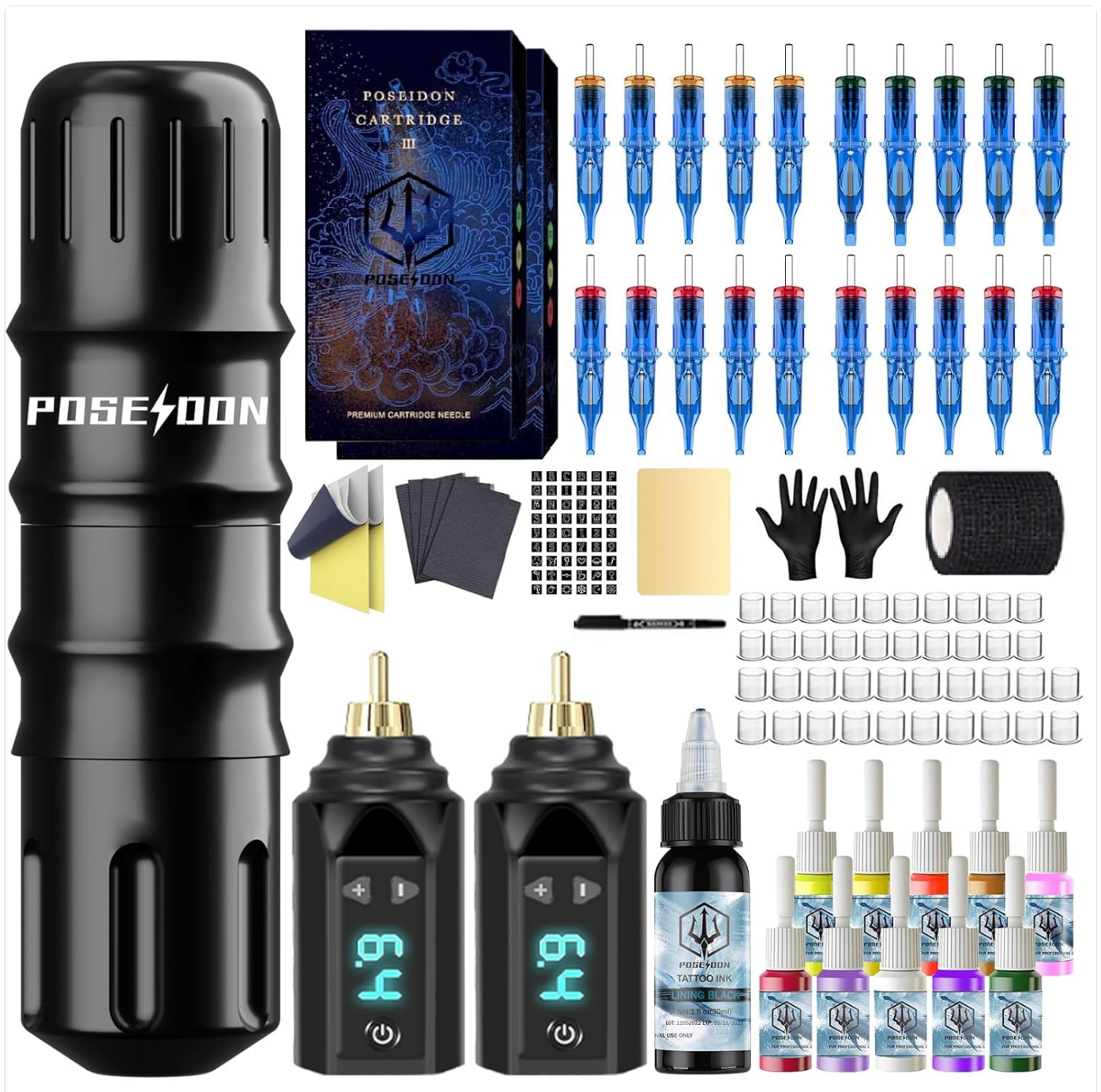
Figure 1: Overview of the POSEIDON Tattoo Pen Kit components.

The POSEIDON Tattoo Pen Kit is designed for both beginners and experienced artists, offering a complete set of tools for tattooing. It includes a tattoo pen, two rechargeable batteries, various cartridge needles, inks, and essential accessories for practice and application.