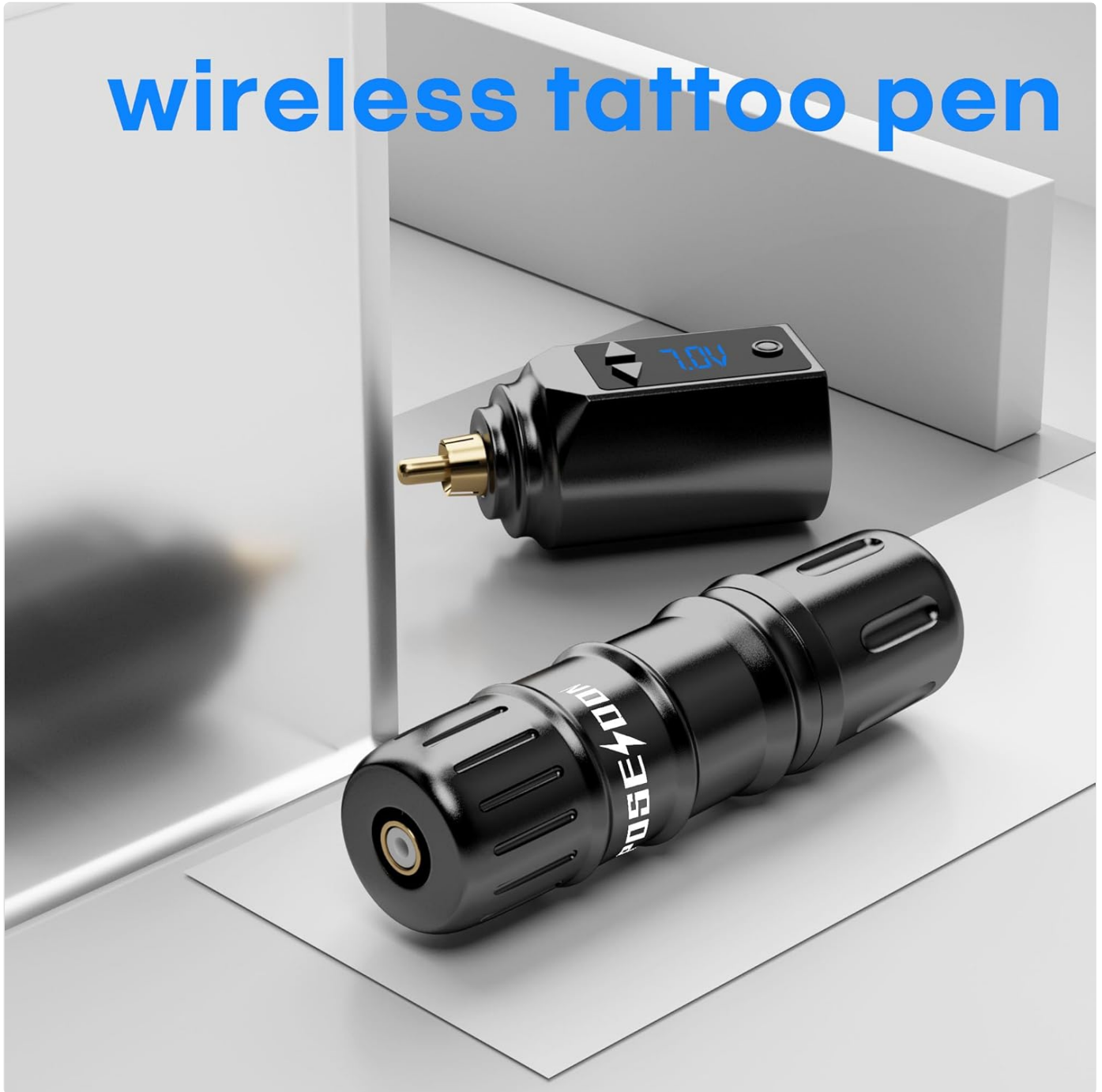
Figure 7: The POSEIDON Tattoo Pen assembled with its wireless battery.