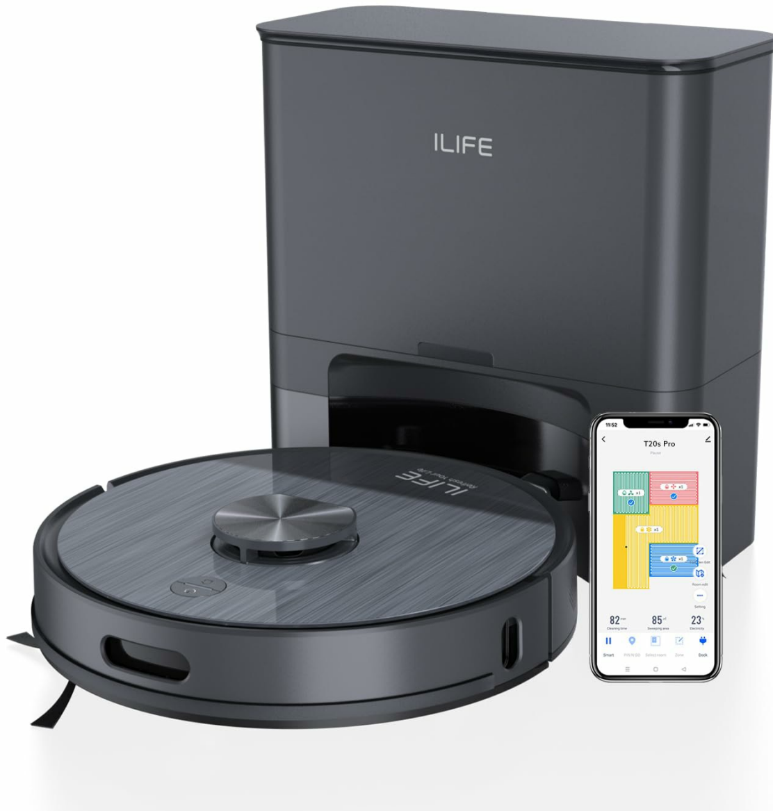
Figure 1: The ILIFE T20s Pro Robot Vacuum Cleaner with its self-emptying station.