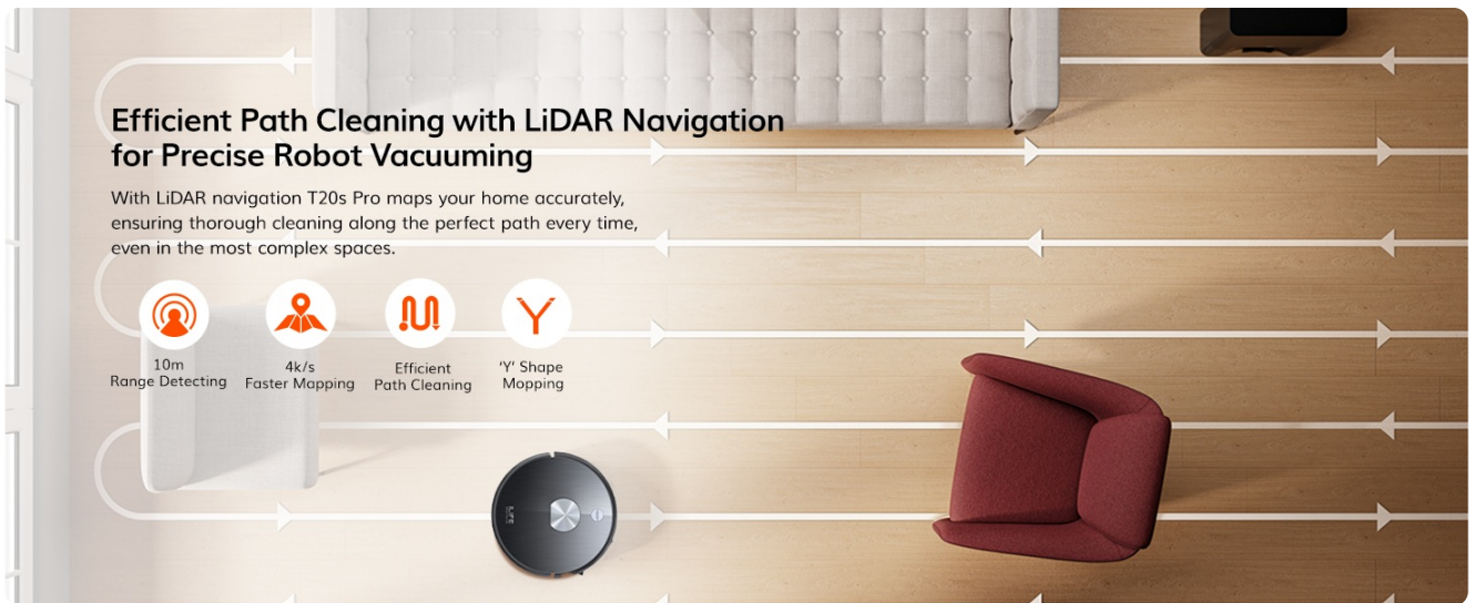
Figure 4: LiDAR navigation ensures precise and efficient path cleaning.