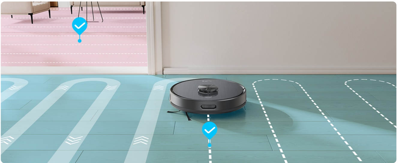
Figure 2: The ILIFE Clean App allows for area designation cleaning, including no-go zones.