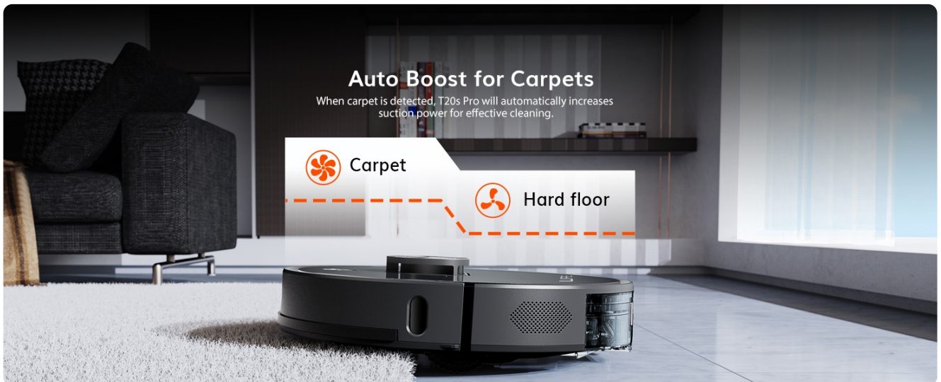
Figure 3: The robot automatically boosts suction when detecting carpets for a deeper clean.

You can customize the suction power and water flow for different floor types and cleaning needs through the ILIFE Clean App. The robot also features an auto-boost function for carpets, increasing suction for deeper cleaning.