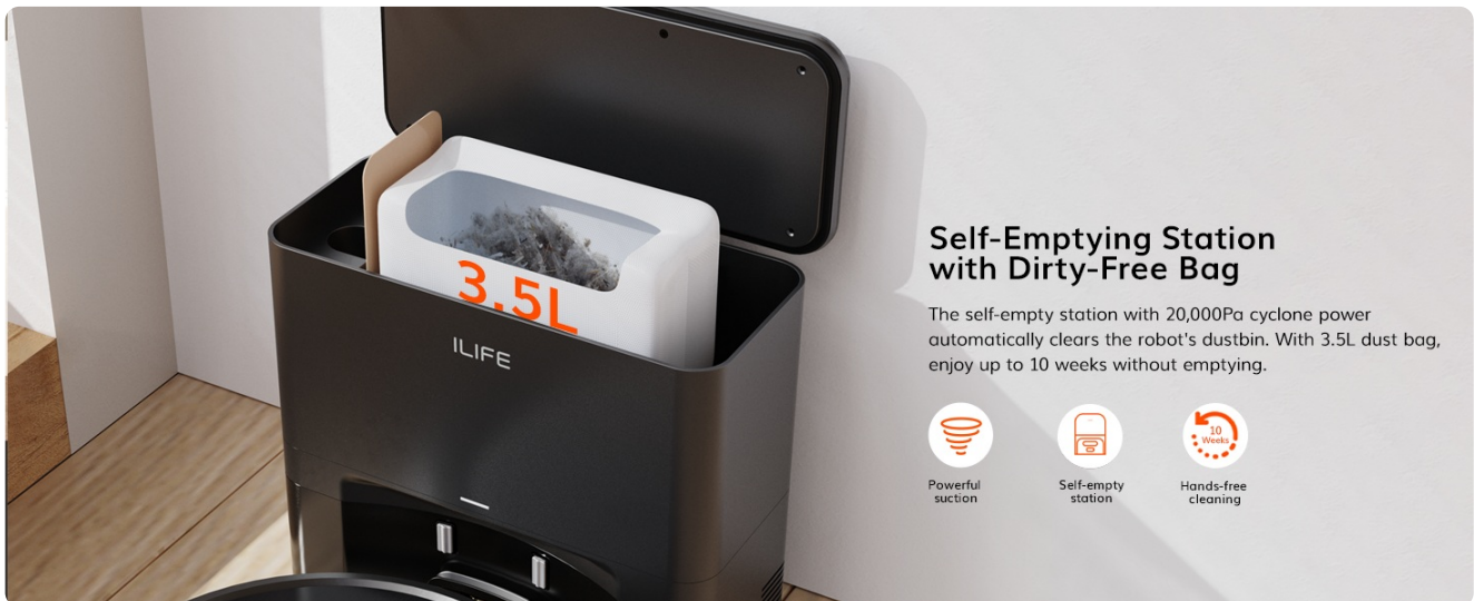
Figure 7: The self-emptying station automatically clears the robot's dustbin into a 3.5L bag.

The self-emptying station features a 3.5L disposable dust bag and 20,000Pa cyclone power, allowing for up to 10 weeks (70 days) of hands-free cleaning without manual emptying.