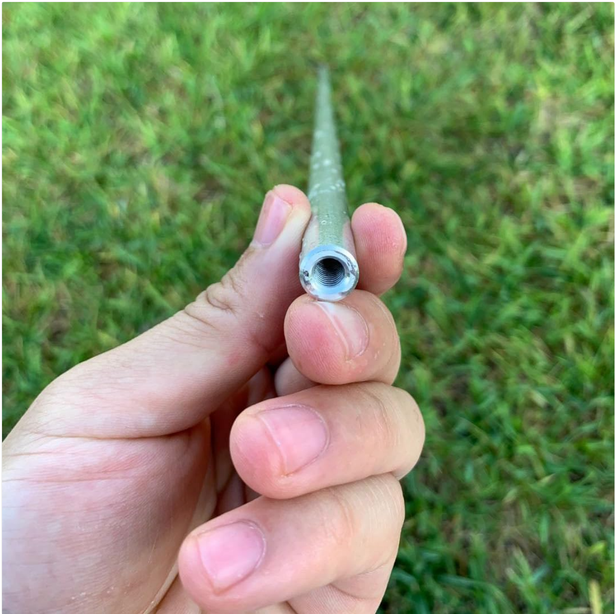
Image 2: A close-up view of the internally threaded end of the bracing rod, ready for bolt attachment.