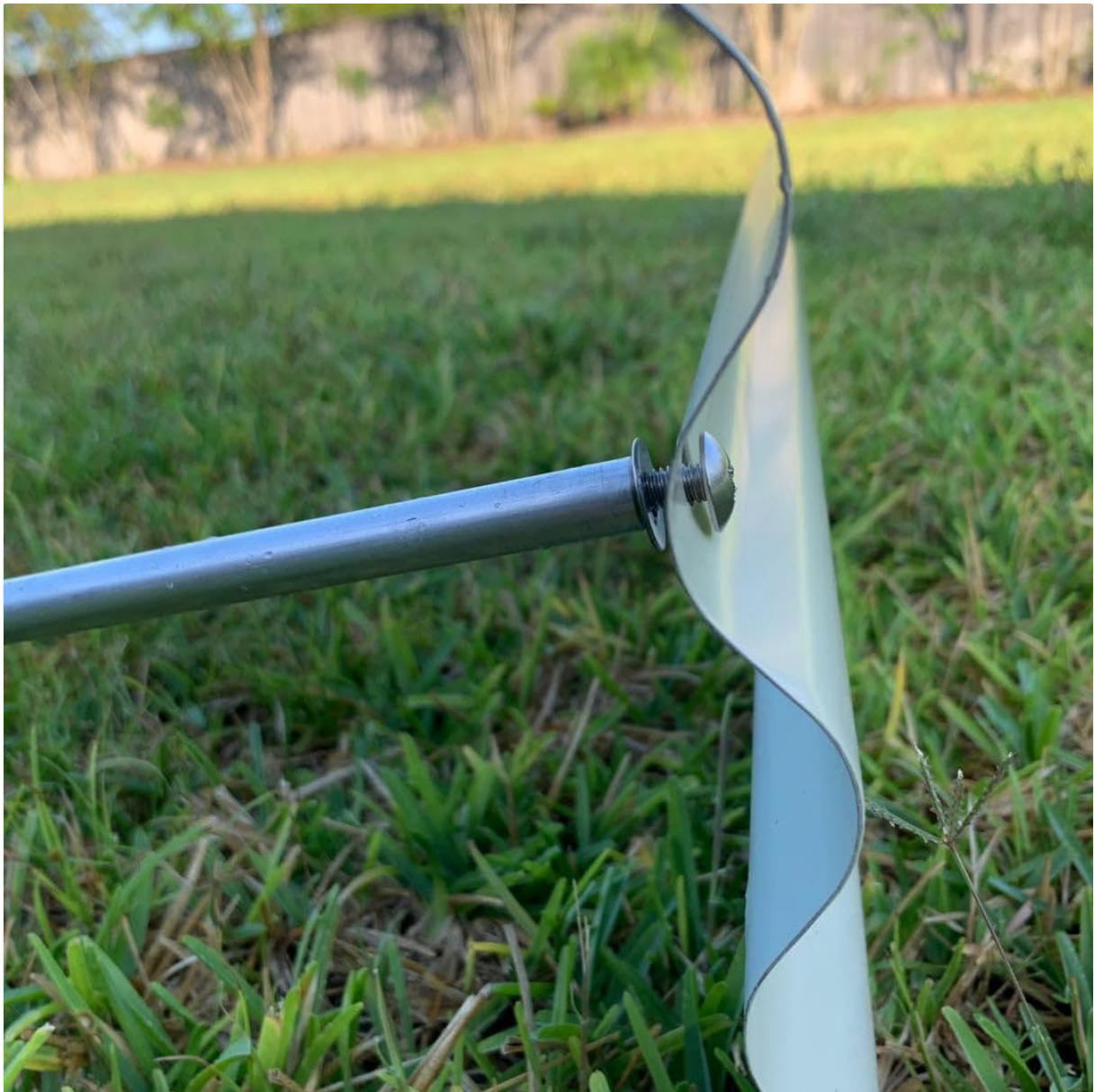
Image 3: The bracing rod securely fastened to the raised bed wall using a bolt and washer.