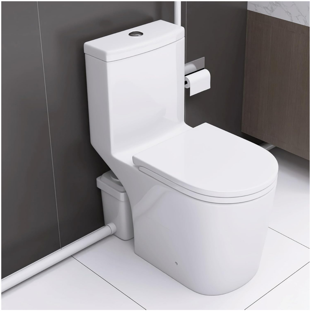
Figure 5.1: Front view of the WinZo Macerating Toilet System, showing the integrated design with the macerator pump positioned behind the toilet.