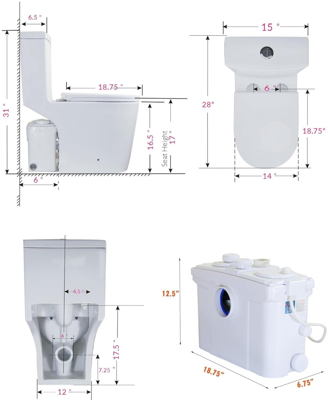
Figure 4.1: Detailed dimensions of the WinZo Macerating Toilet and pump for installation planning. Note: Dimensions may vary by up to 3/8 inch.

Dimension may vary by up to 3/8". It is highly recommended to pull all dimensions of actual model for installation and measuring purposes.