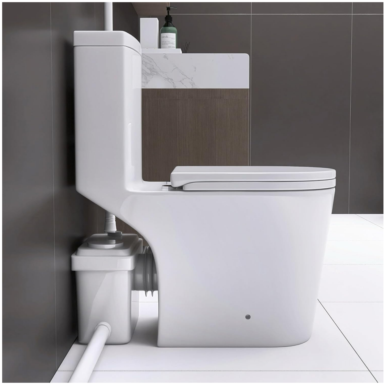
Figure 5.2: Side view of the WinZo Macerating Toilet System, illustrating the compact placement of the macerator pump behind the toilet.