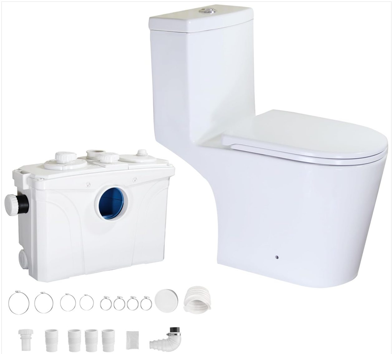
Figure 3.1: WinZo Macerating Toilet System components, including the toilet, macerator pump, and installation accessories.