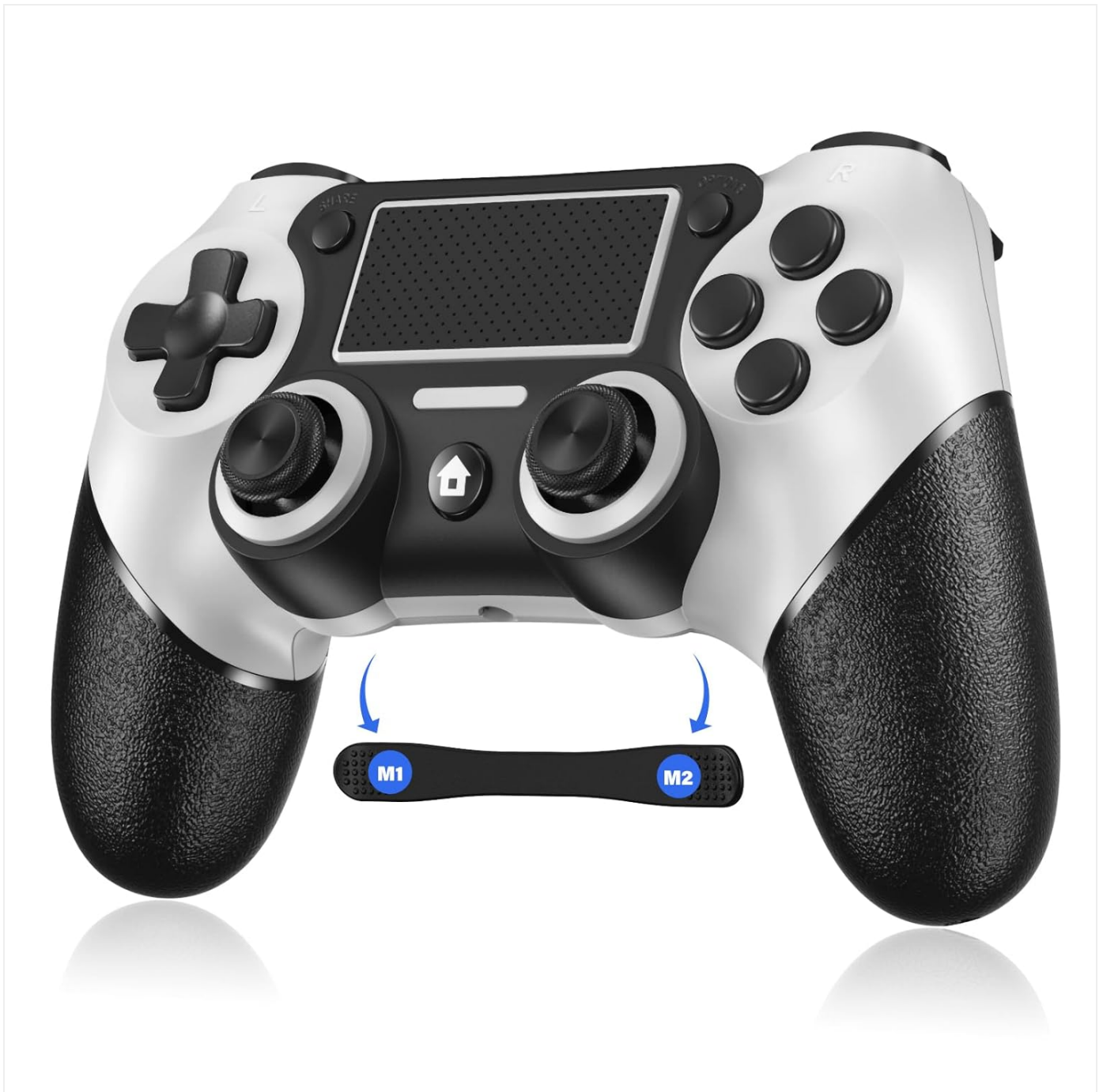
Front view of the Matbip Wireless Controller, showcasing its ergonomic design and button layout.