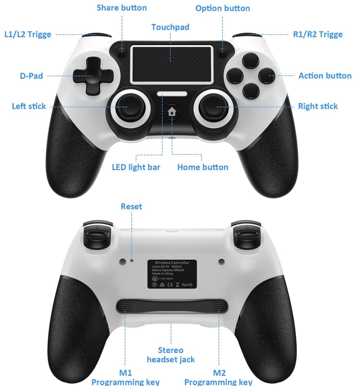
Detailed diagram showing the front and back button layout of the Matbip Wireless Controller.