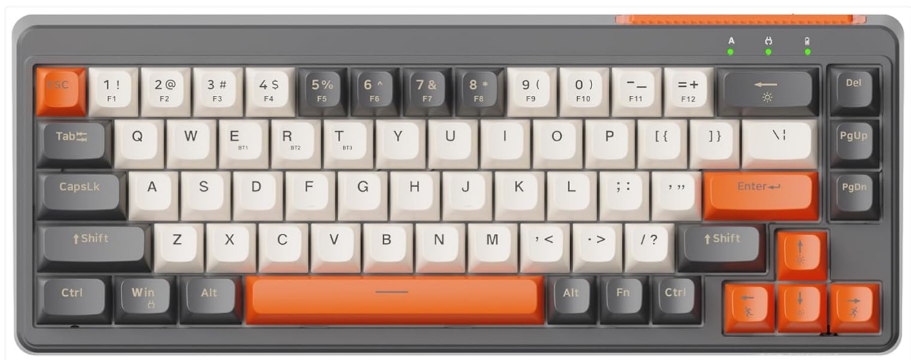
Figure 1: FREEWOLF M68 Wireless Gaming Keyboard (Shimmer color variant)

This manual provides detailed instructions for the FREEWOLF M68 60% Wireless Gaming Keyboard. Please read this manual carefully before using the product to ensure proper operation and longevity.