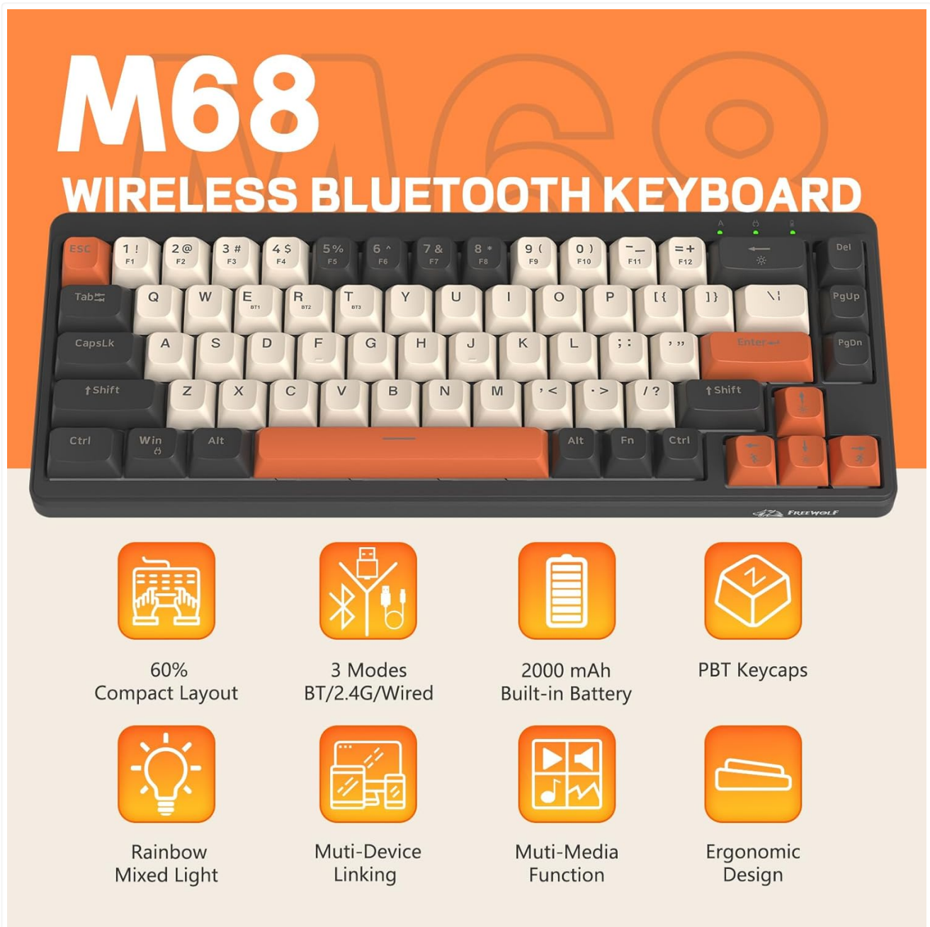
Figure 2: Overview of FREEWOLF M68 key features.