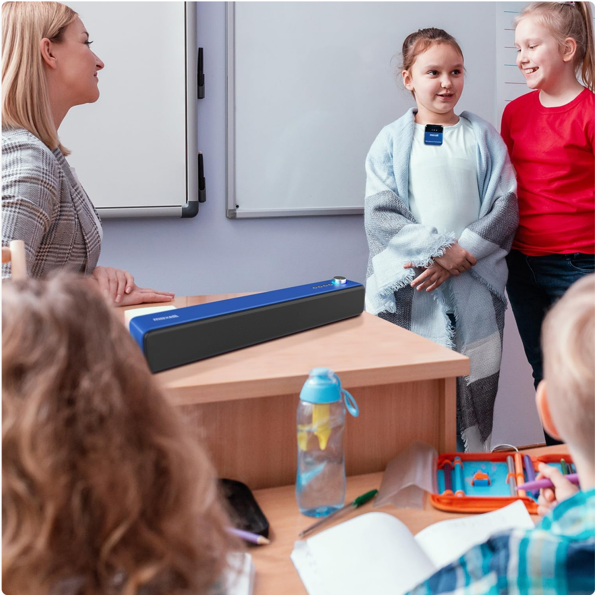
A teacher demonstrating the use of the Maxell 2.4GHz wireless microphone transmitter, clipped to their shirt, with the soundbar amplifying their voice in a classroom setting.