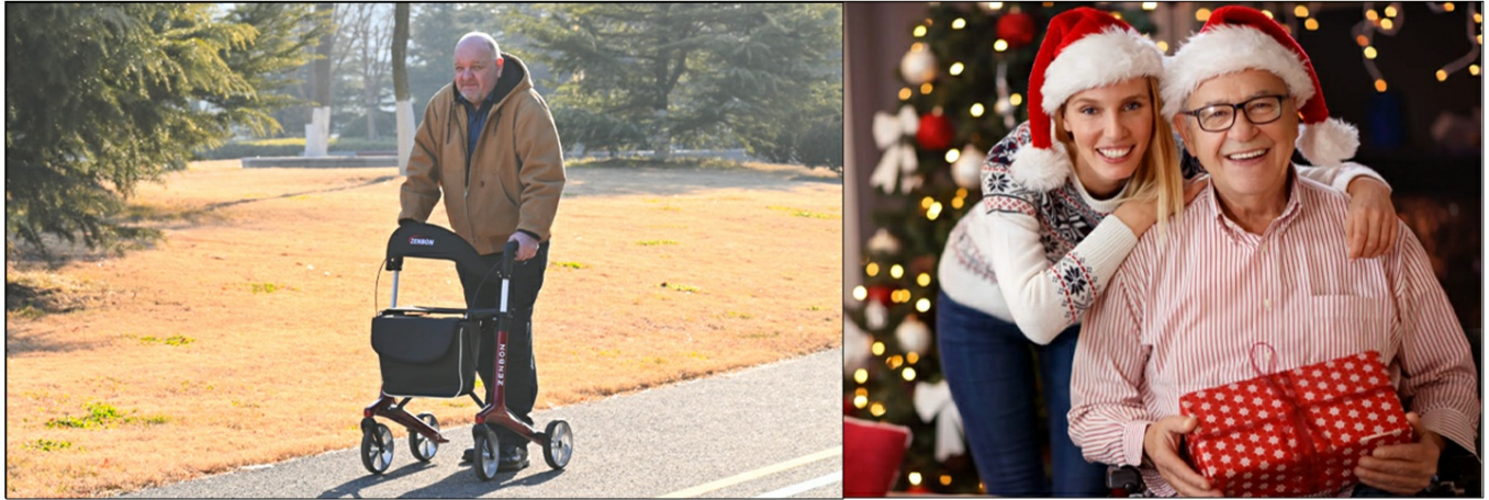
Figure 8: Technical data and dimensions of the ZENBON Rollator Walker.

Give the gift of a rollator walker and empower seniors to embrace limitless possibilities, bid farewell to limitations, and embrace freedom and self-reliance.