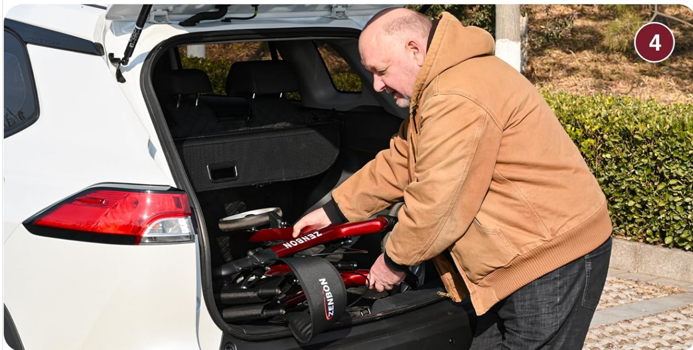
Figure 1: Steps for folding and transporting the rollator walker. The walker folds compactly for easy storage in a vehicle.