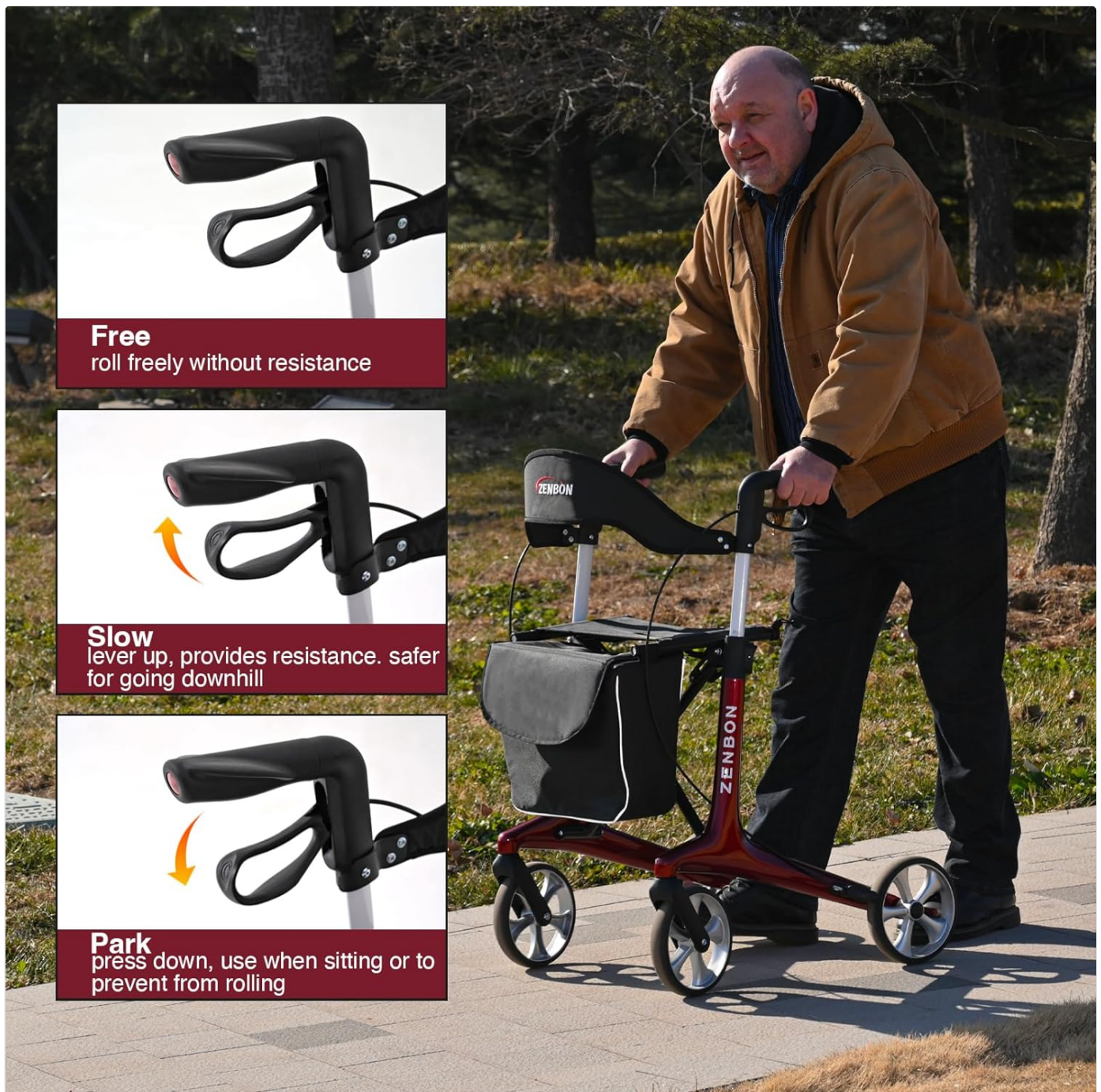
Figure 5: Detailed view of the handbrake functions: Free, Slow (resistance), and Park (locked).