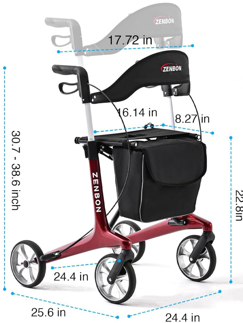
Figure 2: Illustration of adjustable hand grip height and recommended wrist-level positioning for optimal user comfort and safety.