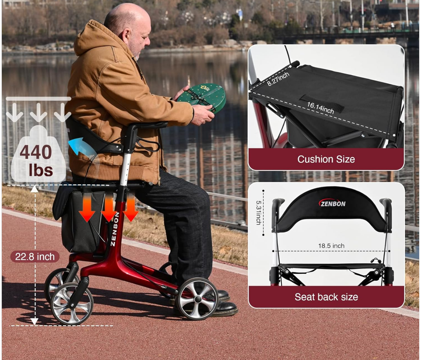
Figure 6: A user seated on the rollator, highlighting the seat's capacity and dimensions for comfortable resting.