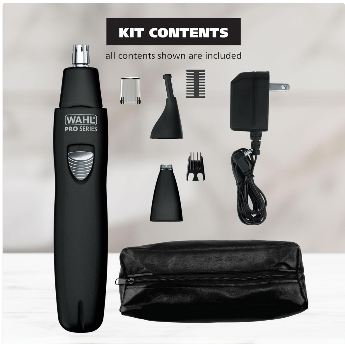
Figure 2: All components included in the Wahl Pro Series Trimmer kit.