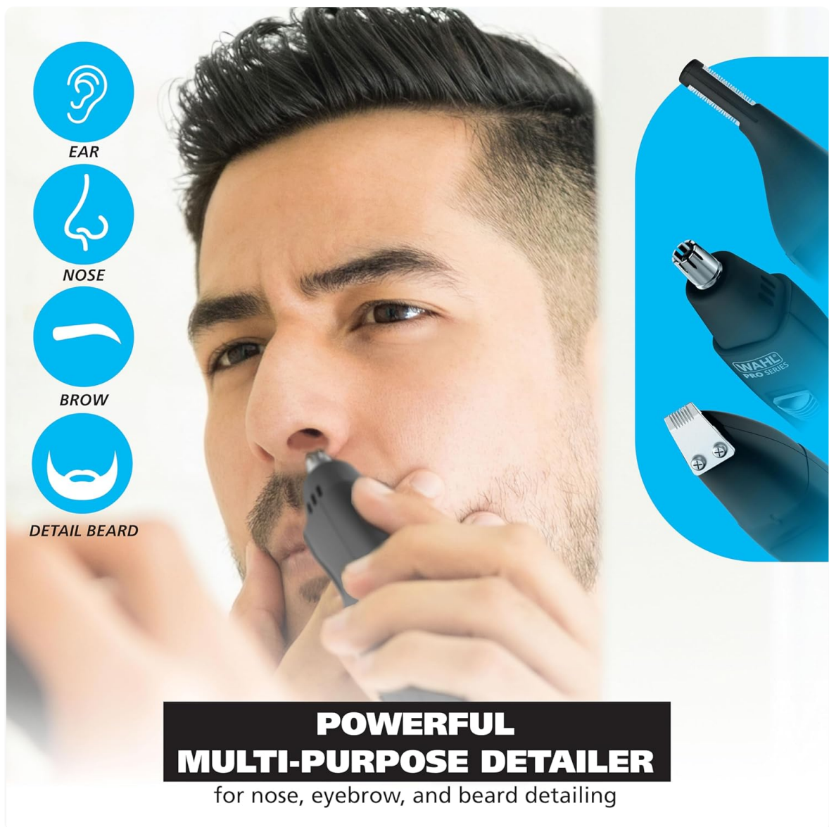
Figure 3: Visual representation of the trimmer's multi-purpose functionality for various facial hair areas.