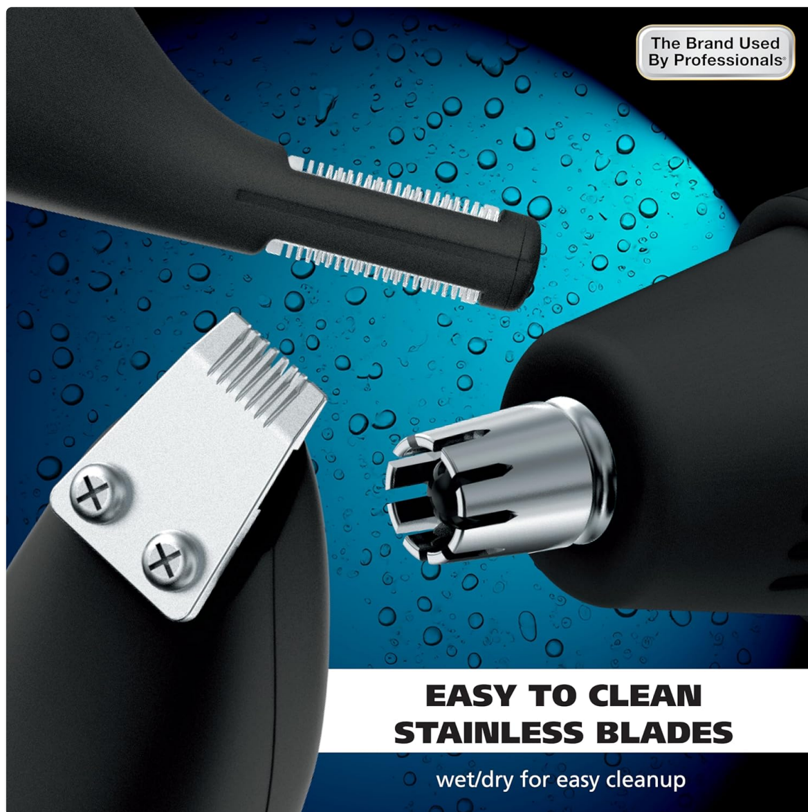
Figure 10: The stainless steel blades are designed for easy cleaning, suitable for both wet and dry use.