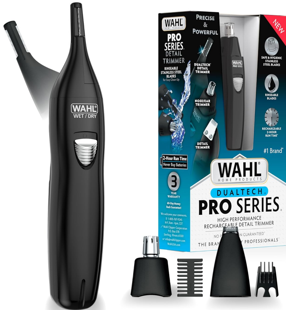
Figure 1: The Wahl Pro Series Trimmer with its various attachments and charging cable.

This kit includes the main trimmer unit, multiple trimming heads, guide combs, a charging adapter, and a storage pouch for organized keeping of all accessories.