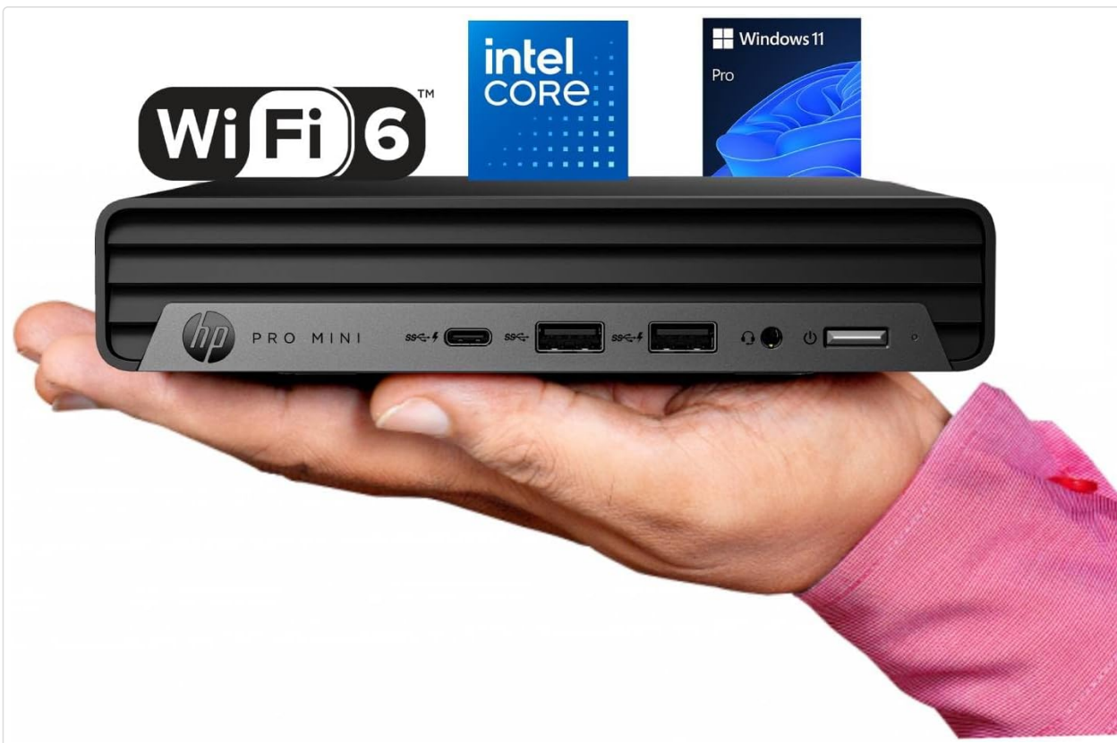
Image: The HP Pro 400 G9 Mini PC, demonstrating its small form factor and front panel connections.