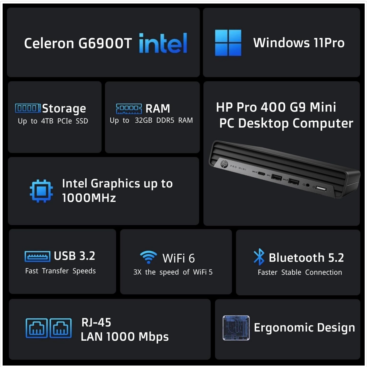
Image: An infographic detailing the core specifications and features of the HP Pro 400 G9 Mini PC.