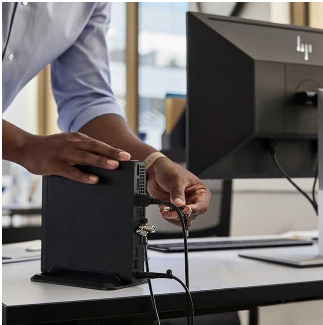
Image: A user connecting display and peripheral cables to the back of the HP Pro 400 G9 Mini PC.