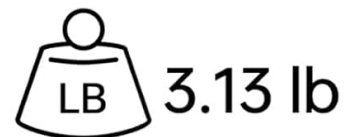
Image: A visual representation of the HP Pro 400 G9 Mini PC's dimensions and weight.