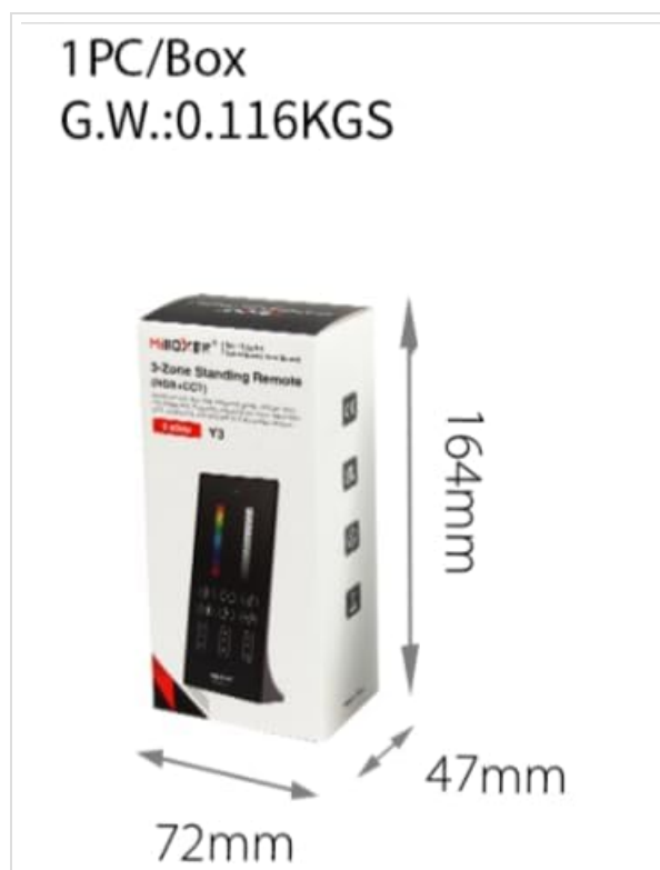
Figure 3: Dimensions of the MiBOXER Y3 Remote Control and its packaging.