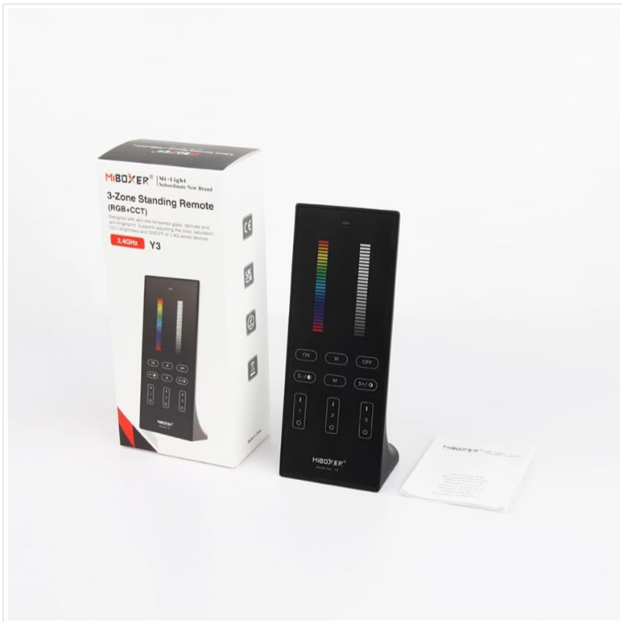
Figure 1: MiBOXER Y3 RGB+CCT Vertical Remote with its retail packaging.