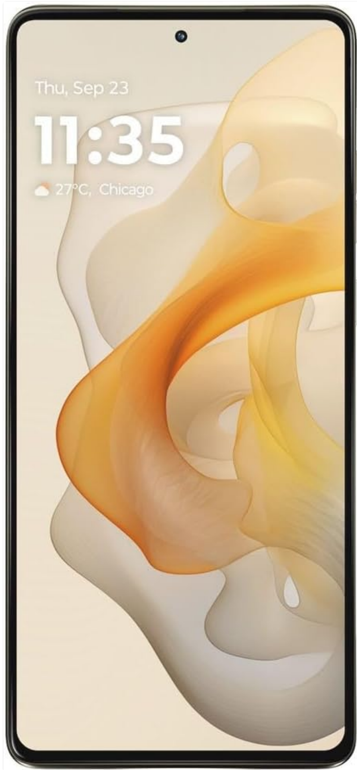
Front view of the Motorola Moto G Stylus 5G 2024, highlighting the 6.7-inch pOLED display and front camera.