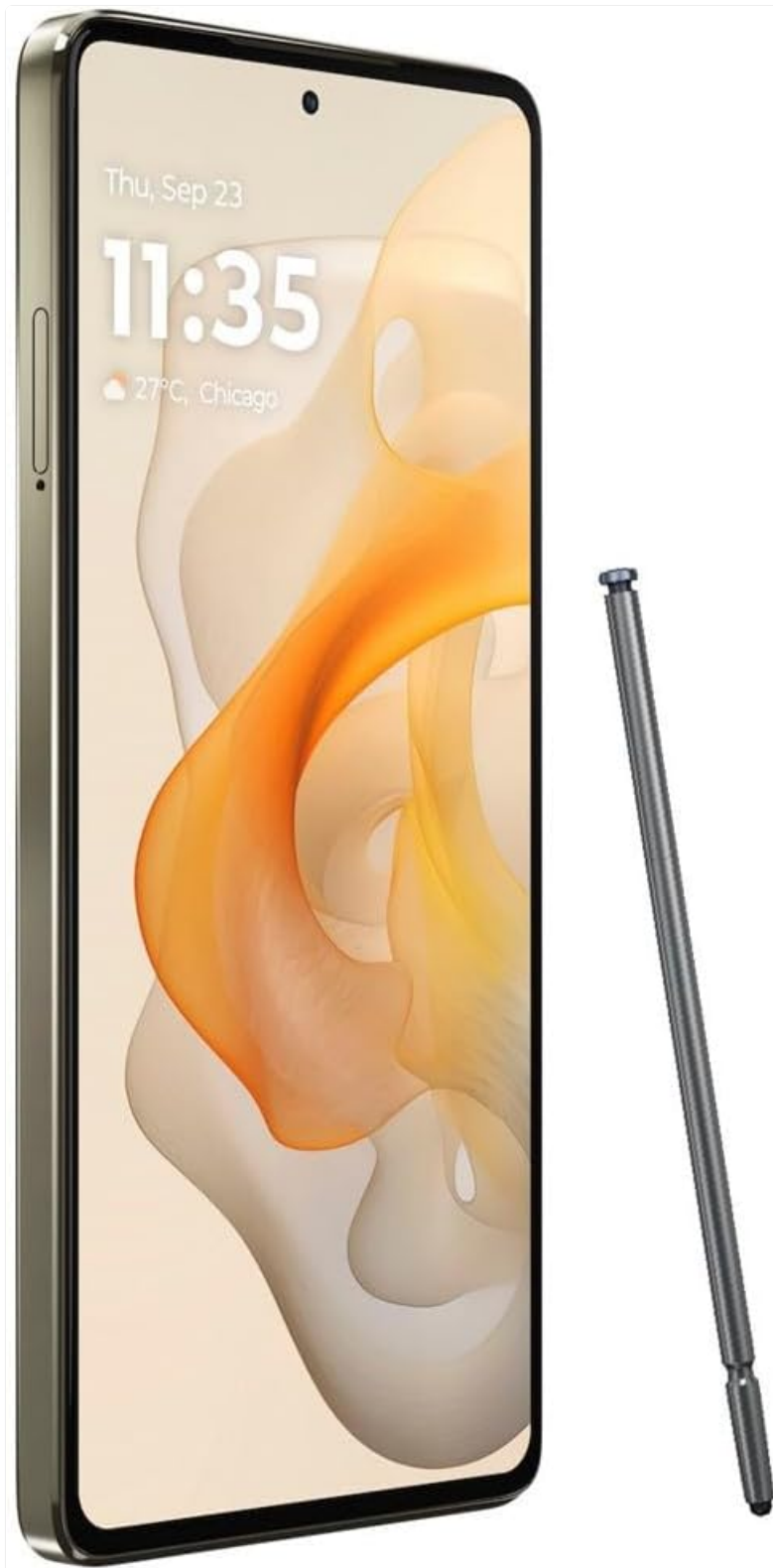
A side view of the Motorola Moto G Stylus 5G 2024, with its stylus shown next to the device, illustrating its integrated design.