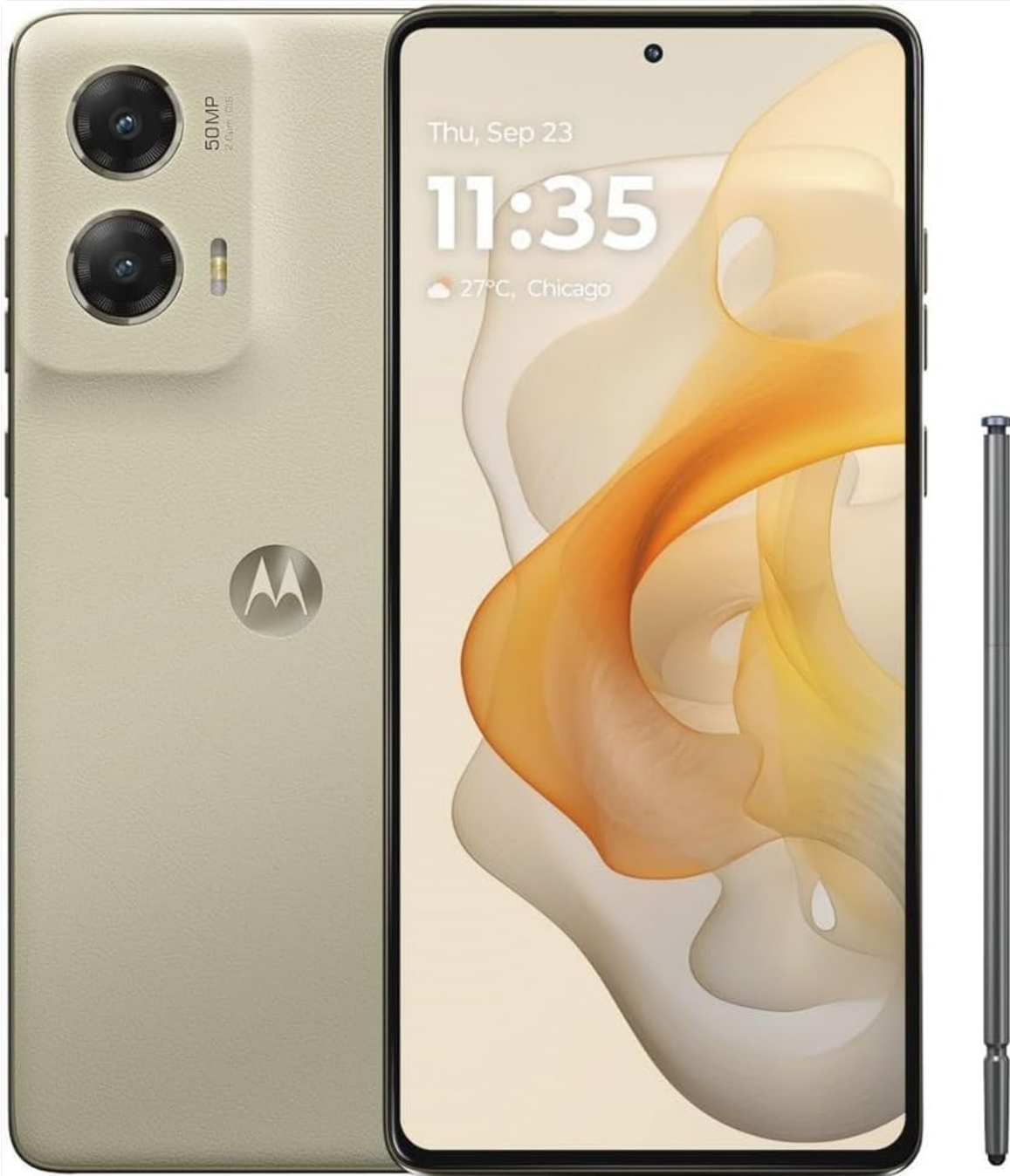
This image displays the Motorola Moto G Stylus 5G 2024 in Caramel Latte color, showing both the front screen with a digital clock and date, and the rear panel with its dual camera system and Motorola logo. The stylus is shown alongside the phone.