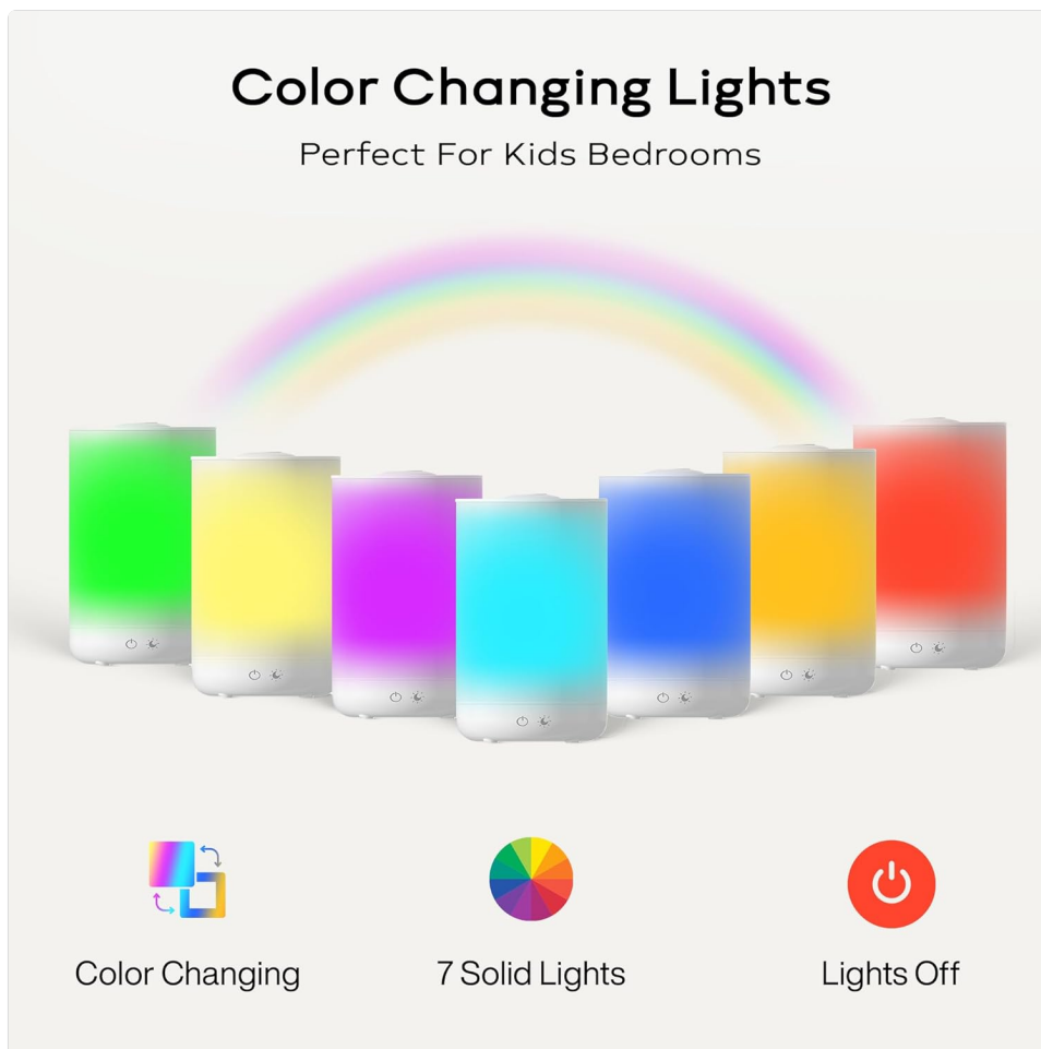
Image: A visual representation of the humidifier's color-changing light feature, showcasing various solid light options and indicating the ability to turn the lights off.