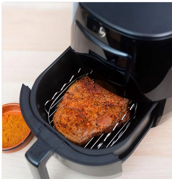
Image: View inside the air fryer basket, showing the

Image: The digital LCD screen operation panel for easy control and the separate basket design, featuring an integrated non-stick liner with a grill for easy cleaning.