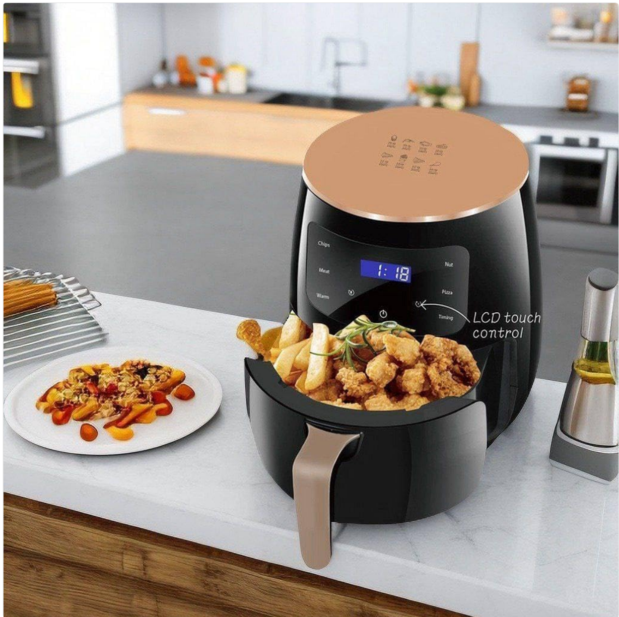
Image: The Silver Crest Air Fryer in operation, with the basket pulled out to show crispy fried food, demonstrating its use in a modern kitchen environment.