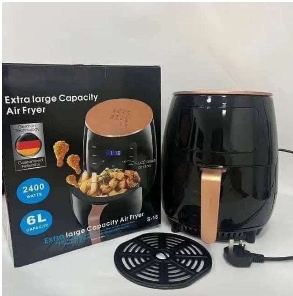
Image: The Silver Crest Air Fryer alongside its packaging, illustrating the product and its initial presentation.