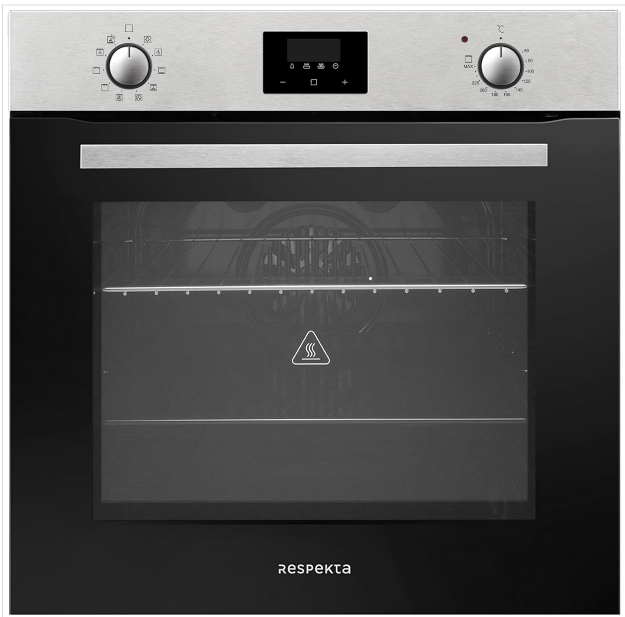
Front view of the Respekta AB 141-26 built-in oven, showcasing its sleek design with a stainless steel control panel and black glass door.