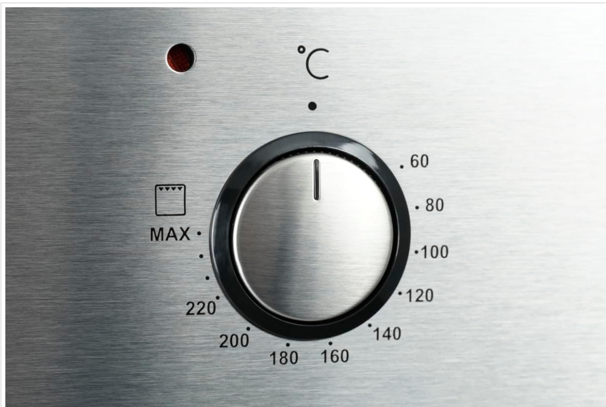
Close-up of the temperature control knob, showing markings from 60°C to 250°C and a maximum setting.

The oven allows temperature settings from 60°C to 250°C. Use the temperature knob to select the desired heat.