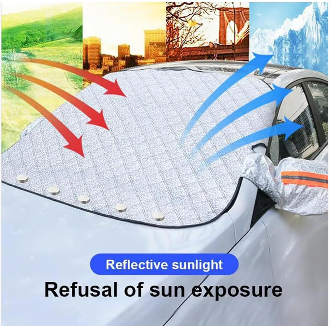
Image: The windshield cover installed on a car, illustrating its reflective properties against sunlight, preventing sun exposure.