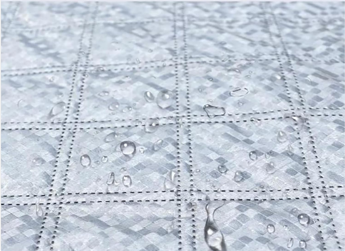
Image: A close-up view of the cover's waterproof material, showing water beads on the surface.