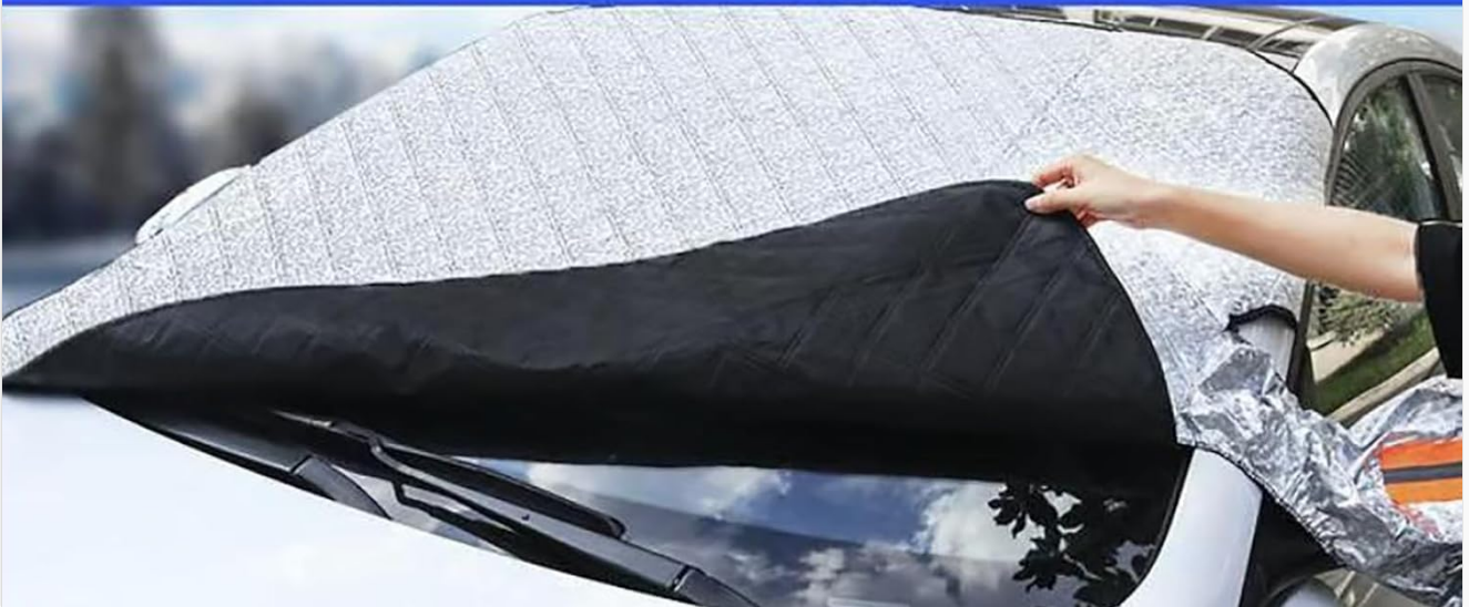
Image: The windshield cover fully installed on a car, demonstrating its coverage and protection against heavy snow.