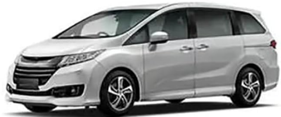
Image: Illustrations of various car types (sedan, hatchback, SUV, minivan) demonstrating the cover's universal fit.