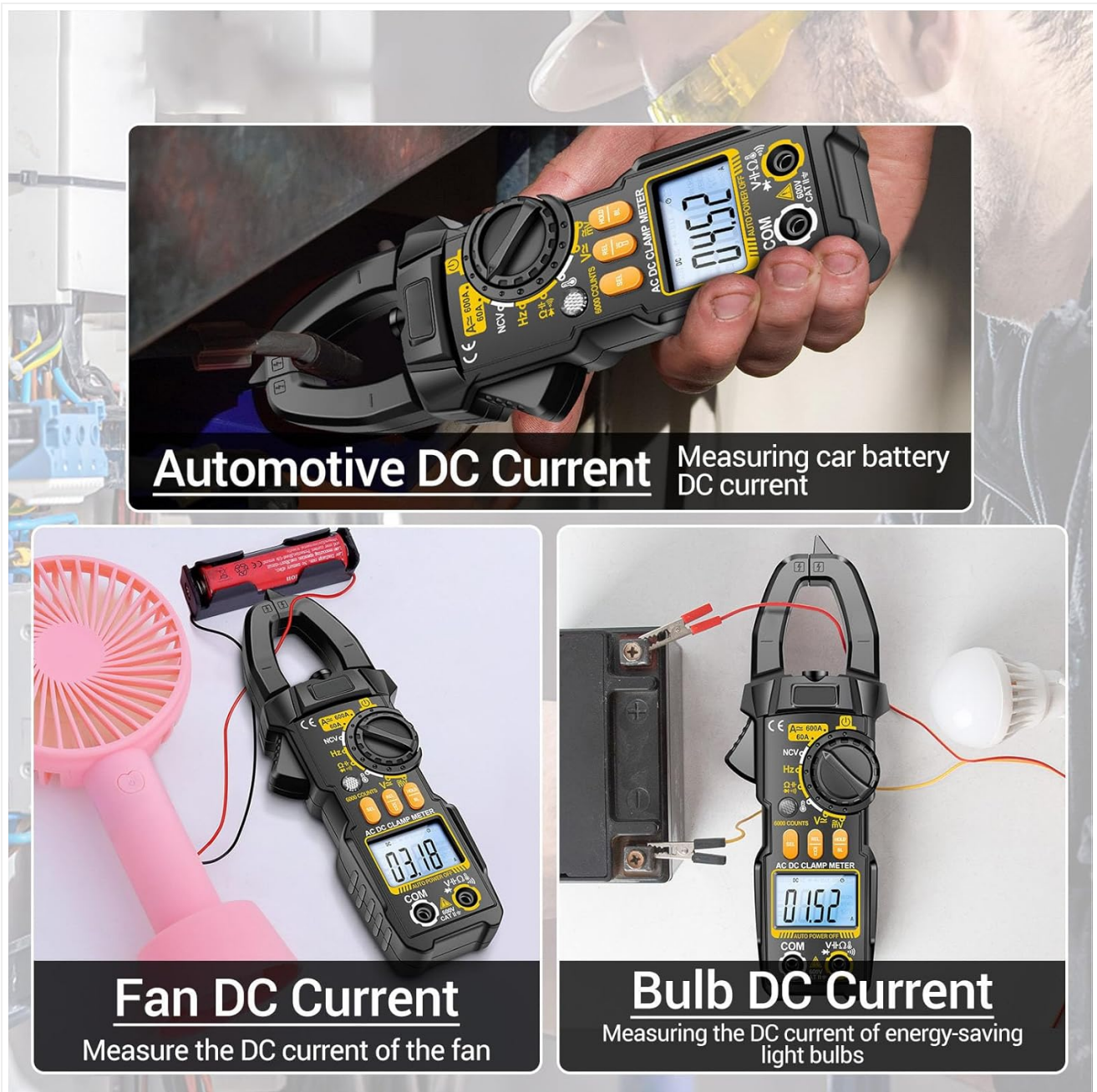
Figure 5.3: Examples of DC current measurement, including automotive battery current, fan current, and bulb current.