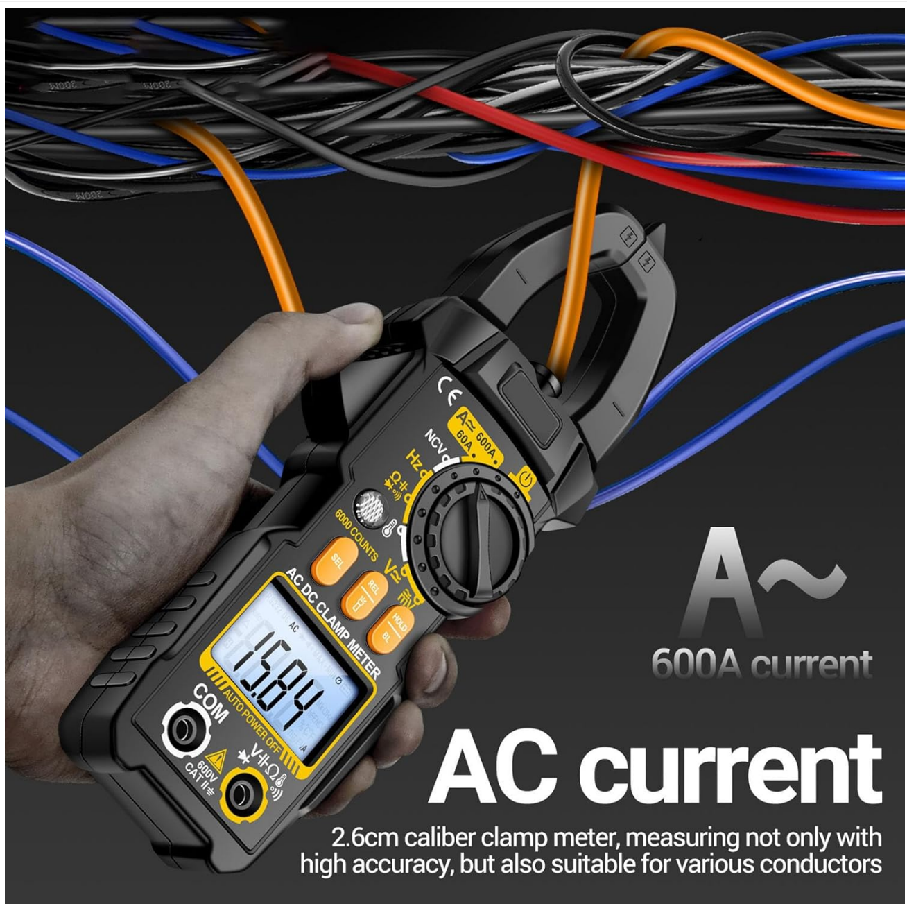
Figure 5.1: Measuring AC current by clamping around a single conductor. The meter displays the current value.

4. Read the AC current value on the LCD display.