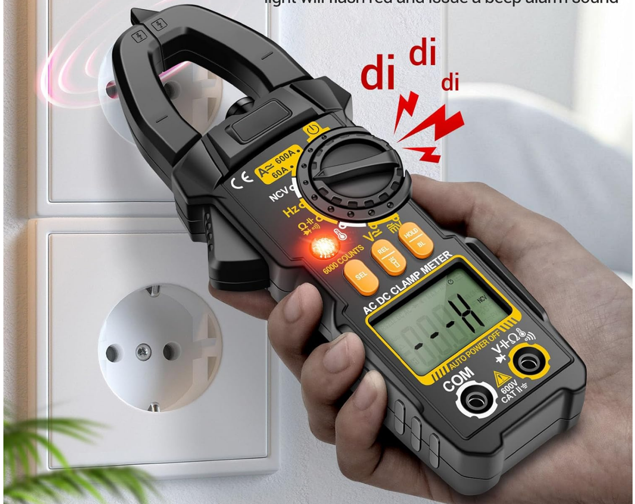
Figure 5.5: Demonstrating NCV detection near an electrical outlet. The meter indicates voltage presence with light and sound.

When a nearby AC voltage is detected, the indicator light will flash red and issue a beep alarm sound