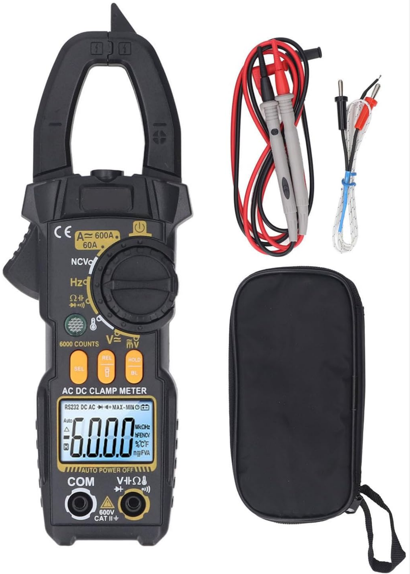
Figure 3.2: The PN108 Digital Clamp Meter along with its standard accessories, including test leads, a temperature probe, and a storage bag.