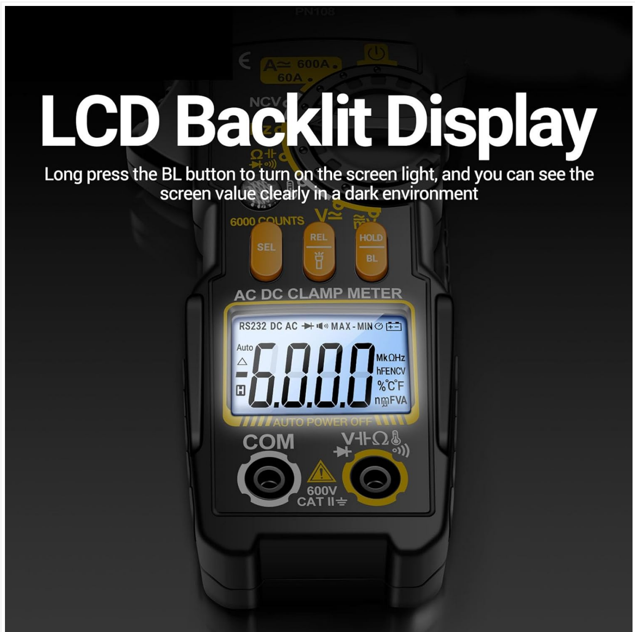
Figure 5.6: The PN108's LCD display with backlight activated, ensuring clear readings in dark environments.

Long press the BL button to turn on the screen light, and you can see the screen value clearly in a dark environment