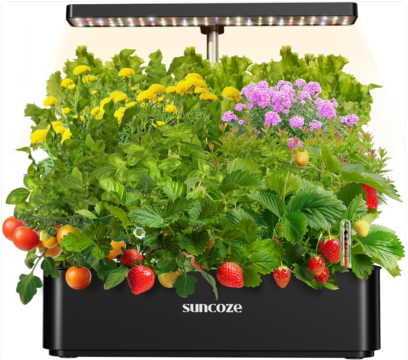
Figure 1.1: The SUNCOZE Hydroponics Growing System Kit with a variety of thriving plants, including strawberries, tomatoes, and leafy greens.