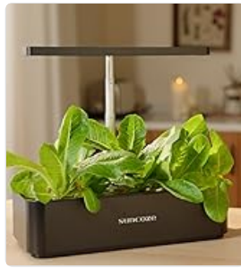
Figure 6.1: A detailed view of the user-friendly design, highlighting the built-in water inlet for easy refilling of water and nutrients, and the clear water indicator to monitor tank levels.