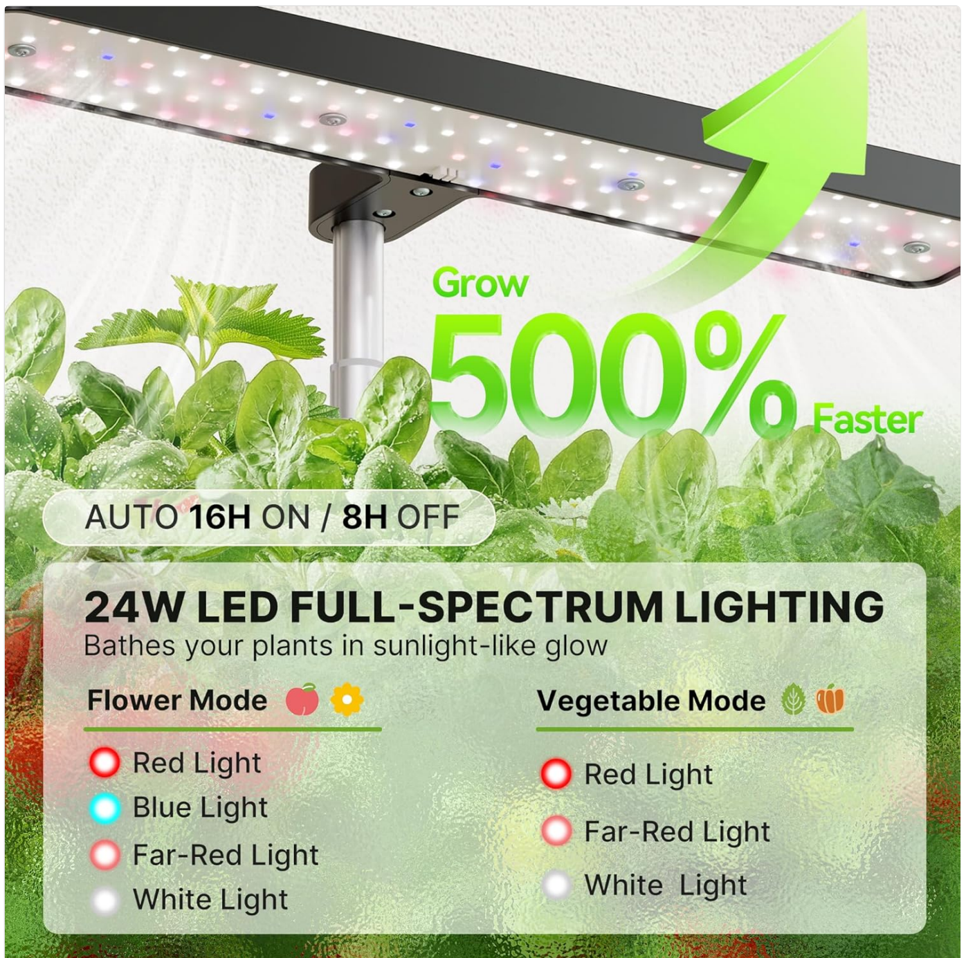
Figure 5.1: Illustration of the 24W LED full-spectrum lighting, showing the different light compositions for Flower Mode (Red, Blue, Far-Red, White Light) and Vegetable Mode (Red, Far-Red, White Light).