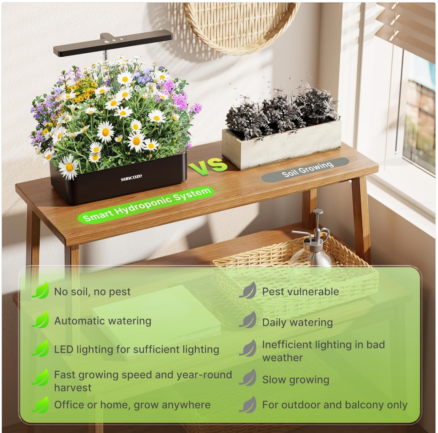
Figure 1.2: A visual comparison highlighting the benefits of the Smart Hydroponic System over traditional soil growing, emphasizing no soil, no pests, automatic watering, and efficient LED lighting.