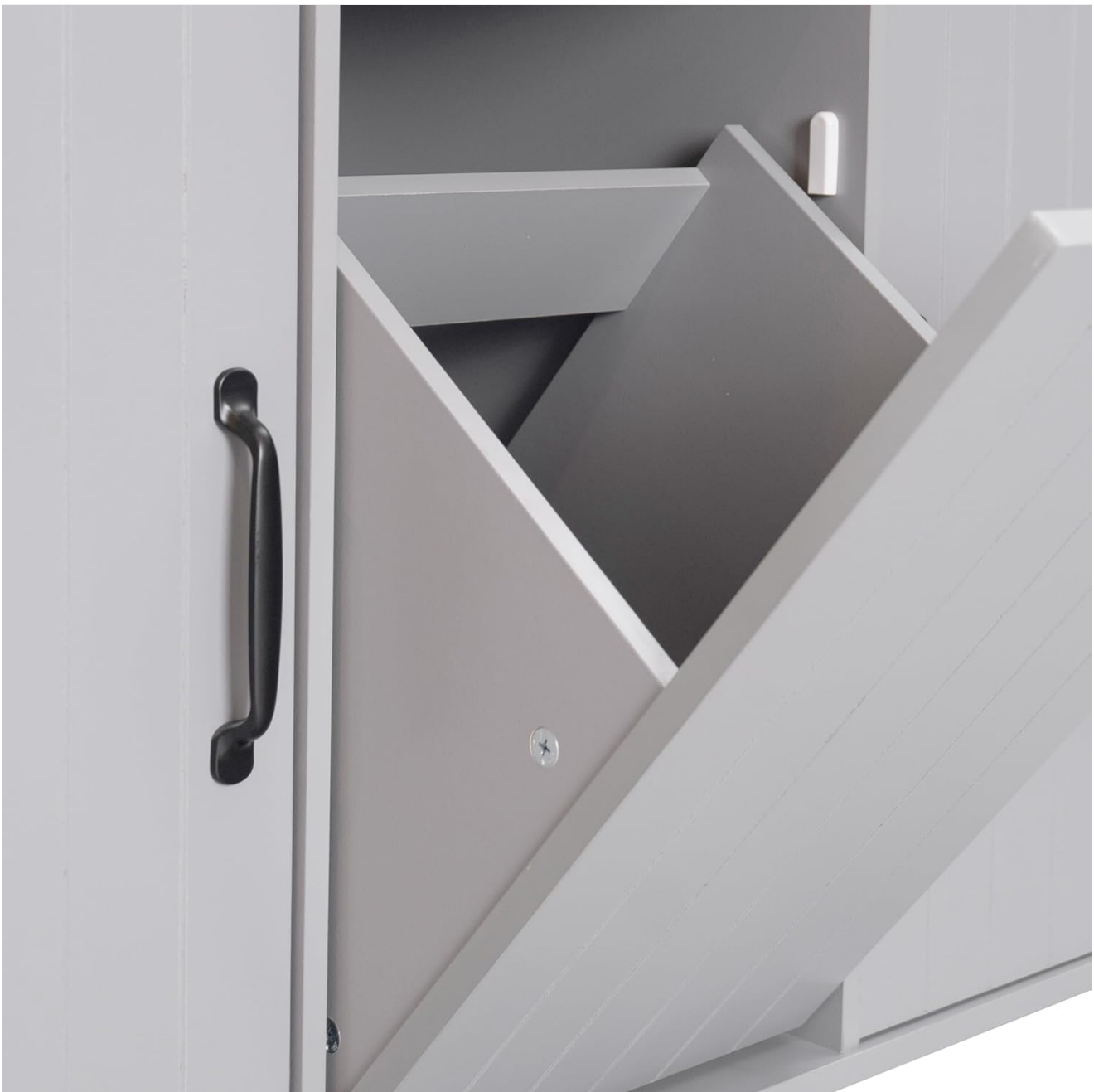
Figure 6: Tilt-Out Trash Can Mechanism. This image highlights the internal structure that allows the trash can to tilt forward for use.