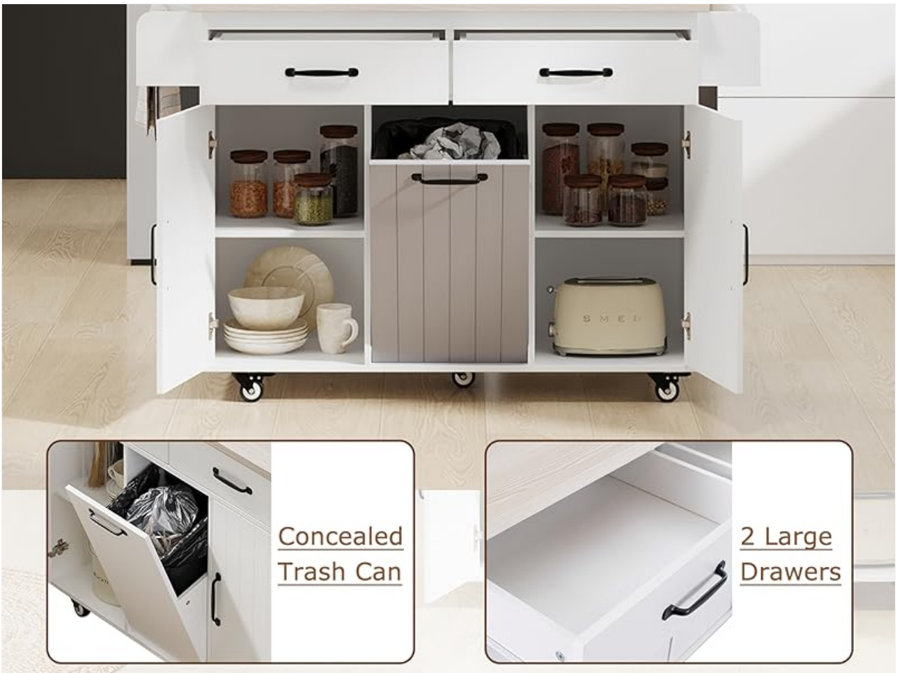
Figure 5: Concealed Trash Can and Drawers. A detailed view of the tilt-out trash can feature and the spacious drawers.