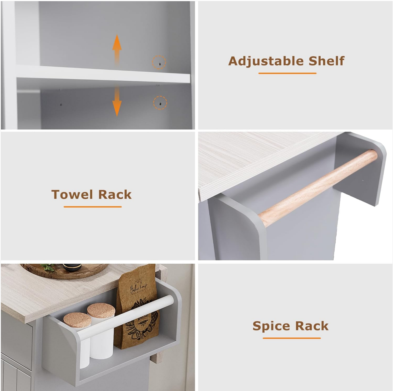
Figure 3: Adjustable Shelf, Towel Rack, and Spice Rack. Close-up images demonstrating the functionality of these integrated storage features.