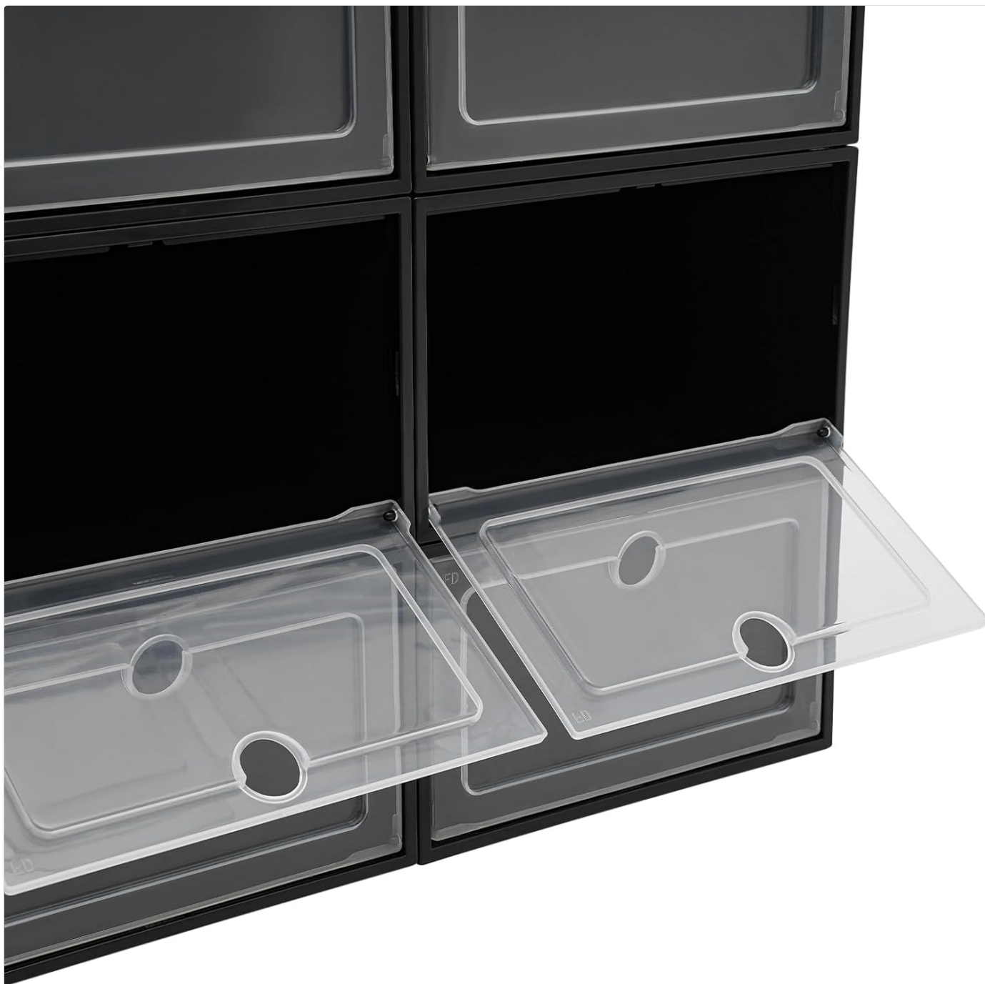
Figure 4.2: Detail of the clear flip lid mechanism.