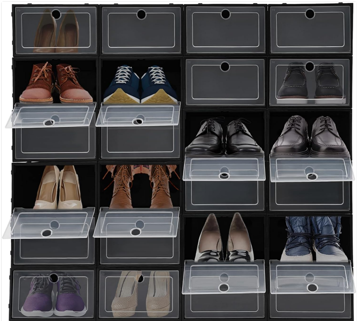
Figure 1.1: Overview of the Pxolerig 24 Pack Stackable Shoe Boxes, showcasing their design and capacity.