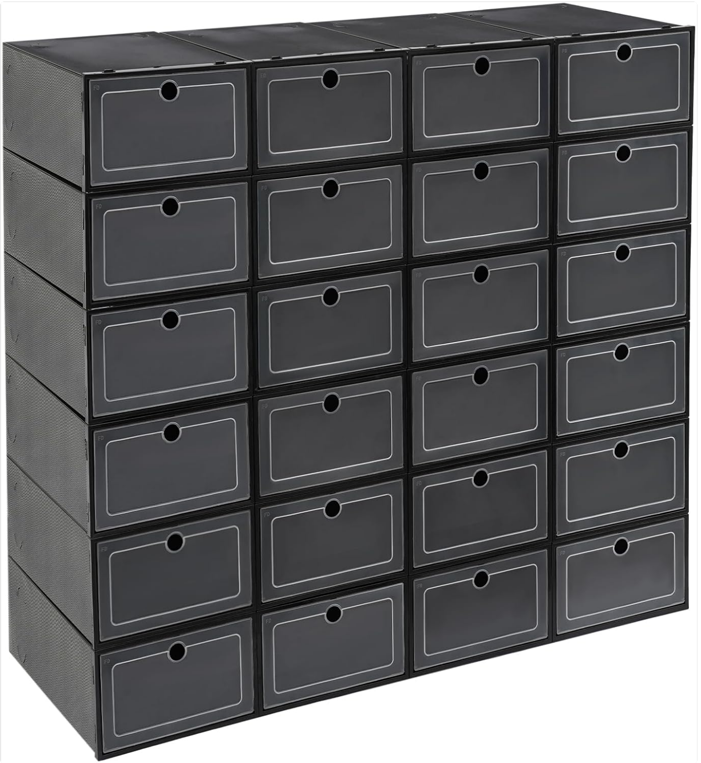
Figure 4.1: Assembled shoe boxes ready for use or stacking.