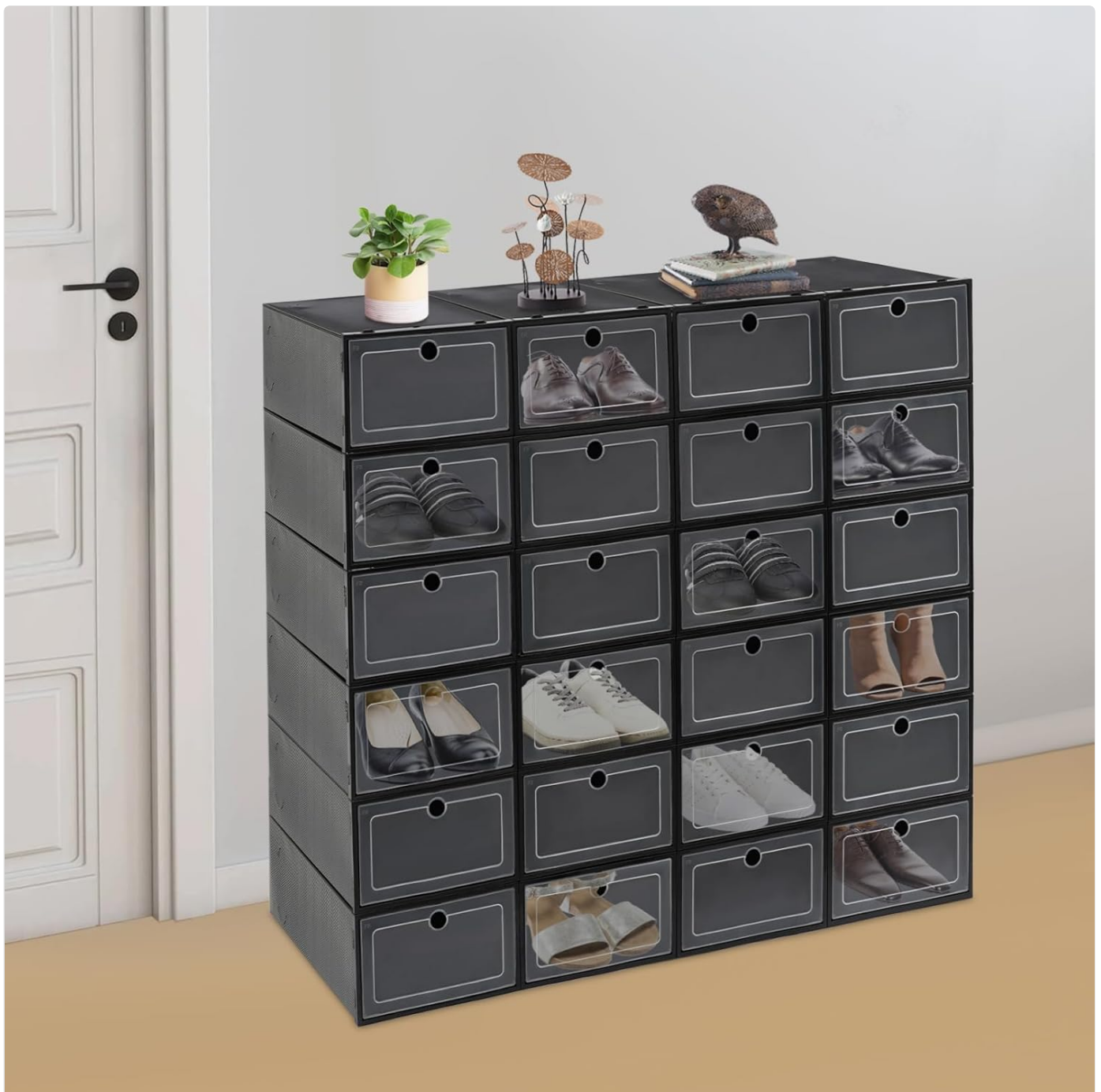
Figure 5.1: Example of stacked shoe boxes in a home environment.