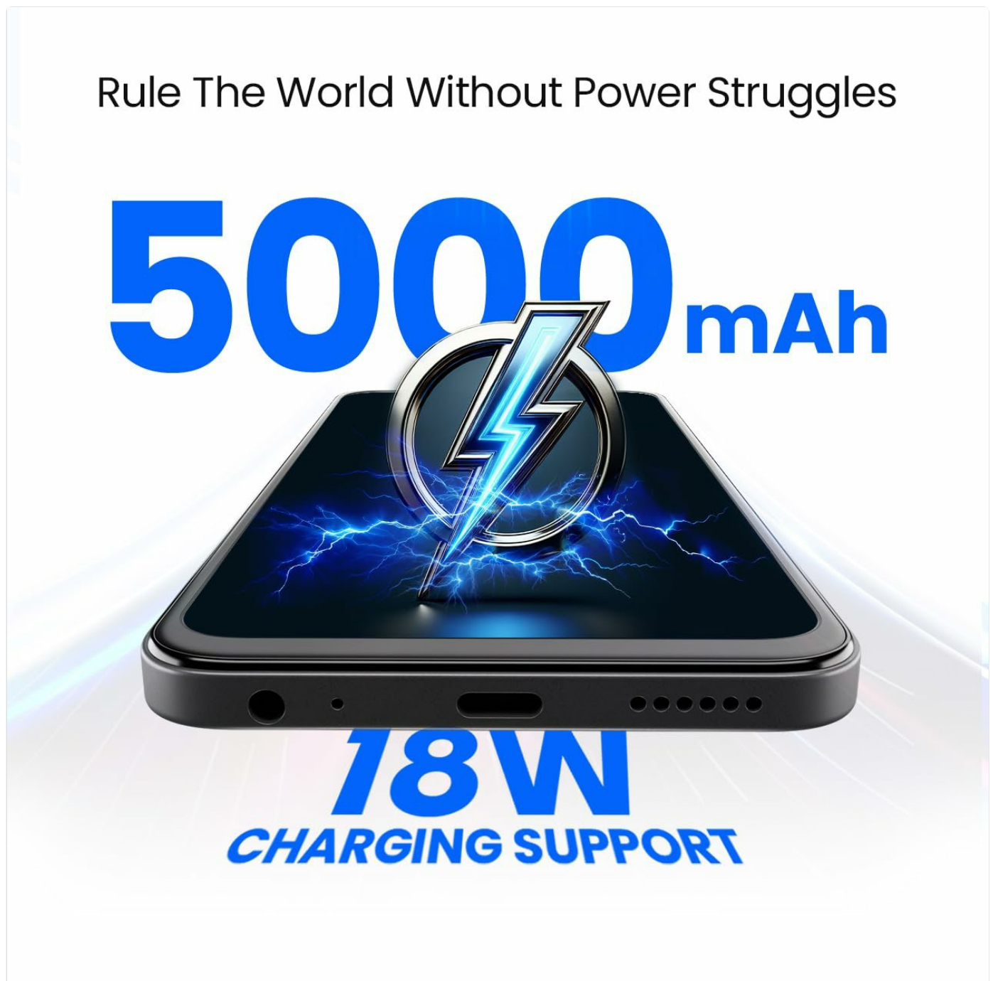
Image 3.1: Bottom view of the Tecno Spark 30C 5G, showing the USB-C charging port and speaker grille.