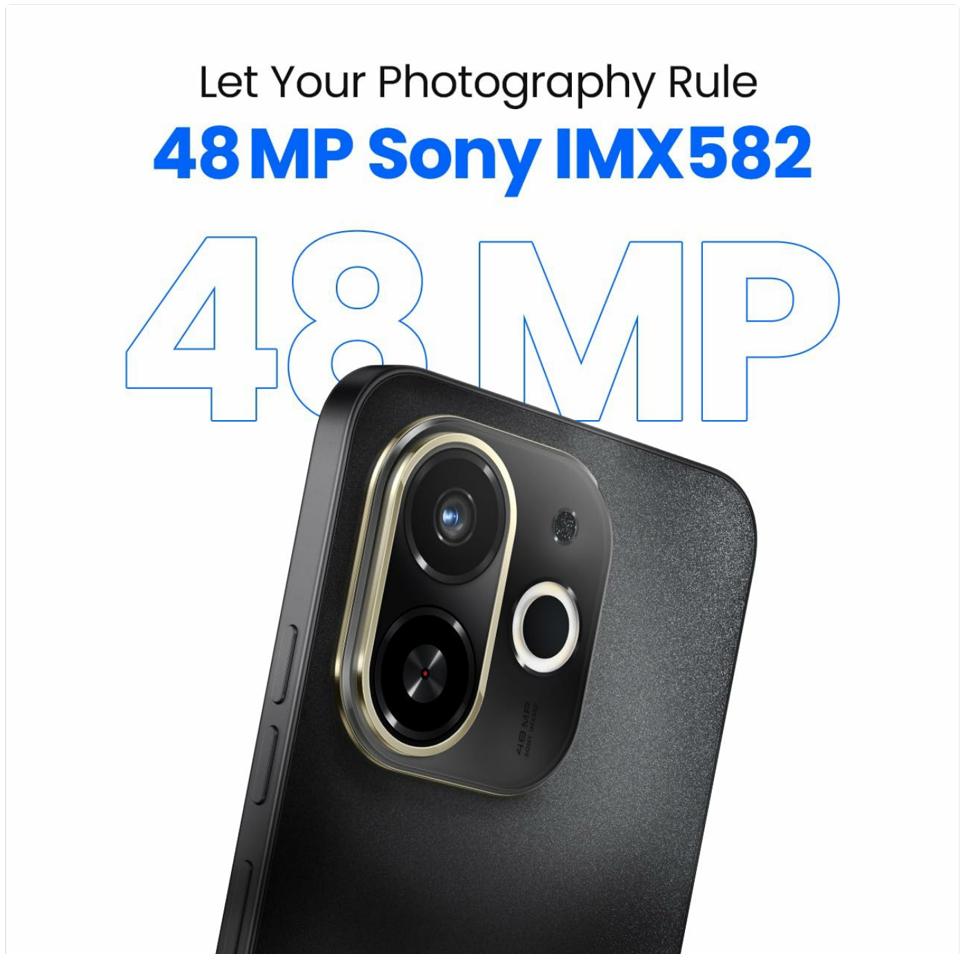
Image 4.2: Close-up of the Tecno Spark 30C 5G's rear camera module, highlighting the 48MP Sony AI Camera lens.