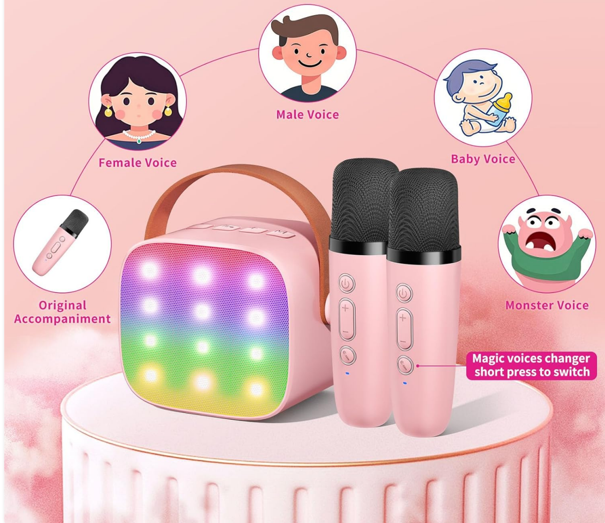
Image: A visual guide to the five voice-changing modes available on the microphones, including options for female, male, baby, and monster voices, along with the original accompaniment mode.

FIVE MAGIC SOUNDS ADD SOME EXCITEMENT TO YOUR KARAOKE PARTY!