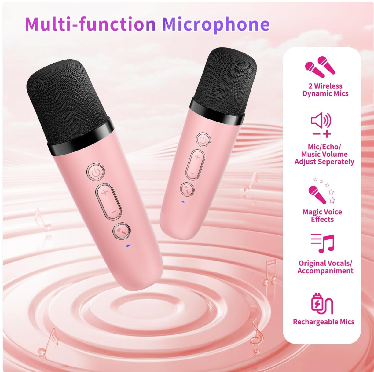
Image: A close-up of the two pink multi-function wireless microphones, showing their control buttons and highlighting features like volume adjustment, magic voice effects, and rechargeability.