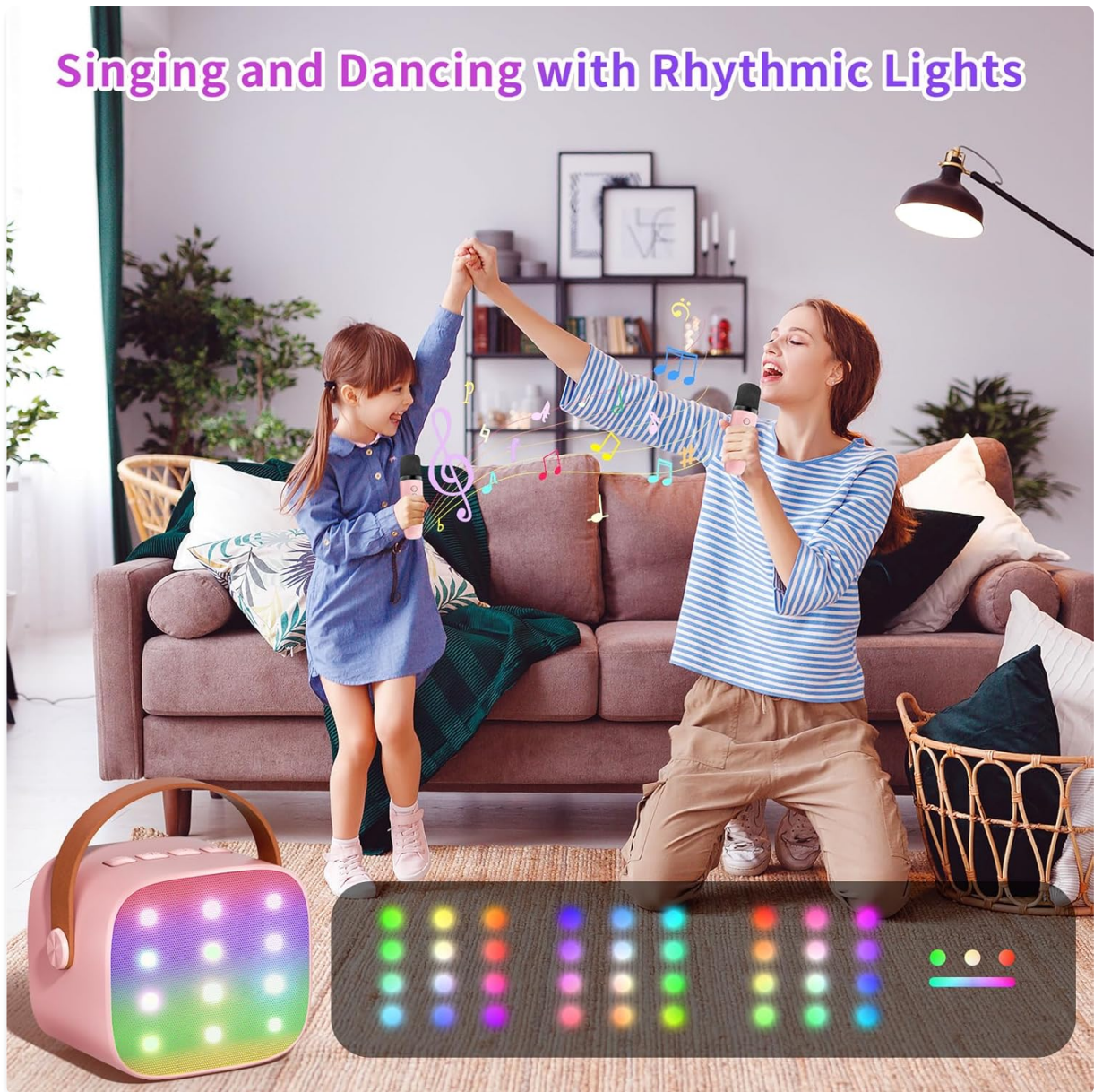
Image: A mother and child enjoying a karaoke session, with the speaker's rhythmic LED lights illuminating the scene, enhancing the party atmosphere.