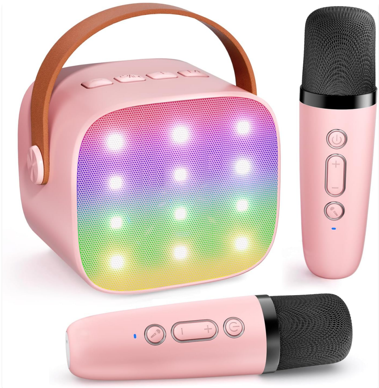
Image: The Haomuren Mini Karaoke Machine K1-Pink, featuring the main speaker unit and two wireless microphones, ready for use.