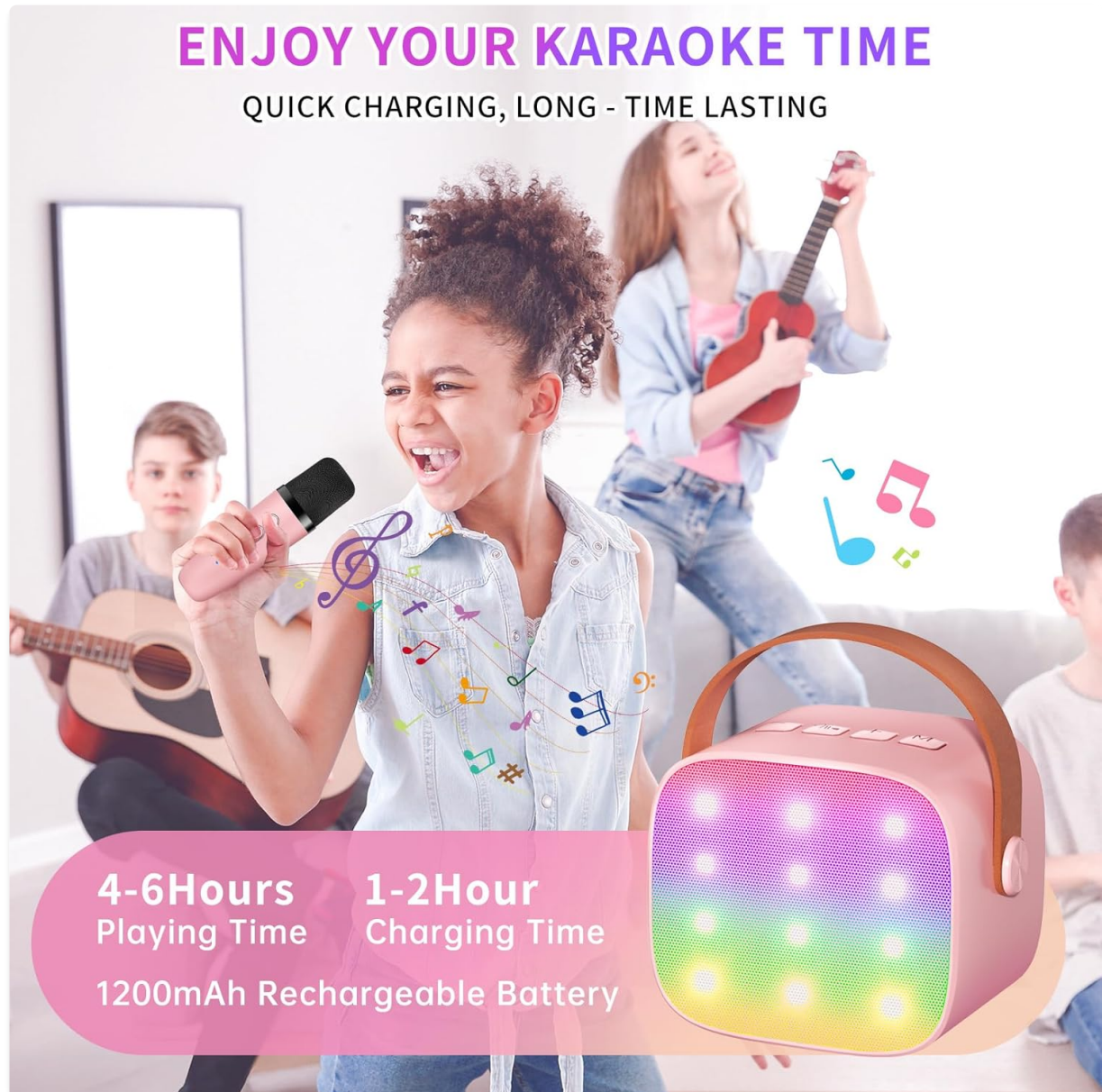
Image: A young girl enthusiastically singing into a microphone, with the karaoke speaker in the foreground, illustrating the product's long battery life and quick charging capabilities.

The mini karaoke machine is equipped with an 1800mAh high-efficiency lithium-ion battery, providing up to 5 hours of uninterrupted music playback at 50% volume. Each kids' microphone has a built-in 600mAh high-efficiency lithium-ion battery.