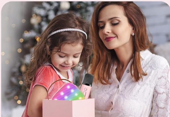
Children' s gifts