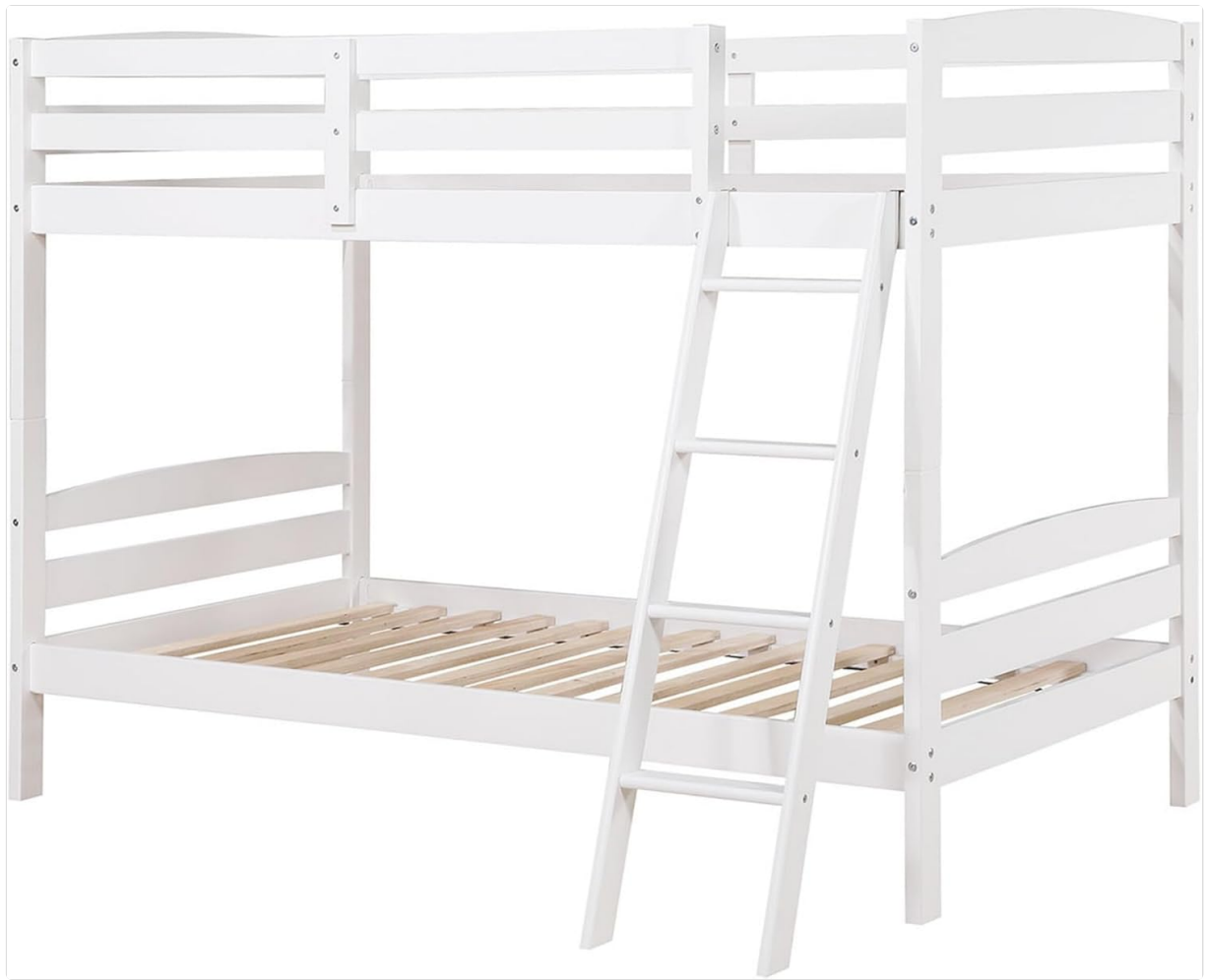
Image 4.1: An overview of the bunk bed structure, useful for visualizing assembly steps.