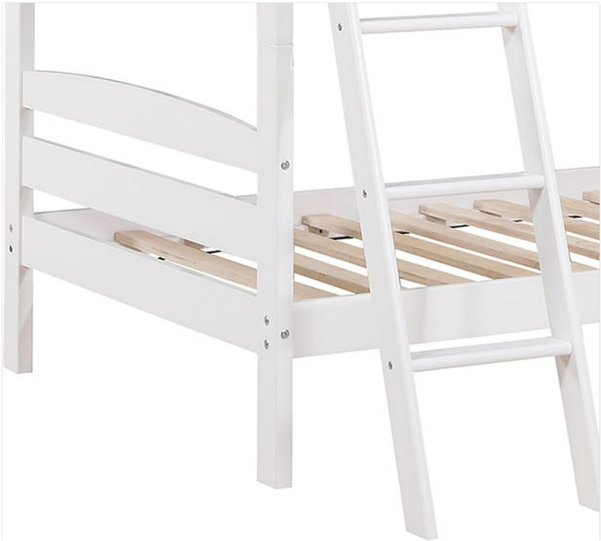
Image 4.2: Detail of the ladder attachment point, illustrating how the ladder connects to the bed frame.