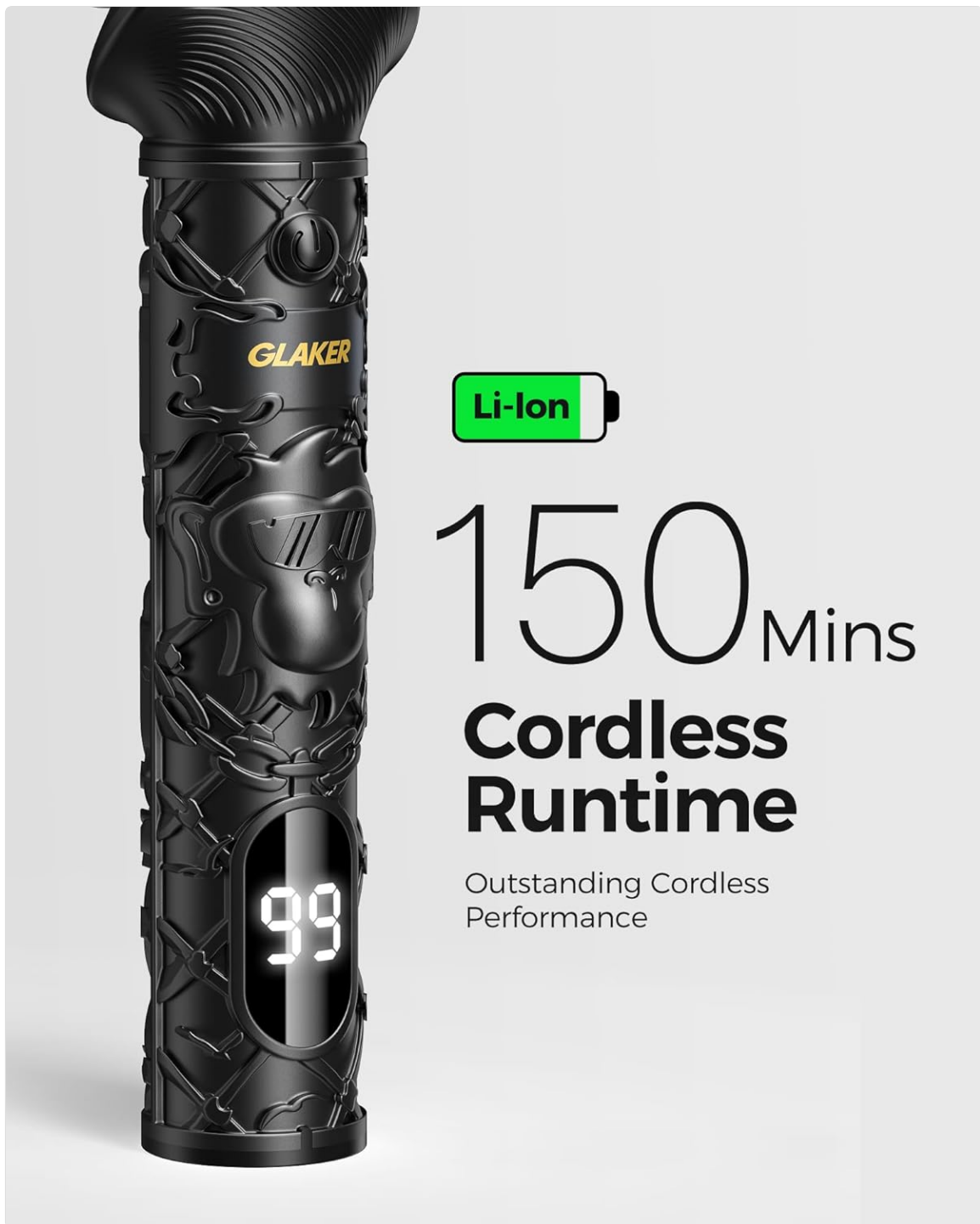
Figure 5: The GLAKER trimmer's handle showing the digital LED display with '99' (indicating 99% battery) and text highlighting its 150 minutes of cordless runtime.