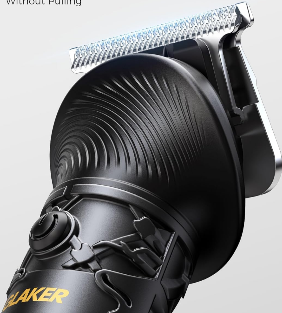
Figure 3: A detailed view of the trimmer's 440C steel blades, highlighting their precision design for clean cuts.

440C Steel Blades Cut Precisely Without Pulling