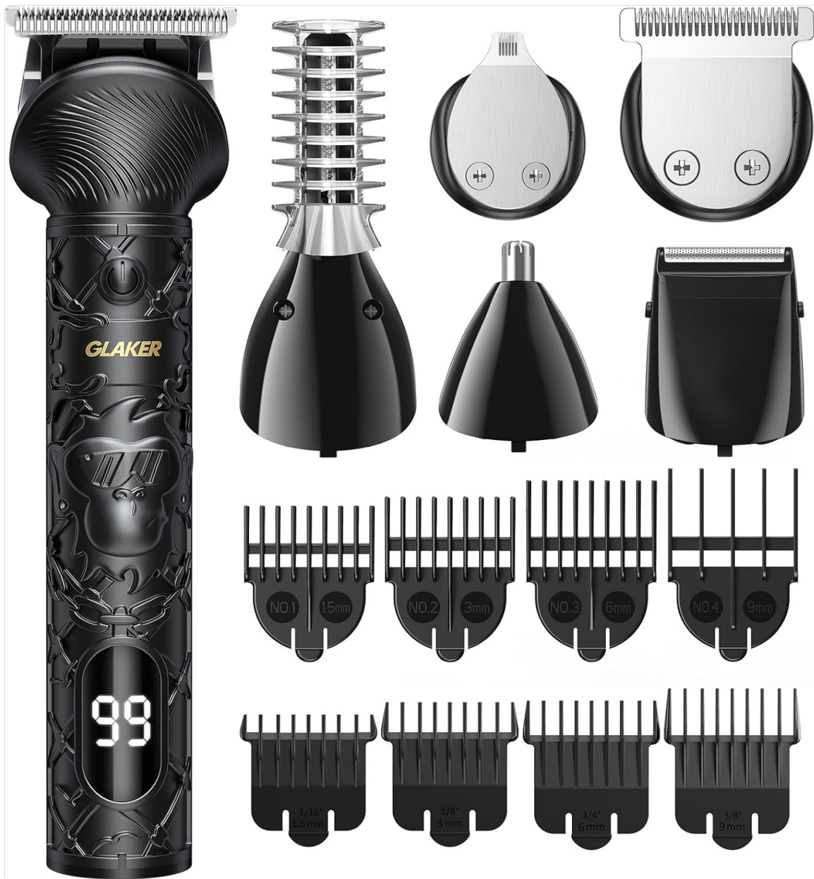
Figure 1: All components included in the GLAKER JM-700UU-6 6-in-1 Grooming Kit. This image displays the main trimmer unit, various interchangeable heads (beard, hair, precision, body, foil shaver, nose/ear), multiple guide combs, and accessories like the charging cable, oil, and cleaning brush.