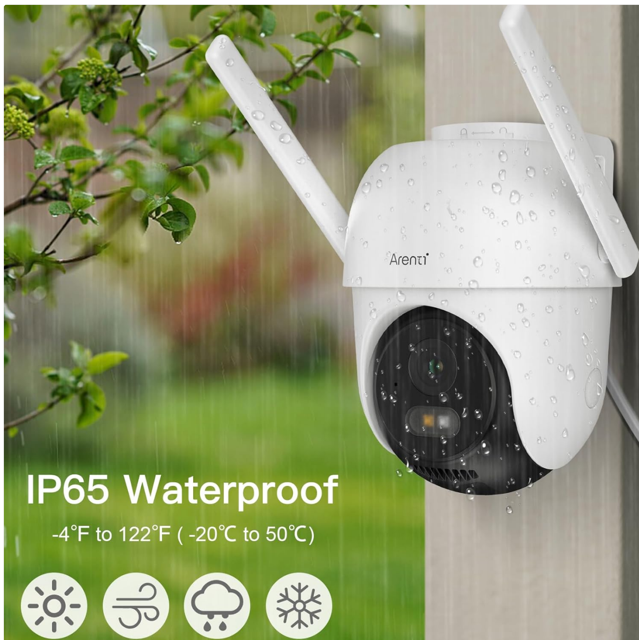
Image: The ARENTI OP1 camera shown in a rainy environment, emphasizing its IP65 waterproof and weather-resistant design.