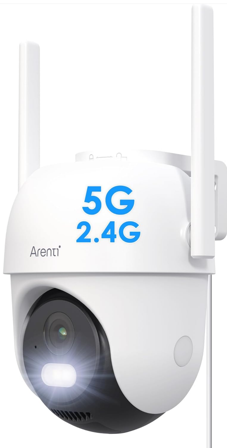
Image: The ARENTI OP1 camera alongside a smartphone screen, highlighting its 4MP resolution for clear image capture.