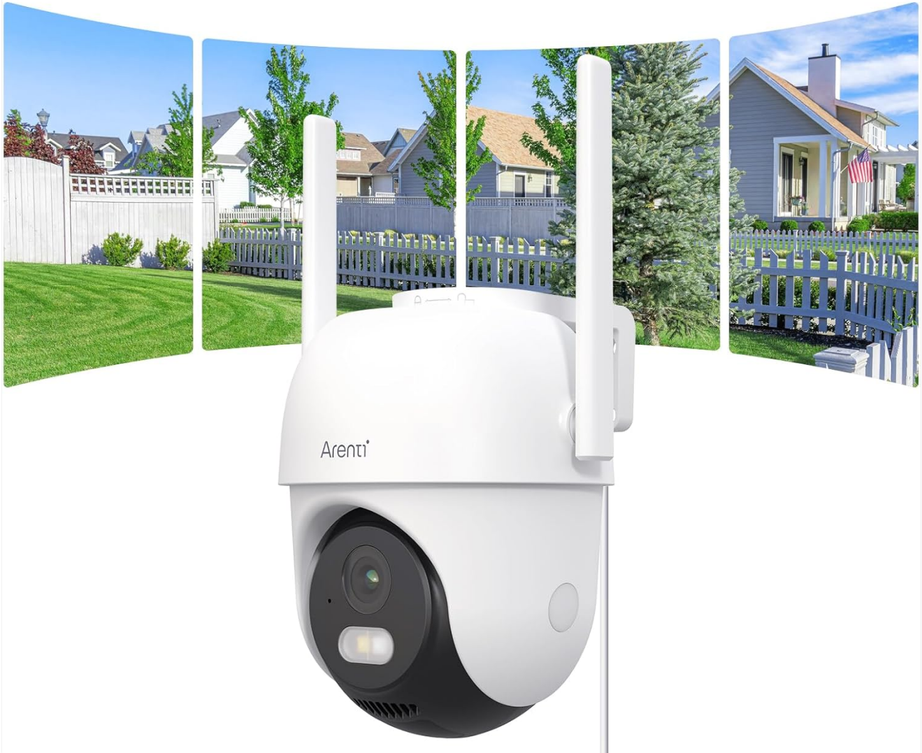
Image: The ARENTI OP1 camera demonstrating its 360-degree pan and tilt capabilities, showing a wide surveillance area.