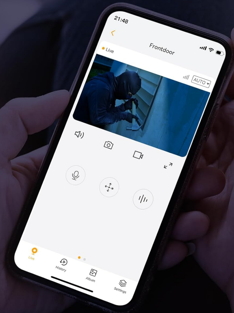
Image: A smartphone screen displaying the ARENTI OP1 app interface, illustrating the audible alert, visual deterrent, and instant notification features of the triple alarm system.