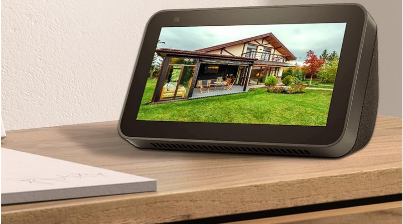
Image: A smart display showing live camera feed, indicating compatibility with Amazon Alexa and Google Assistant for voice commands.