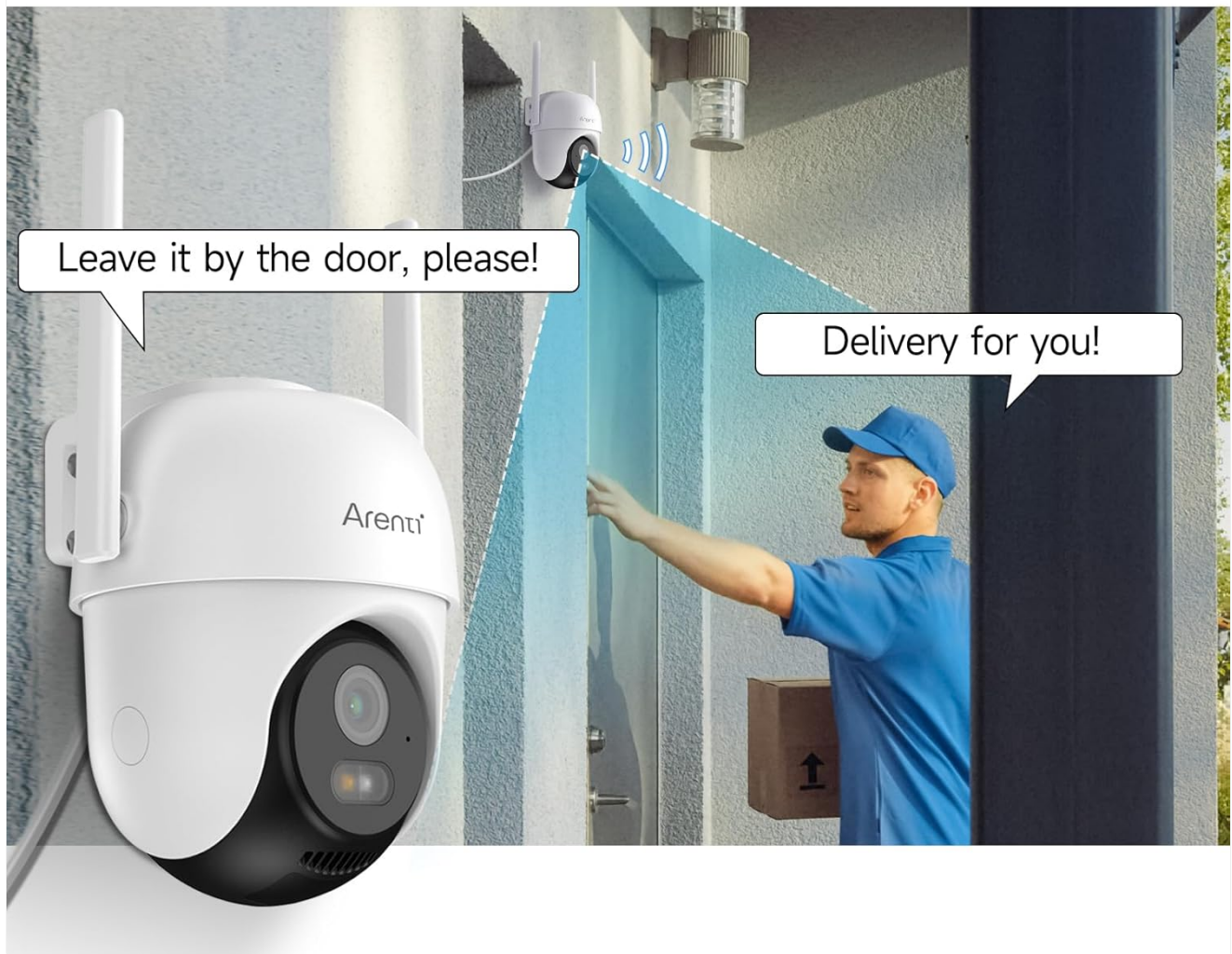
Image: A visual representation of the camera's two-way audio function, showing a user speaking to a delivery person through the device.