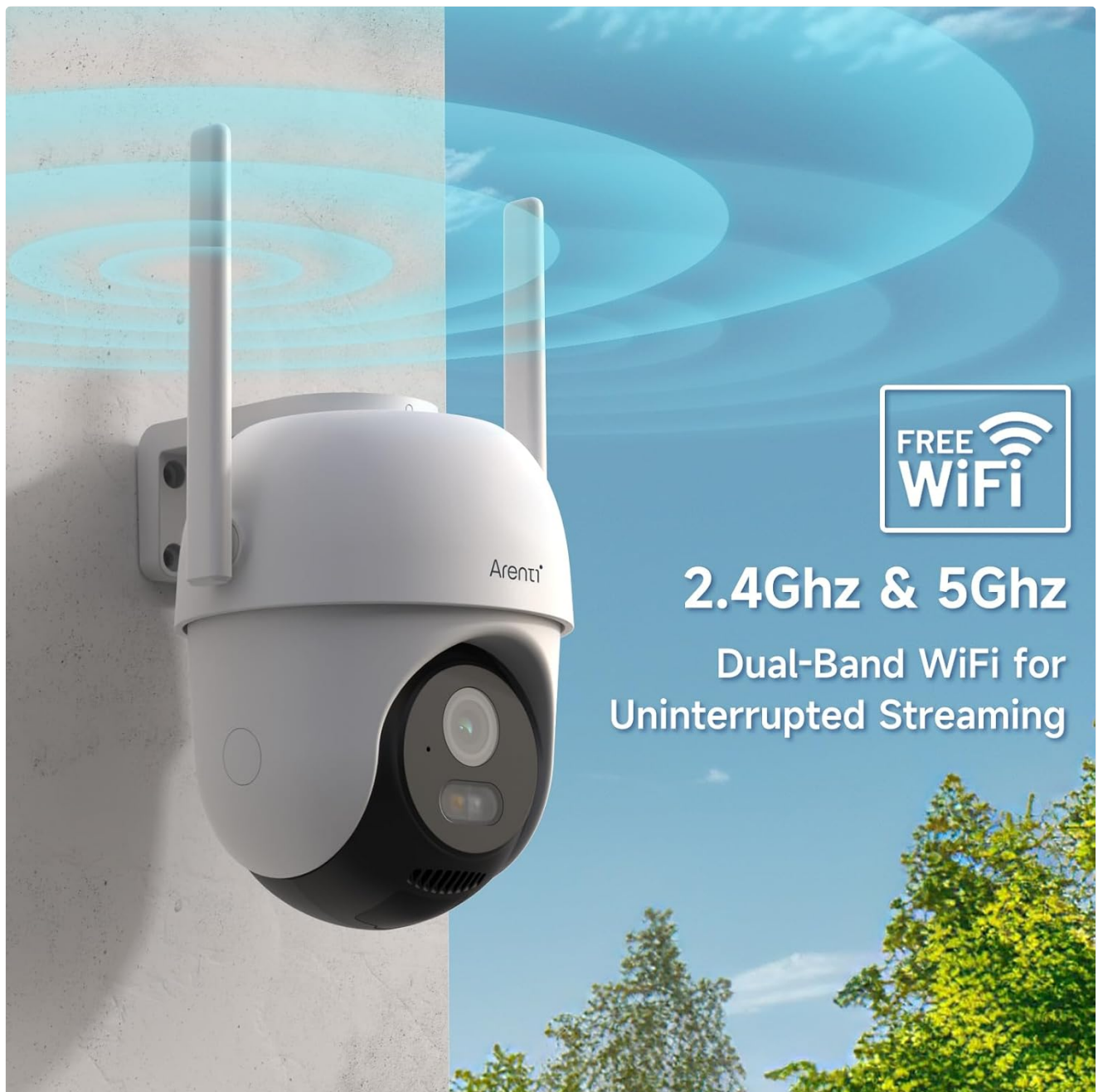
Image: The ARENTI OP1 camera with an overlay indicating its support for both 2.4GHz and 5GHz dual-band Wi-Fi for stable streaming.