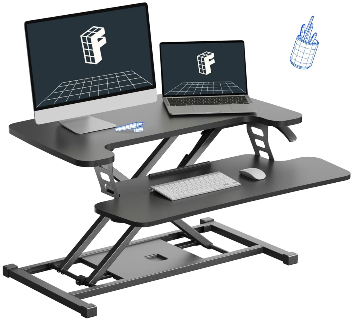
FLEXISPOT 28-inch Standing Desk Converter in black, featuring a two-tier design for monitor/laptop and keyboard/mouse placement.