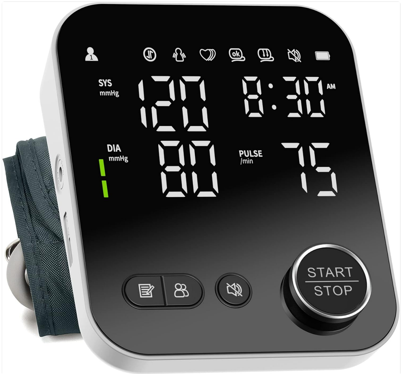
The NOUYAN BA31 Blood Pressure Monitor, showcasing its large LED display and intuitive button layout.