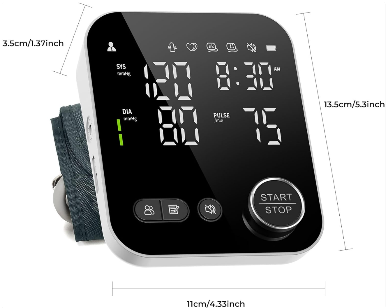
Detailed dimensions of the NOUYAN BA31 monitor.