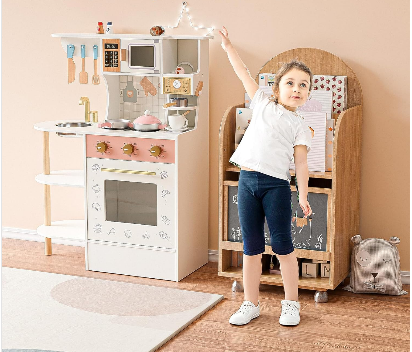
Image 5.4: A child enjoying pretend play with the kitchen set, illustrating its interactive nature.