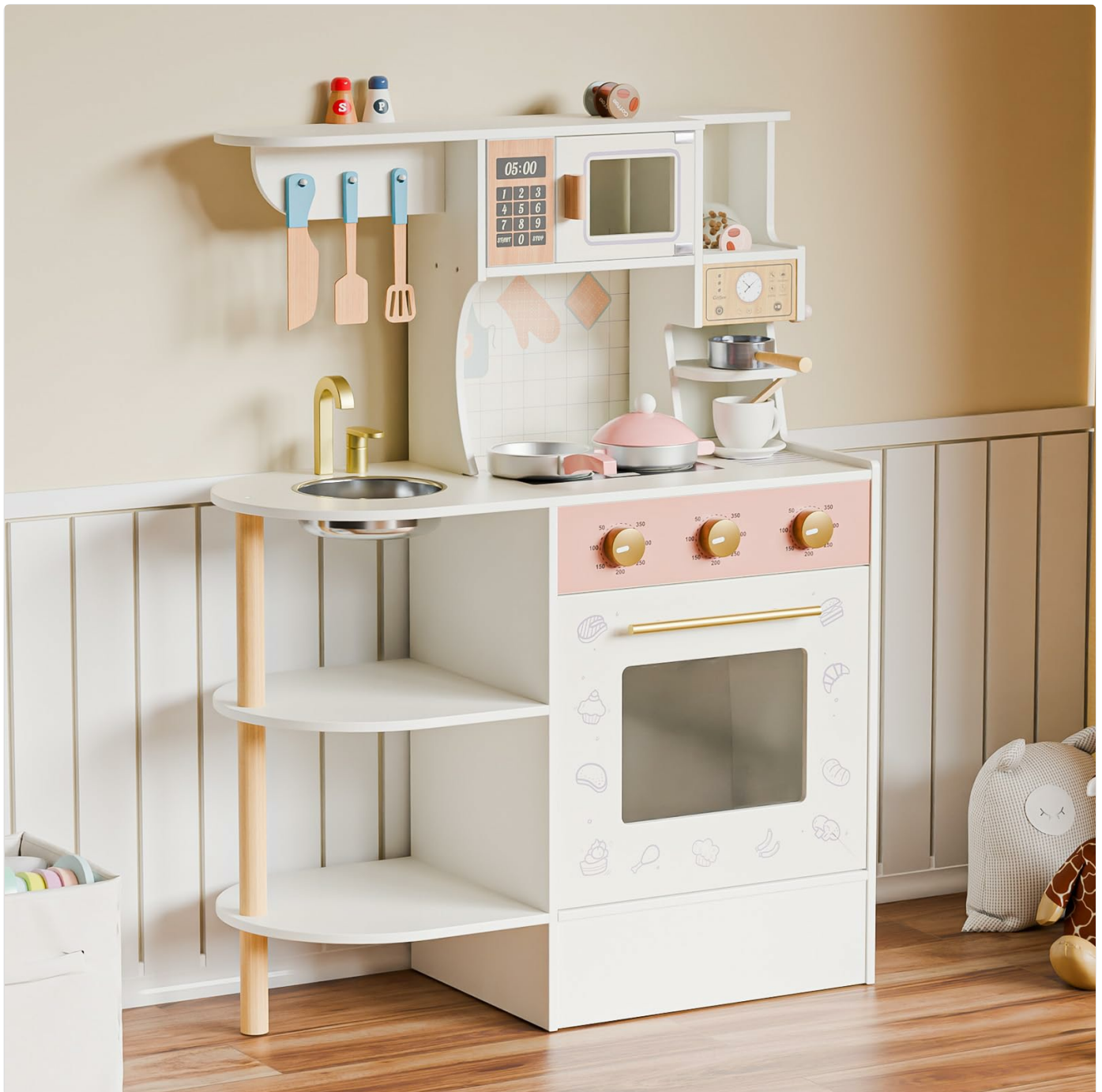
Image 1.1: The JOYMOR Kids Play Kitchen Set, featuring a cream and gold design.