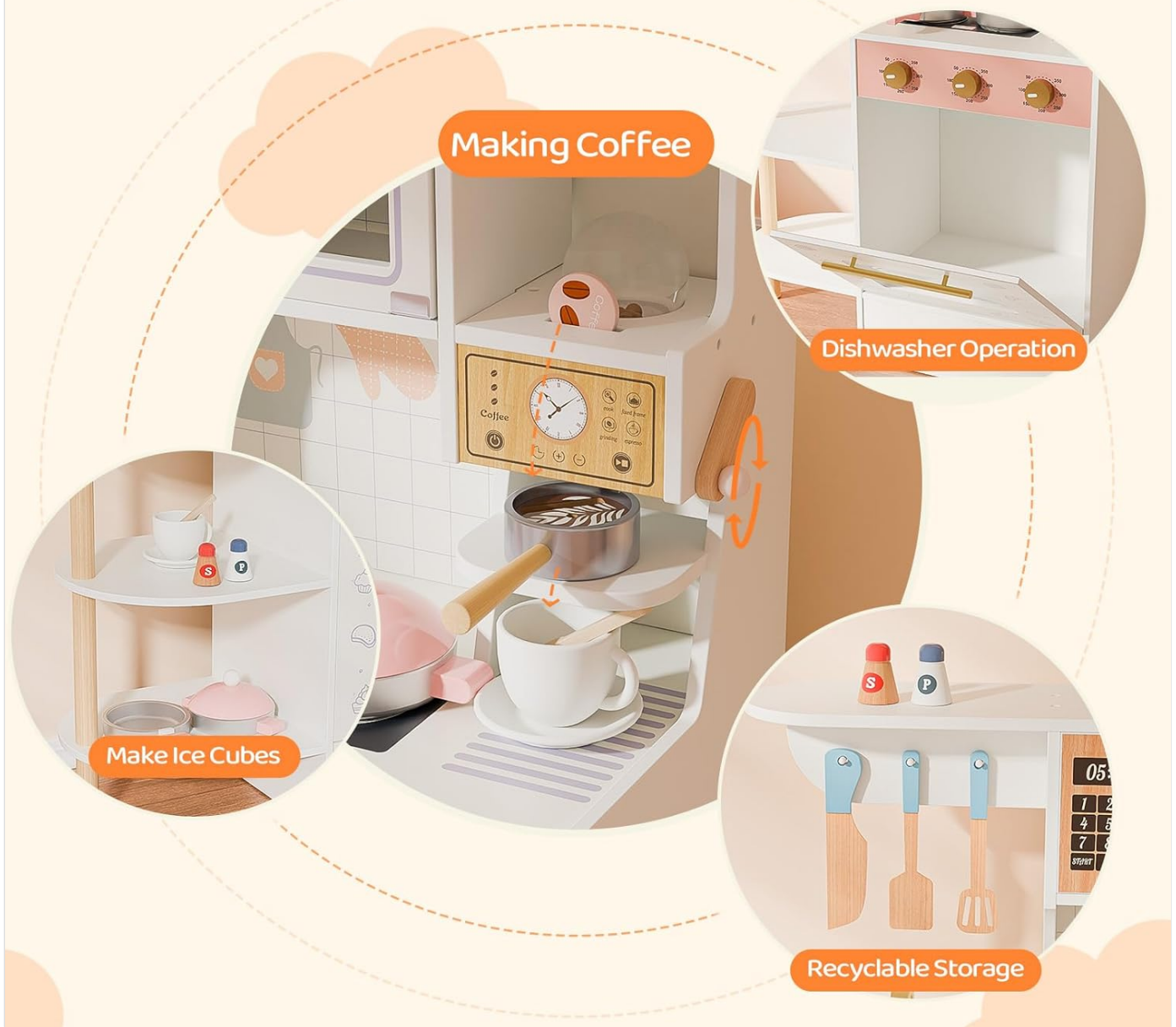
Image 5.2: Close-up of interactive elements such as the coffee machine and recyclable storage area.