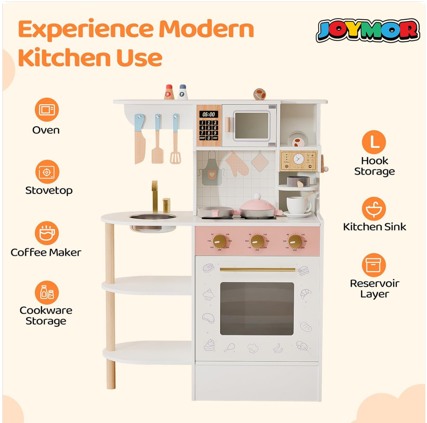
Image 5.1: Detailed view of the play kitchen's features, including the oven, stovetop, coffee maker, sink, and various storage options.