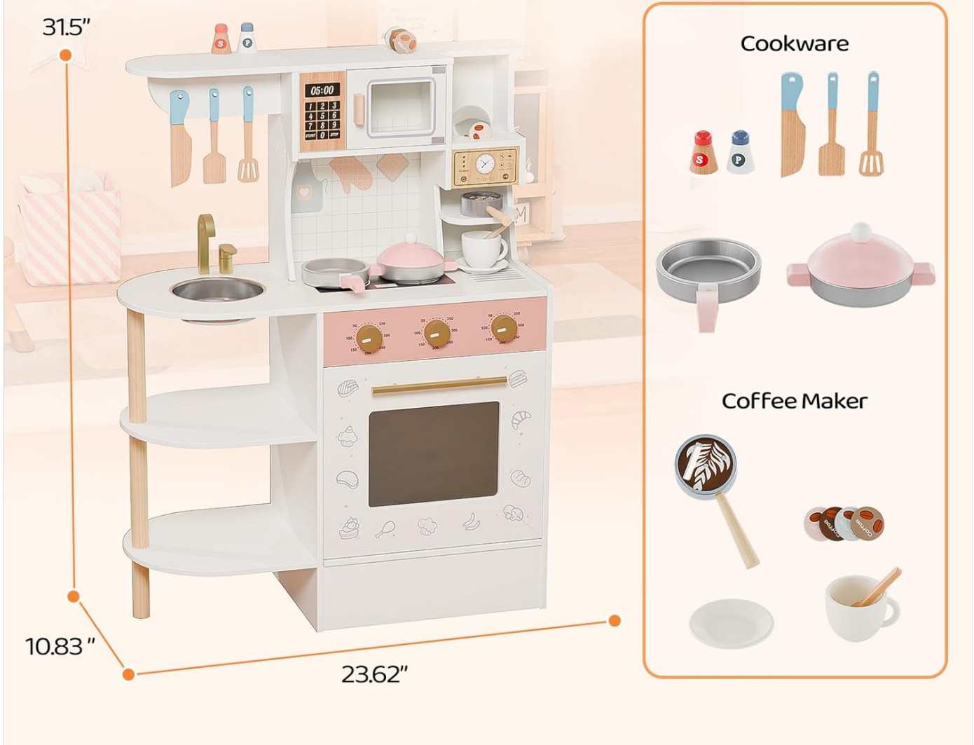
Image 8.1: Visual representation of the play kitchen's dimensions.