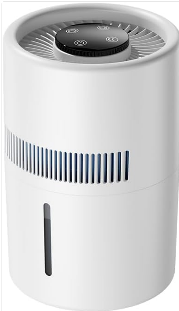
Image: Front view of the EJ-JSQ101 humidifier, showcasing its compact design and control panel on top.

This evaporative humidifier is designed to provide comfortable humidity levels in your bedroom or other living spaces. It features a 4-liter top-fill water tank, a mistless operation, and a replaceable filter for clean, pure humidification. The unit also includes an adjustable night light and operates quietly, making it ideal for use during sleep.