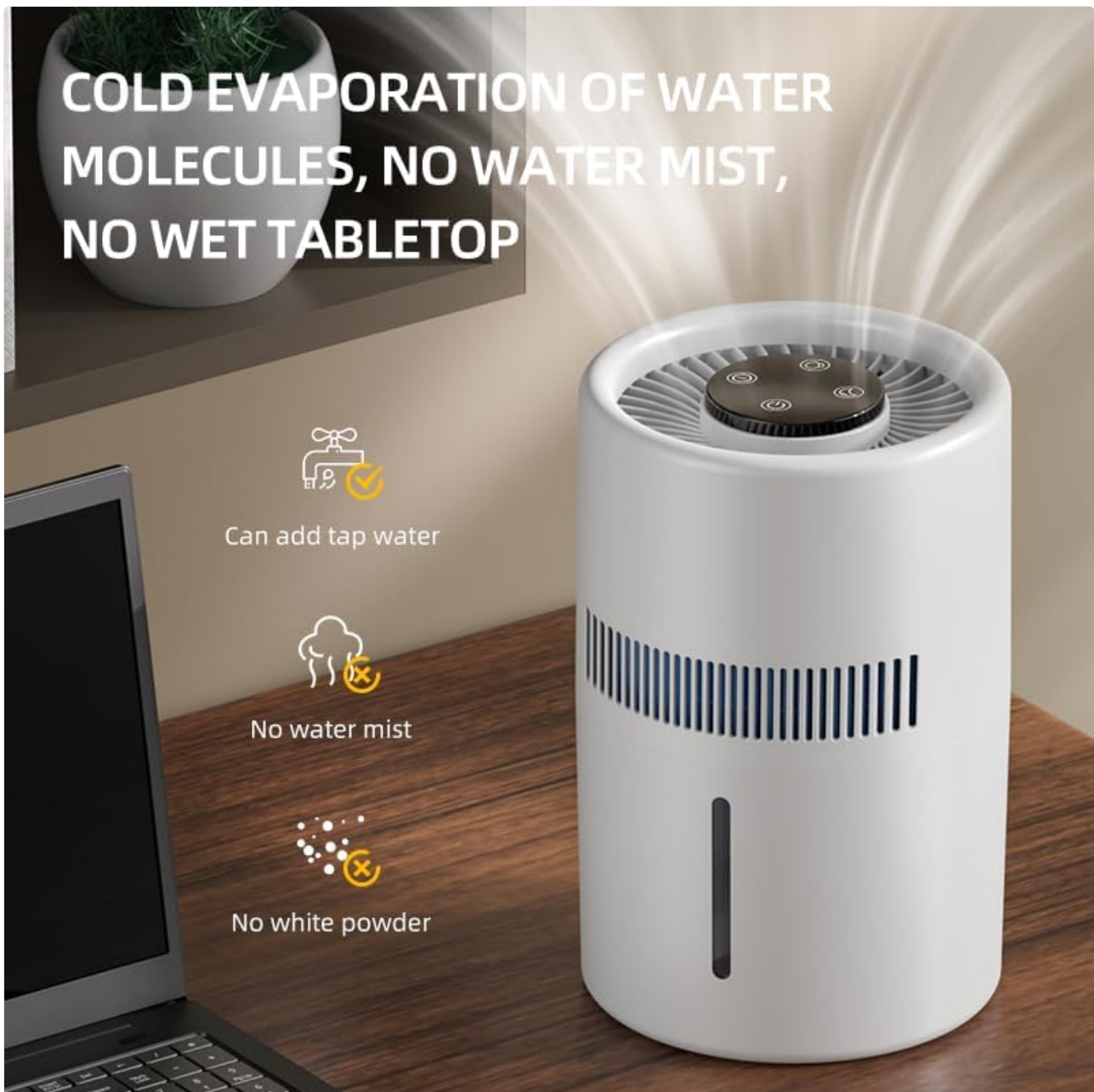
Image: The humidifier in operation, illustrating the cold evaporation process that produces no visible mist or wet residue on surfaces.