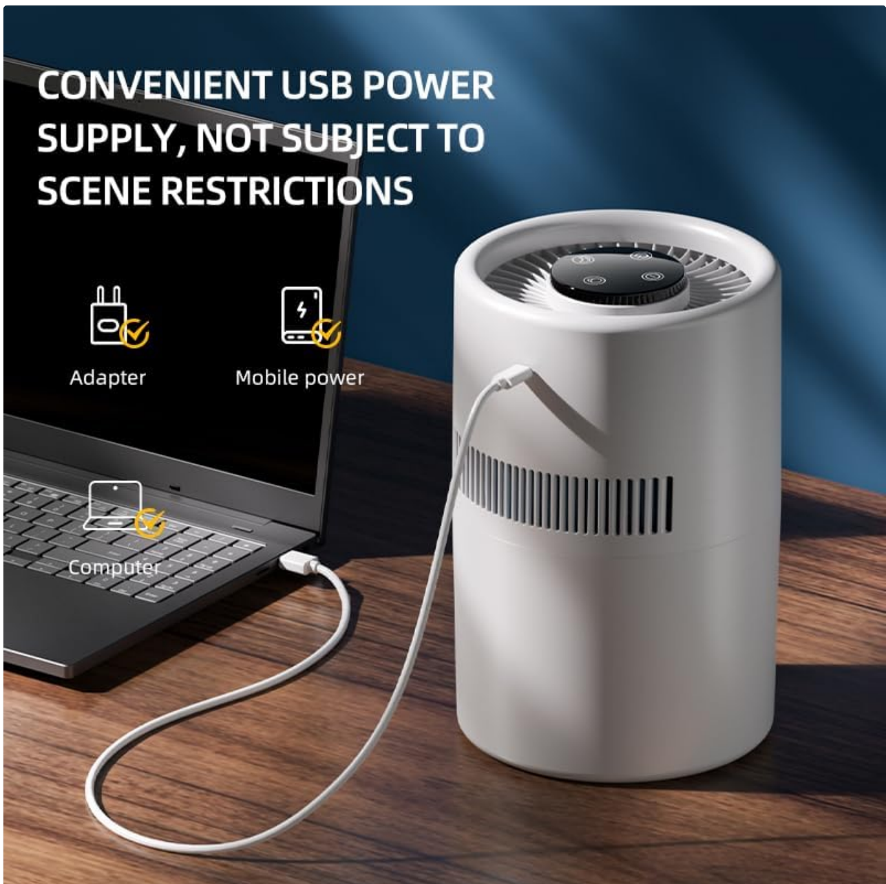
Image: The humidifier connected to a laptop via a USB cable, demonstrating its versatile power supply options.