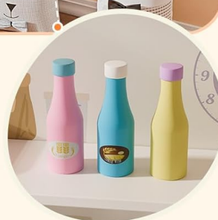
Rigorous Safety Testing