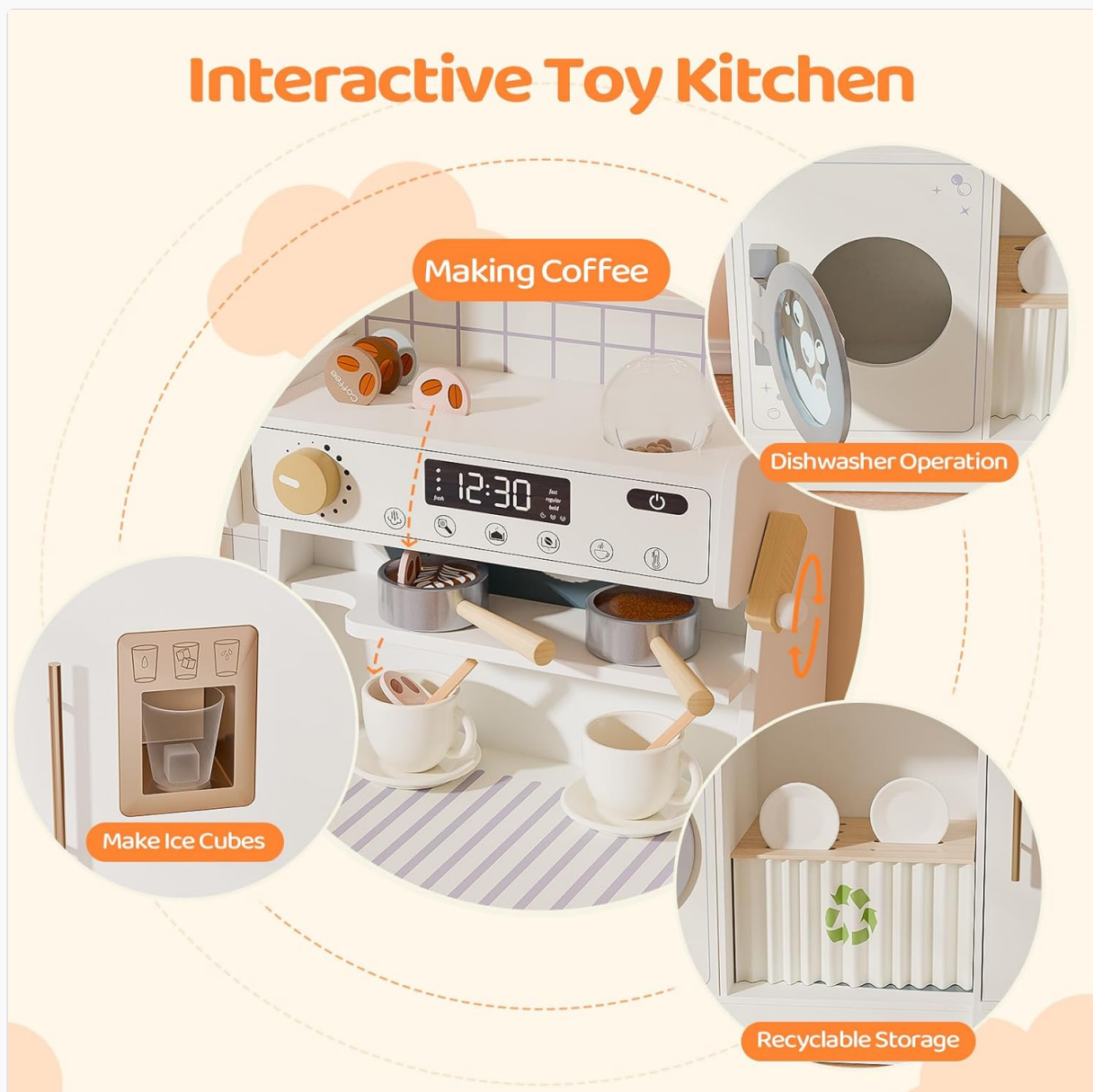
Image 5.5: Interactive elements like the washing machine, ice maker, and storage.