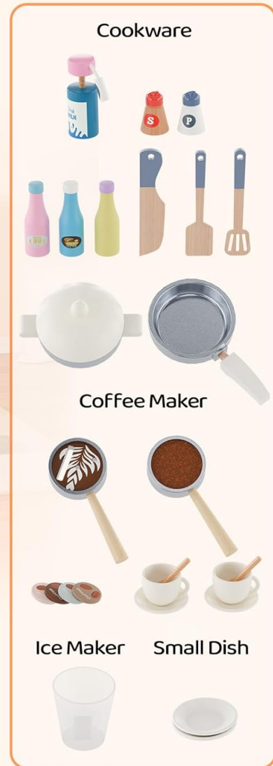
Image 3.1: The play kitchen includes various accessories and has dimensions of approximately 35.55" (width) x 11.61" (depth) x 41.18" (height).