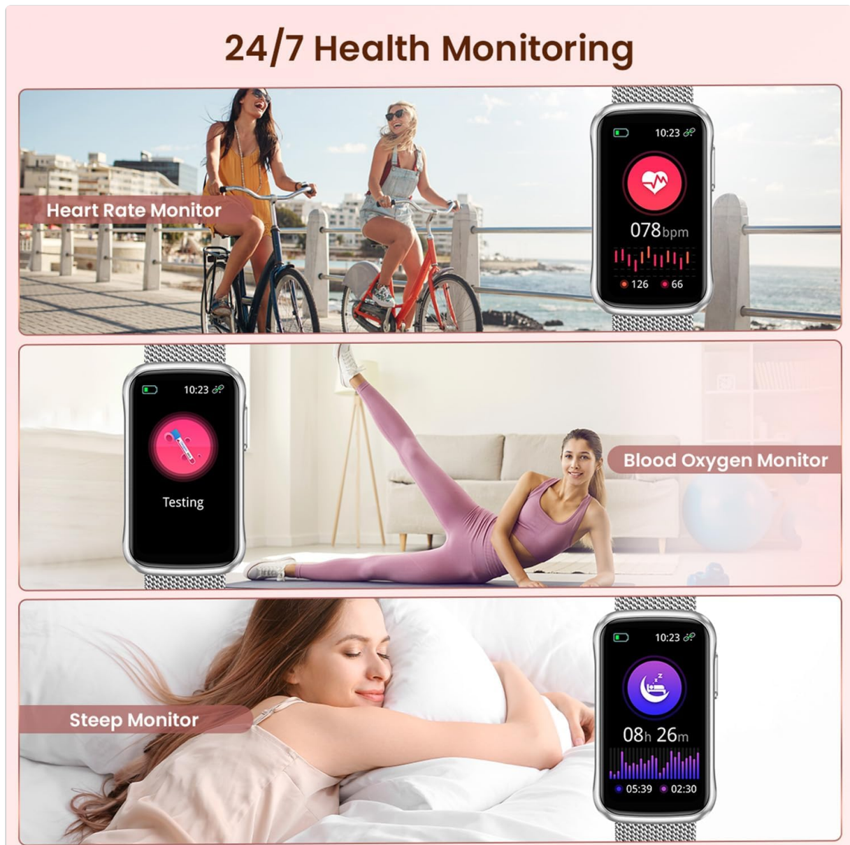
Image: Three panels illustrating the 24/7 health monitoring features of the smartwatch: real-time heart rate tracking, blood oxygen level measurement, and detailed sleep pattern analysis.

Note: This device is designed to encourage a healthy lifestyle and is not intended for medical purposes. Consult a healthcare professional for medical advice.