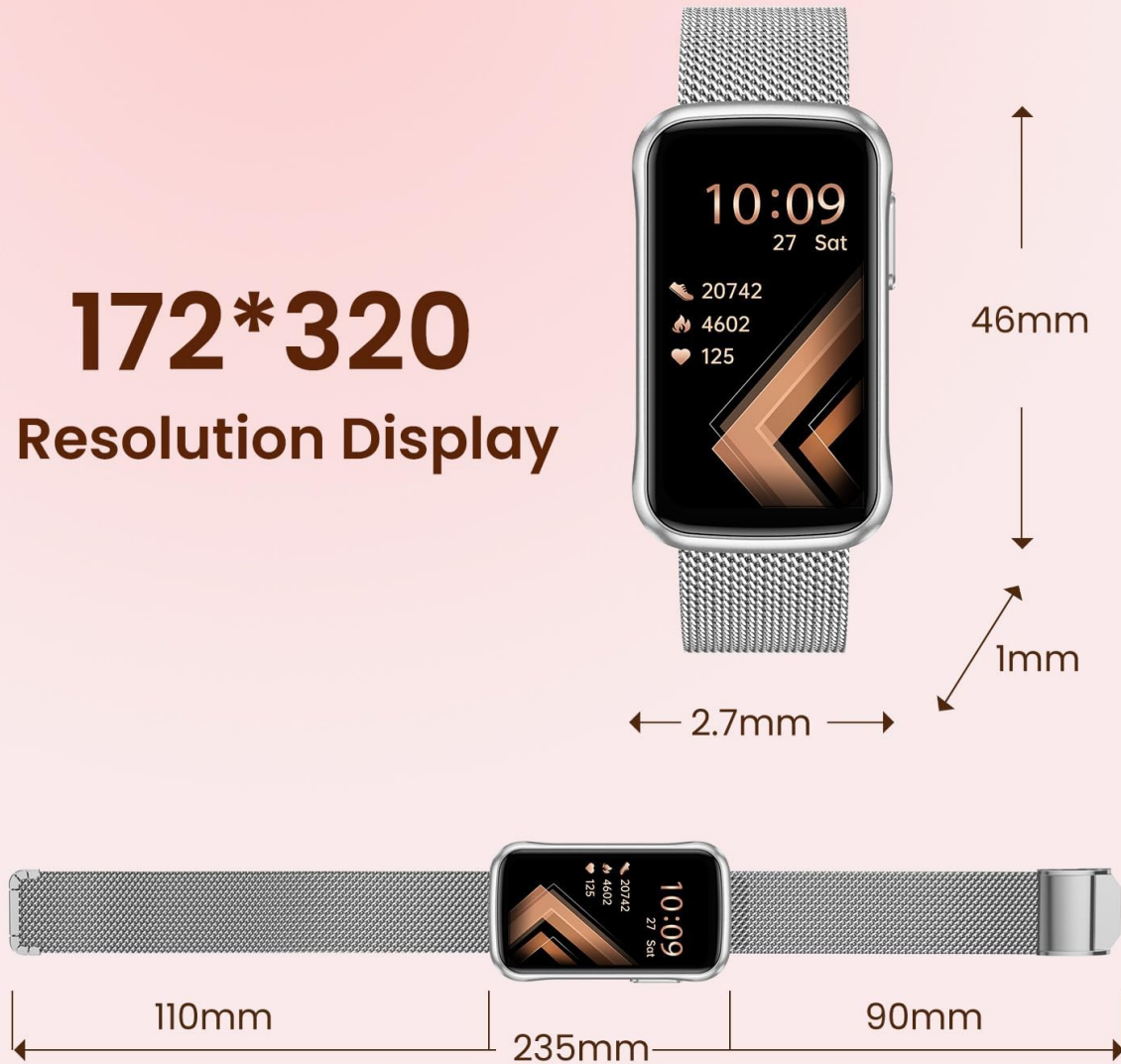
Image: A diagram illustrating the physical dimensions of the smartwatch and its 172x320 resolution display, along with strap measurements.