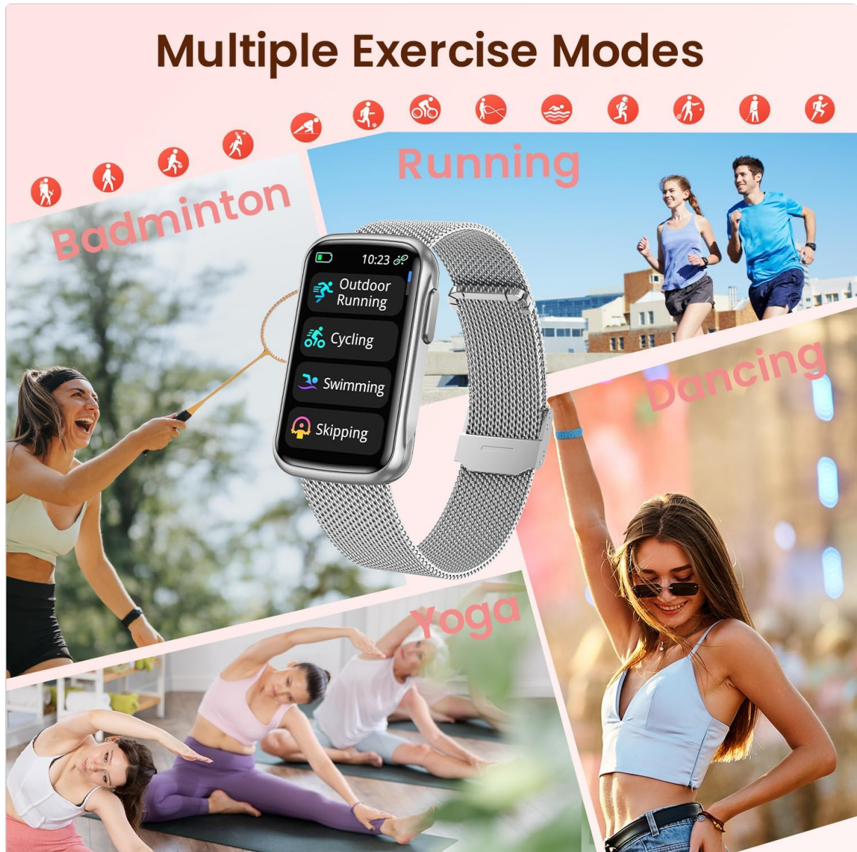
Image: The smartwatch screen showing a menu of multiple exercise modes, including Outdoor Running, Cycling, Swimming, and Skipping, with background images of people engaging in various sports like badminton, running, dancing, and yoga.