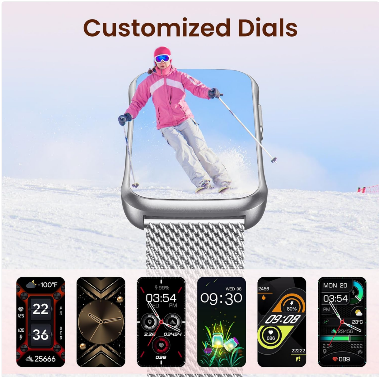
Image: The smartwatch showcasing a variety of customized watch faces, including one with a skiing background and several digital and analog style options below.