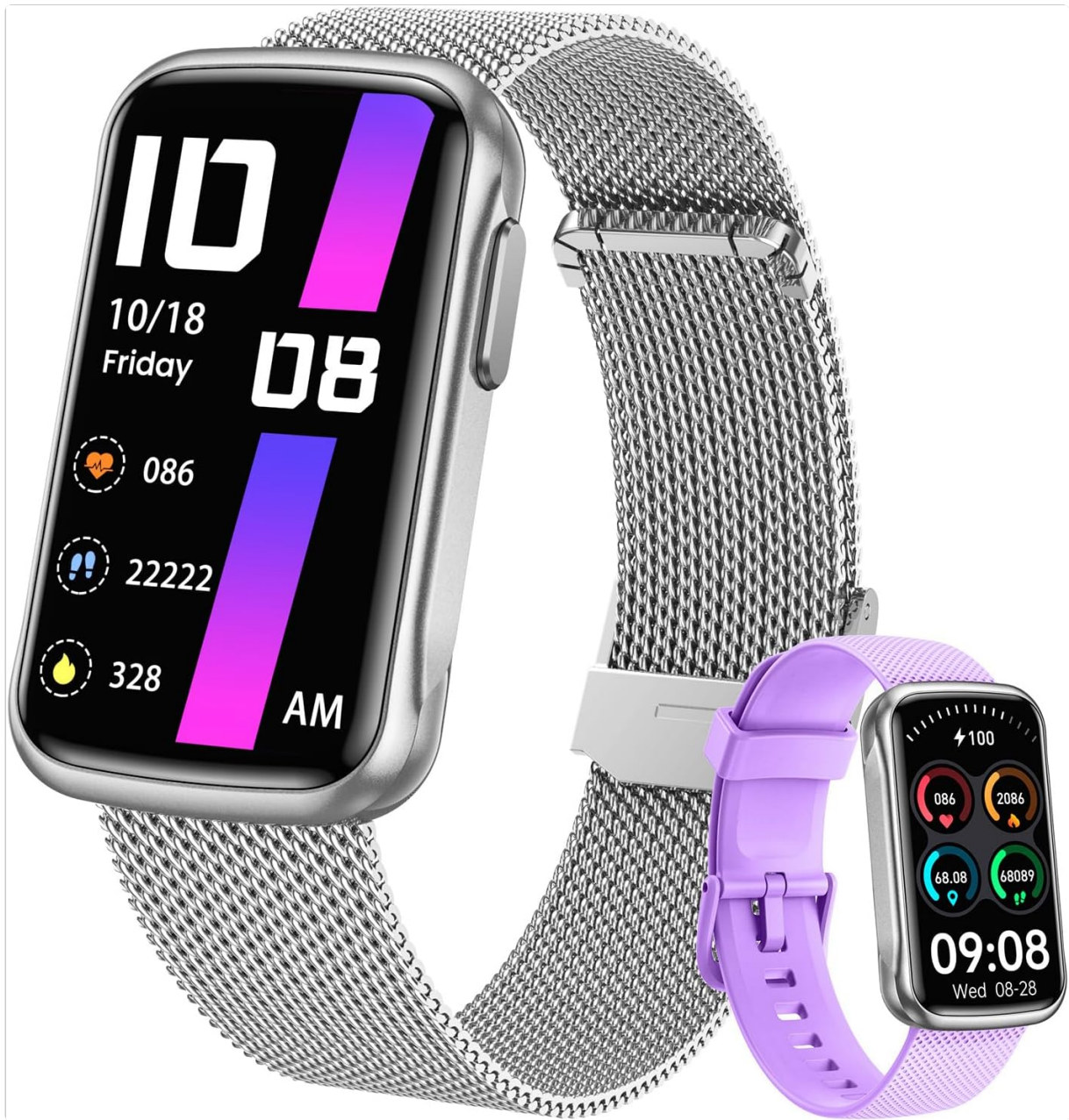
Image: The AmoGod Fitness Tracker Smartwatch, featuring a silver rectangular watch face with a digital display showing time, date, heart rate, and steps. It is shown with an attached silver mesh band and an additional purple silicone band.