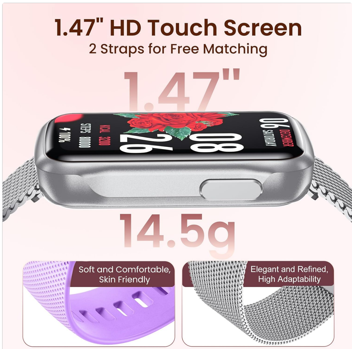
Image: A close-up view of the smartwatch highlighting its 1.47-inch HD touch screen and lightweight design (14.5g),

The smartwatch features a 1.47-inch HD touch screen. Swipe across the screen to navigate through different functions and tap to select options.