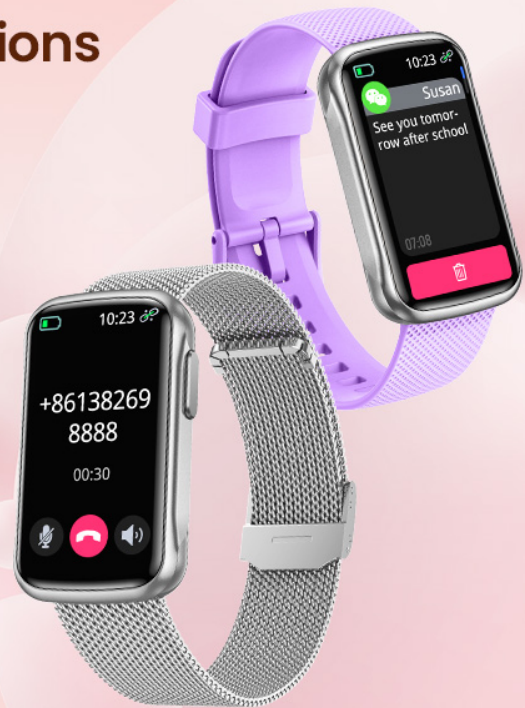
Image: The smartwatch displaying an incoming call notification and a message notification from a smartphone, illustrating its ability to receive alerts in real-time and reject calls.