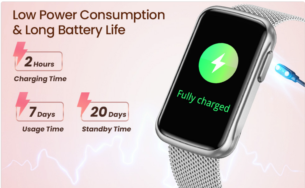
Image: A visual representation of the smartwatch charging process, indicating a "Fully charged" status and illustrating charging time (2 hours), usage time (7 days), and standby time (20 days).

Before initial use, fully charge the smartwatch. Connect the charging cable to the charging port on the back of the watch and plug the USB end into a standard USB power adapter (not included) or a computer's USB port. A full charge typically takes approximately 2 hours.