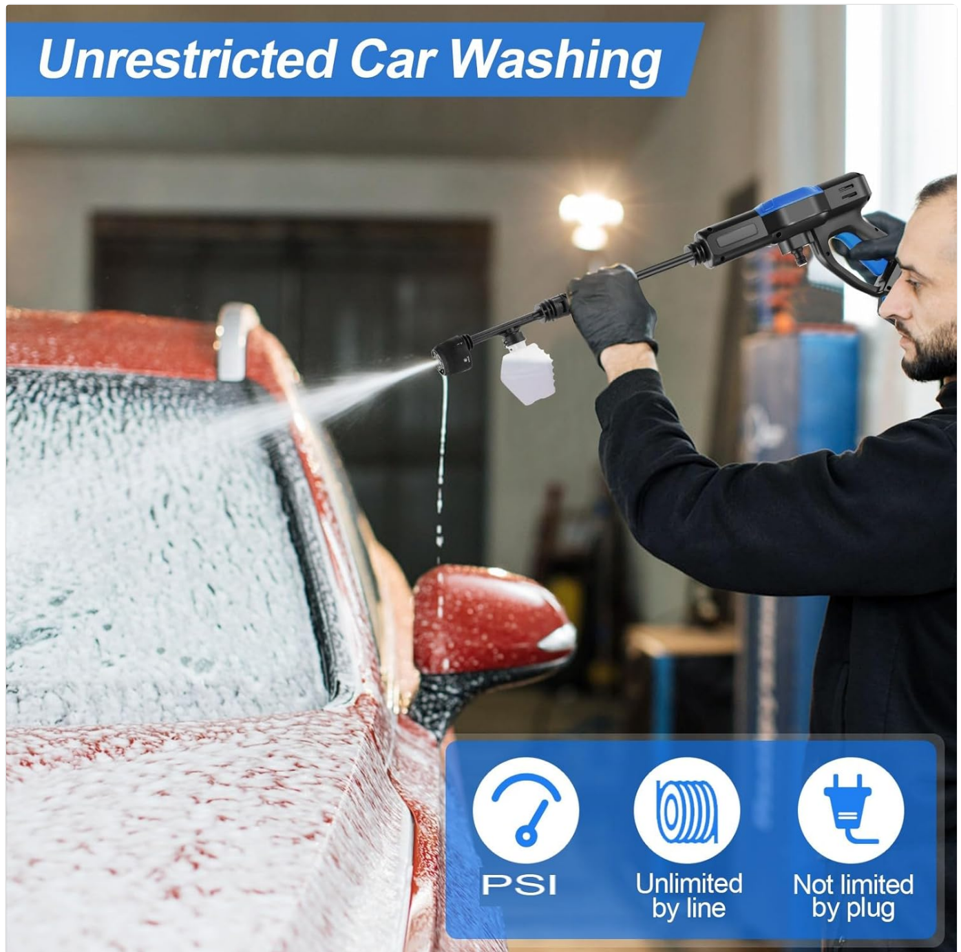
Image: A user demonstrating car washing with the pressure washer, utilizing the foam mode for effective cleaning.

the 'Foam Mode' on the 6-in-1 nozzle. The unit will mix the detergent with water to create a rich foam for effective cleaning.