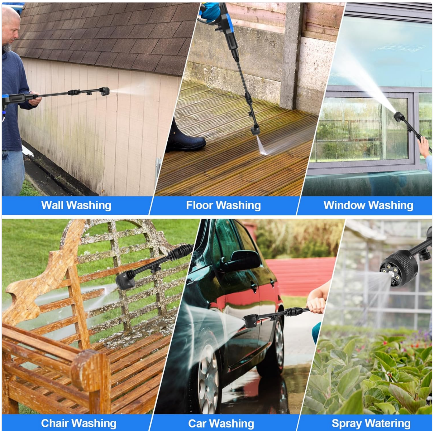
Image: A collage showcasing diverse applications of the pressure washer, including wall washing, floor washing, window washing, chair washing, car washing, and spray watering.