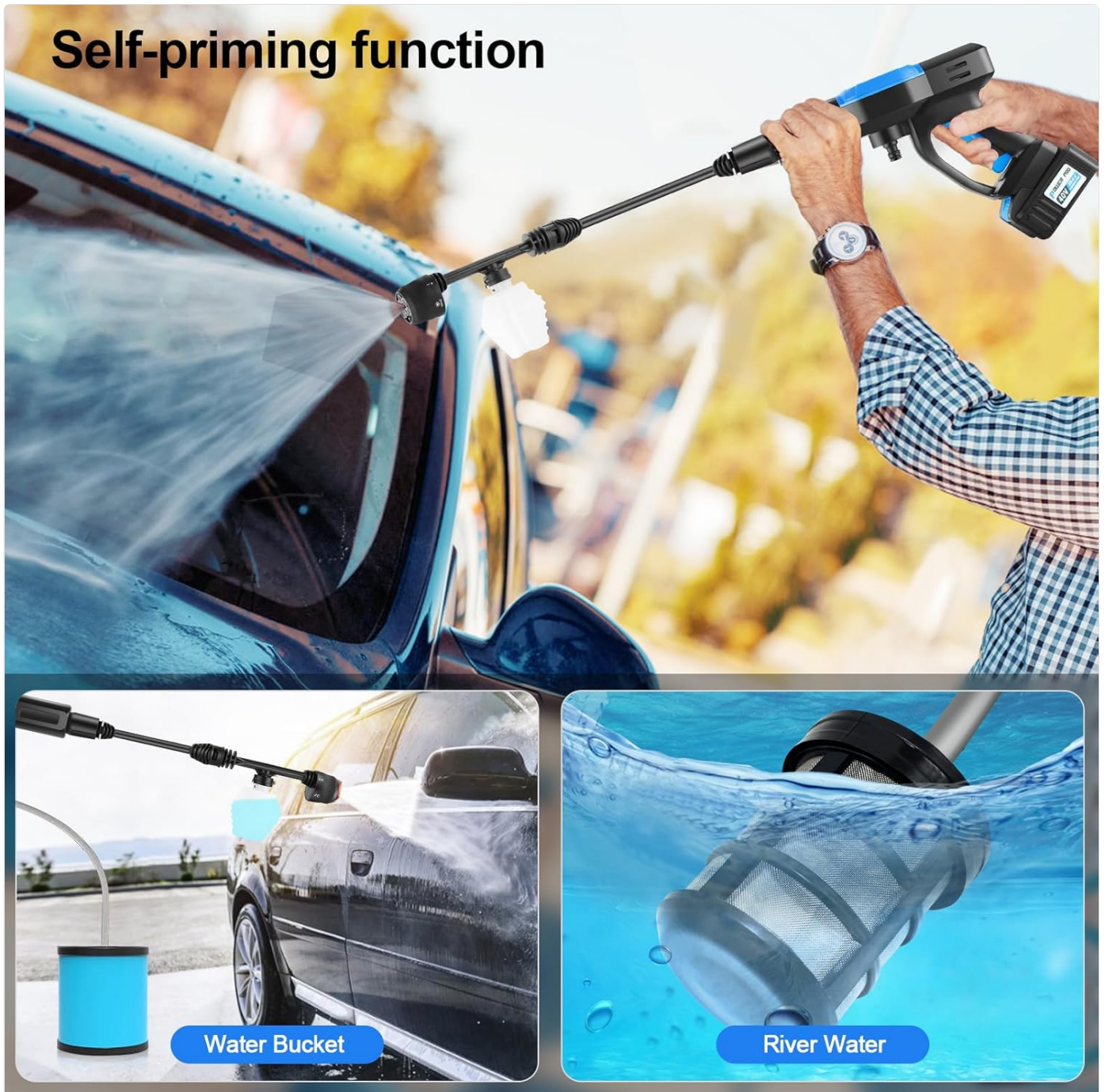
Image: The self-priming feature in action, drawing water from a bucket and a river for car washing.