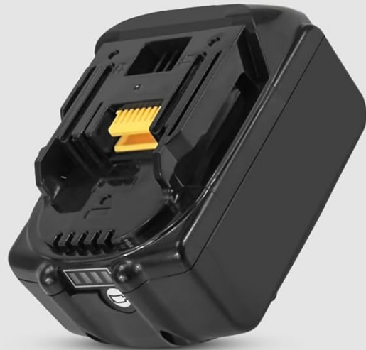
Image: Comparison highlighting the features of the 40V powerful battery, including voltage, charging time, and charging current.