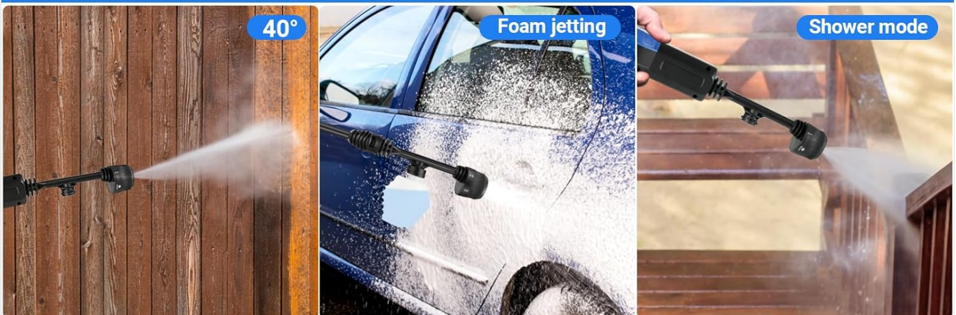
Image: The 6-in-1 nozzle demonstrating its various spray patterns, including 0°, 20° (slant direction), 40°, foam jetting, and shower mode.