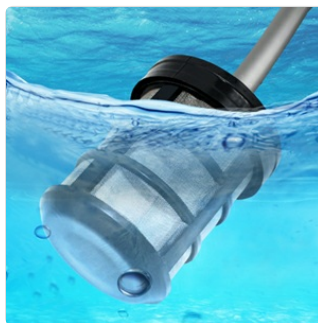
Image: A close-up view of the water suction filter, designed to prevent impurities from entering the machine.