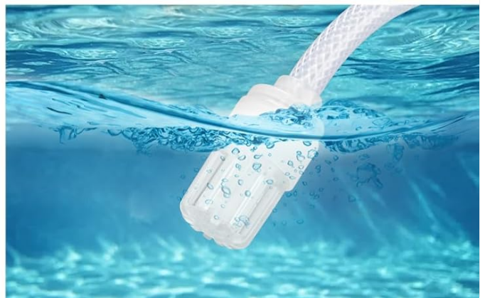
Image: Illustration of connecting the pressure washer to a faucet and drawing water from a bucket or natural water body.