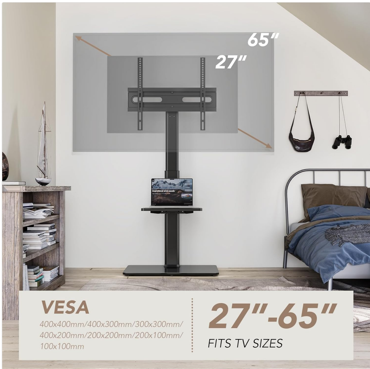
Image: Visual guide for VESA compatibility and supported TV sizes (27-65 inches).