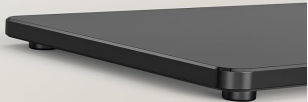
Image: Details of the TV lock mechanism, cable management, and tempered glass base.

Made of 8mm glass, it is stable & ensures safety.