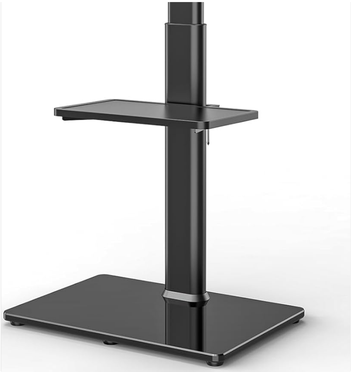
Image: Fully assembled TV stand with a television, demonstrating its overall appearance and stability.