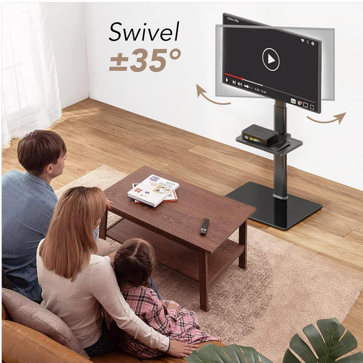
Image: Demonstration of the TV stand's swivel feature.