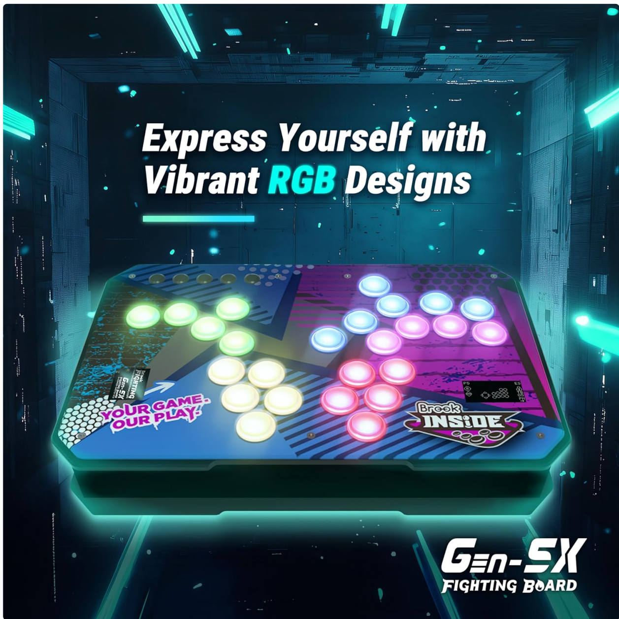
Image: A custom arcade stick featuring illuminated buttons with vibrant RGB lighting, demonstrating the customization options of the Gen5X board.