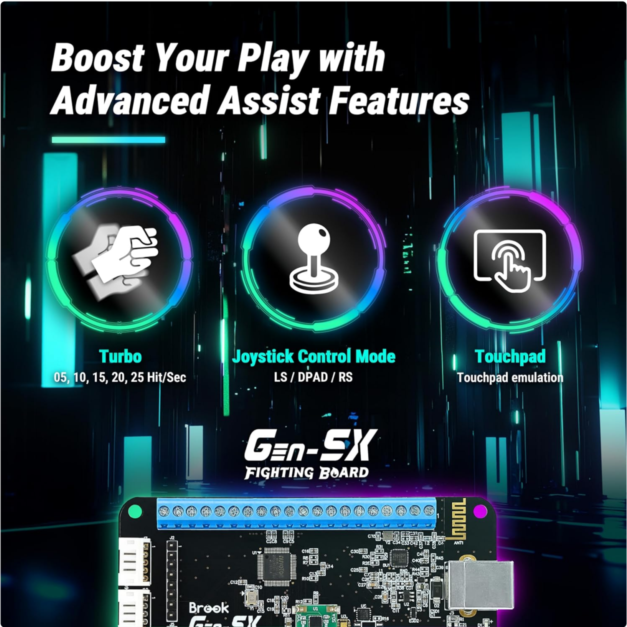
Image: Icons representing Turbo, Joystick Control Mode (LS/DPAD/RS), and Touchpad emulation, highlighting the advanced assist features of the Gen5X Fighting Board.