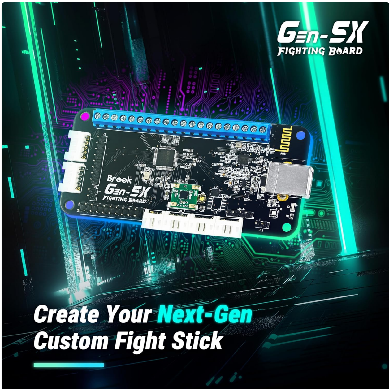
Image: The Gen5X Fighting Board shown on a circuit board background, illustrating its purpose in creating next-generation custom fight sticks.