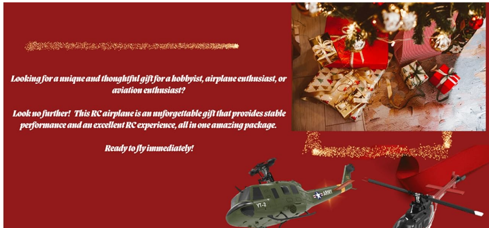
Figure 6.2: The helicopter's optical flow mode enables stable flight in various environments, and the one-touch inverted flight feature simplifies advanced maneuvers.

The helicopter utilizes high-precision optical flow positioning and a barometer for altitude hold, allowing for stable flight both indoors and outdoors, even in light wind conditions.