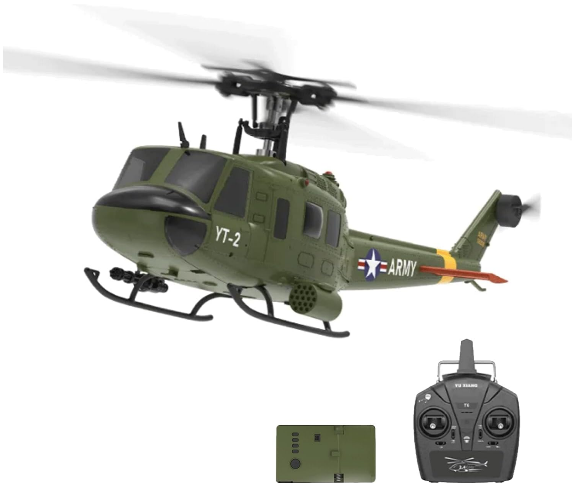
Figure 1.1: The YU Xiang F07 Bell UH-1 Huey RC Helicopter, remote control, and battery. This image displays the complete Ready-to-Fly package components.