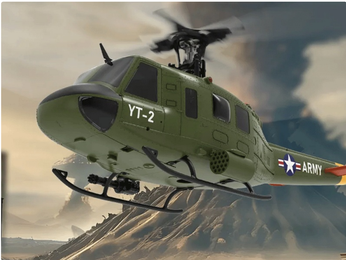
Figure 4.1: Visual representation of the helicopter's core features, including its 6-axis gyroscope, brushless motor, and optical flow localization.