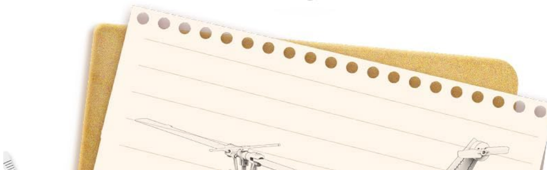
Figure 7.1: The helicopter's paddles are made from a durable nylon and carbon fiber composite, designed for high strength and impact resistance.

Adopting dual-axis co-drive motors Electronic stabilization system for more precise feel and more stable flight Optimized structure to reduce the chance of damage