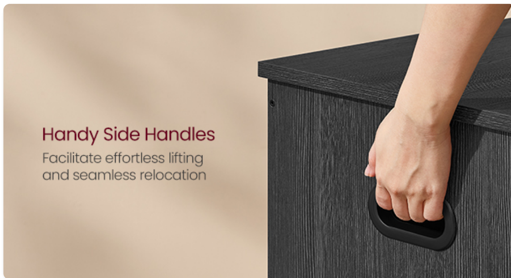
Image: A close-up of the ergonomically designed cut-out handle on the side of the storage chest, facilitating easy movement.