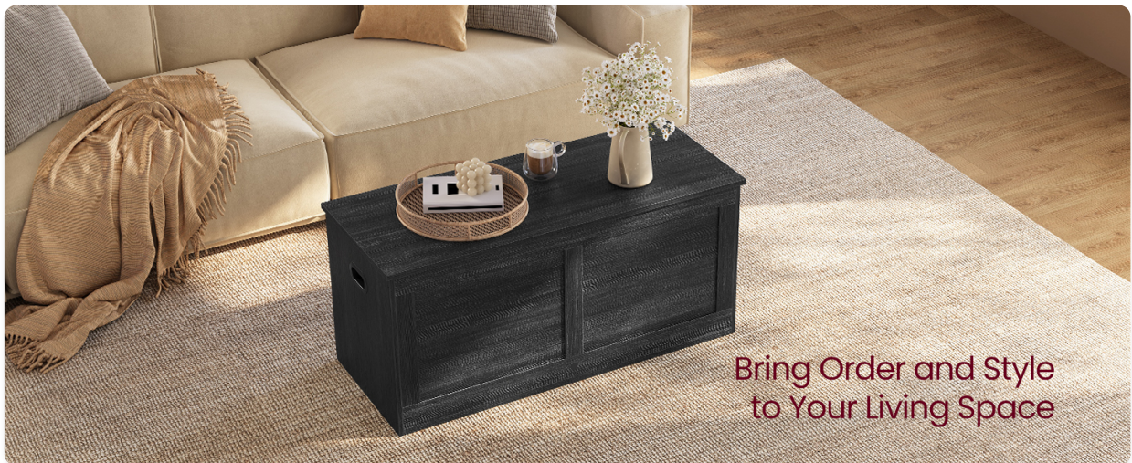
Image: The VASAGLE ULSB164B01 Storage Chest in a living room, showcasing its modern design and functionality as both storage and seating.

Thank you for choosing the VASAGLE ULSB164B01 Storage Chest. This versatile piece of furniture, designed in a modern charcoal gray style, offers ample storage and serves as a functional bench. Please read this manual carefully before assembly and use to ensure safe and correct operation.