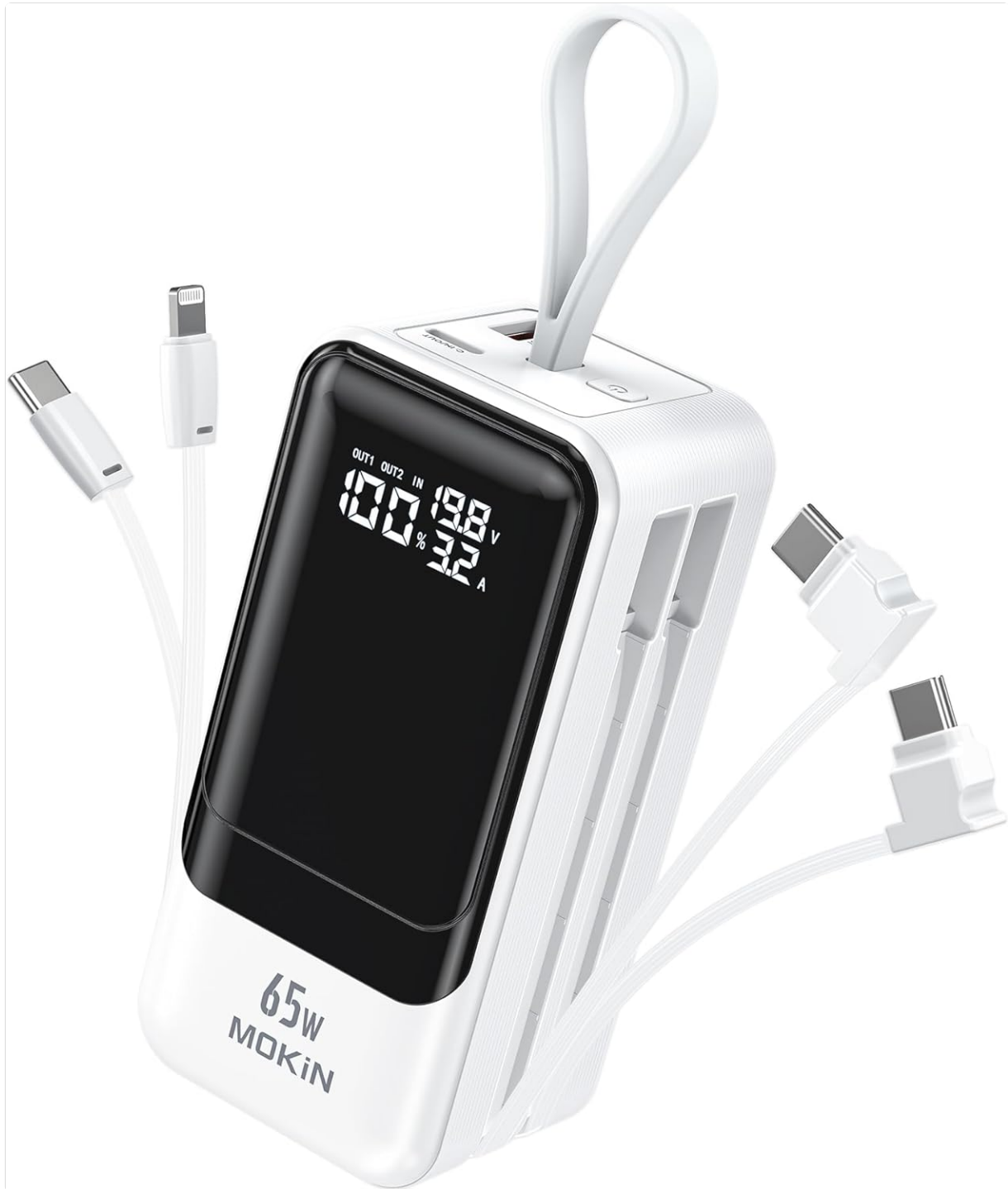
Figure 1: imokin 65W Portable Charger with built-in USB-C and iOS cables, and digital display.