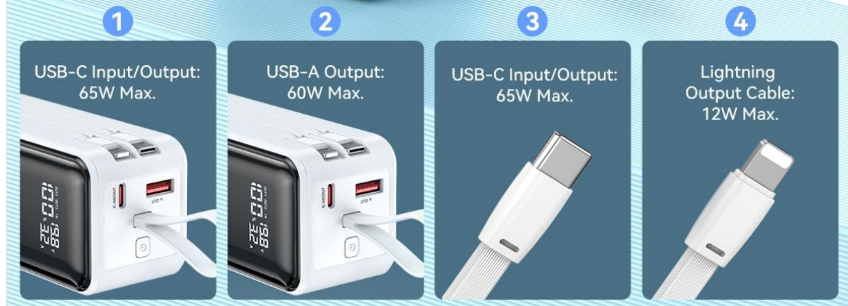
Figure 5: Diagram illustrating the two input and four output ports of the imokin 65W Portable Charger, detailing power specifications for each.