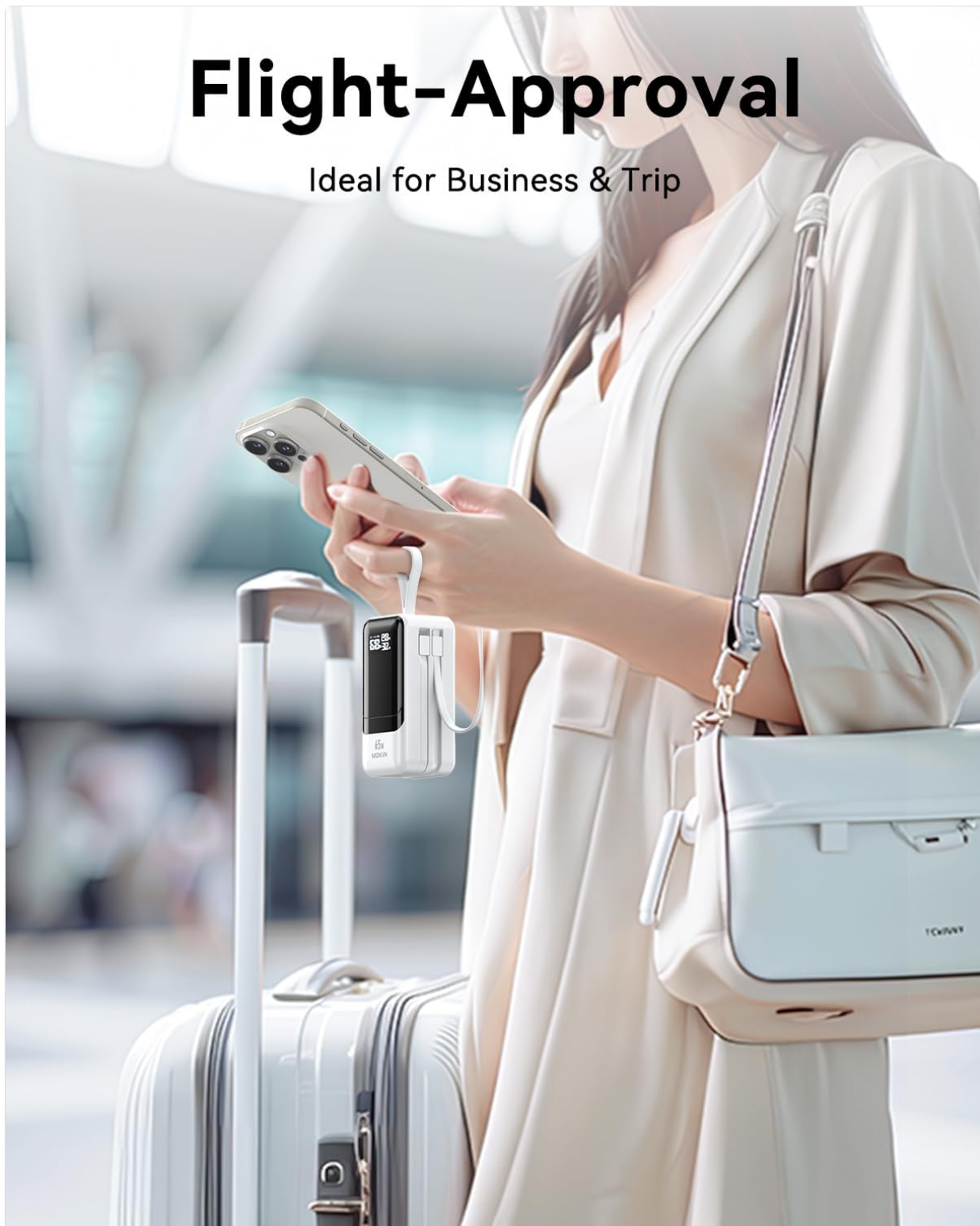
Figure 7: A person at an airport with luggage, using the imokin 65W Portable Charger, indicating its flight-approved status and suitability for travel.