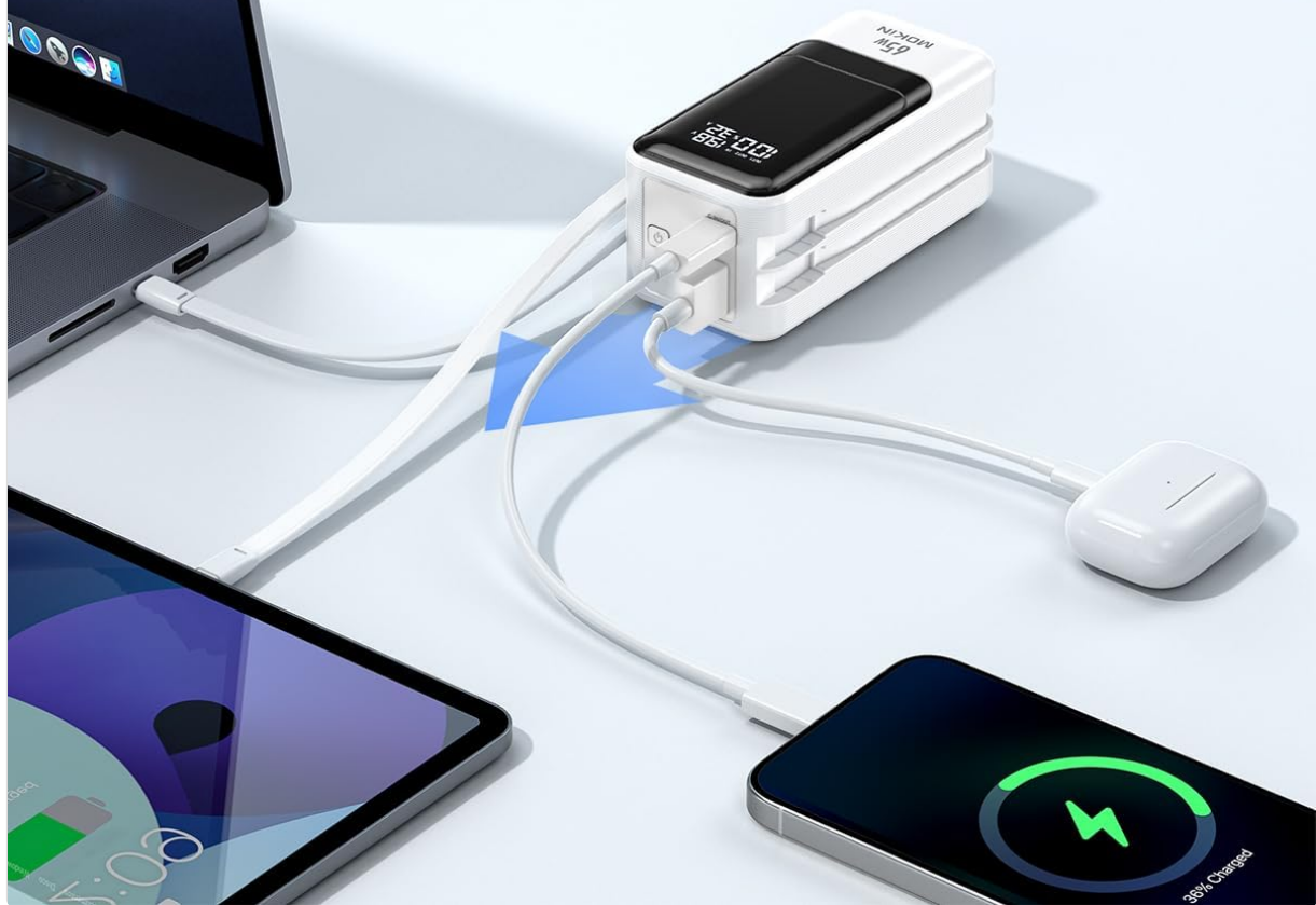
Figure 2: The imokin 65W Portable Charger simultaneously charging a MacBook, iPad, iPhone, and AirPods, demonstrating its 4-in-1 fast charging feature.