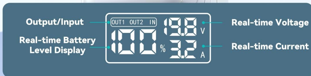
Figure 4: Close-up of the imokin 65W Portable Charger's LED digital display, showing real-time battery level, voltage, and current.