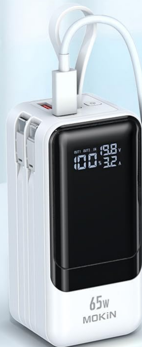
Figure 3: imokin 65W Portable Charger connected to a MacBook Pro 16", illustrating fast charging capabilities.