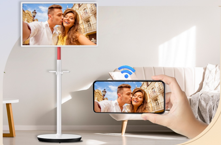
Figure 12: The display offers stunning Ultra HD 4K resolution with a wide color gamut for vivid images.

Support WIFI 6 and Bluetooth 5.2, you can wirelessly connect to content from your smartphone, tablet or laptop and watch mobile content on a bigger screen.