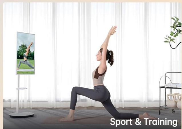
Figure 7: The monitor offers multiple adjustment options for a comfortable viewing experience in any position.