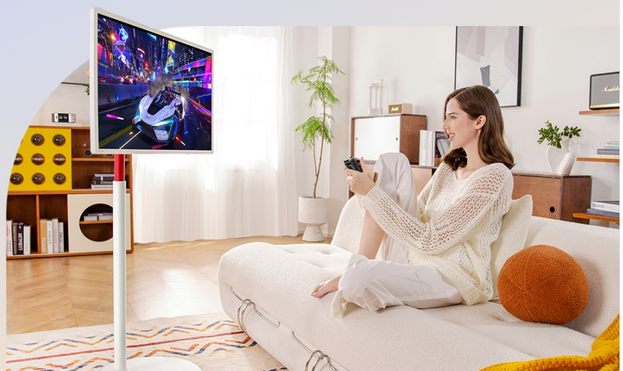
Figure 5: The Android 13 operating system provides a familiar and user-friendly experience with access to a wide range of applications.