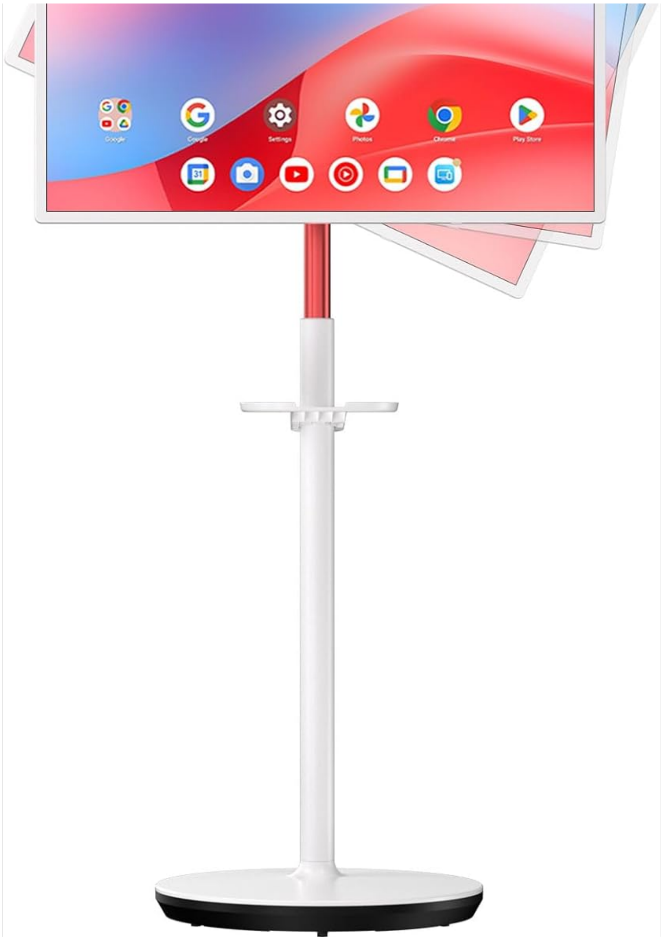
Figure 2: The KTC MegPad monitor fully assembled on its mobile stand.