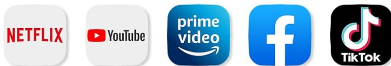
Figure 4: The intuitive 10-point touchscreen allows for easy interaction with applications and content.