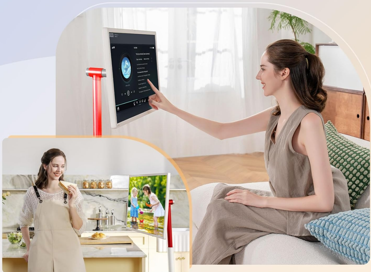
Figure 9: The MegPad's mobile design makes it suitable for various scenarios, from cooking to workouts.