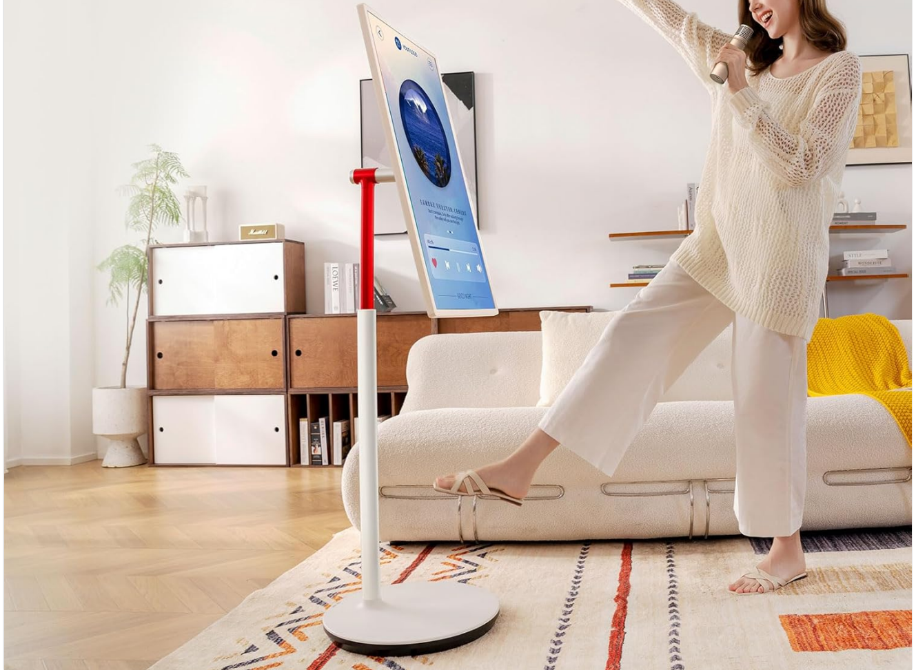
Figure 11: Experience engaging audio-visual content with the 10-point touch, 2x6W speakers, and Bluetooth 5.2 connectivity.