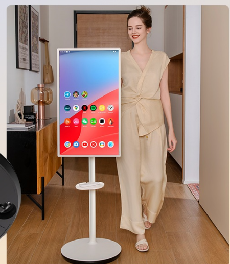
Figure 8: The mobile stand allows for multi-angle adjustment and lifting, enhancing versatility.