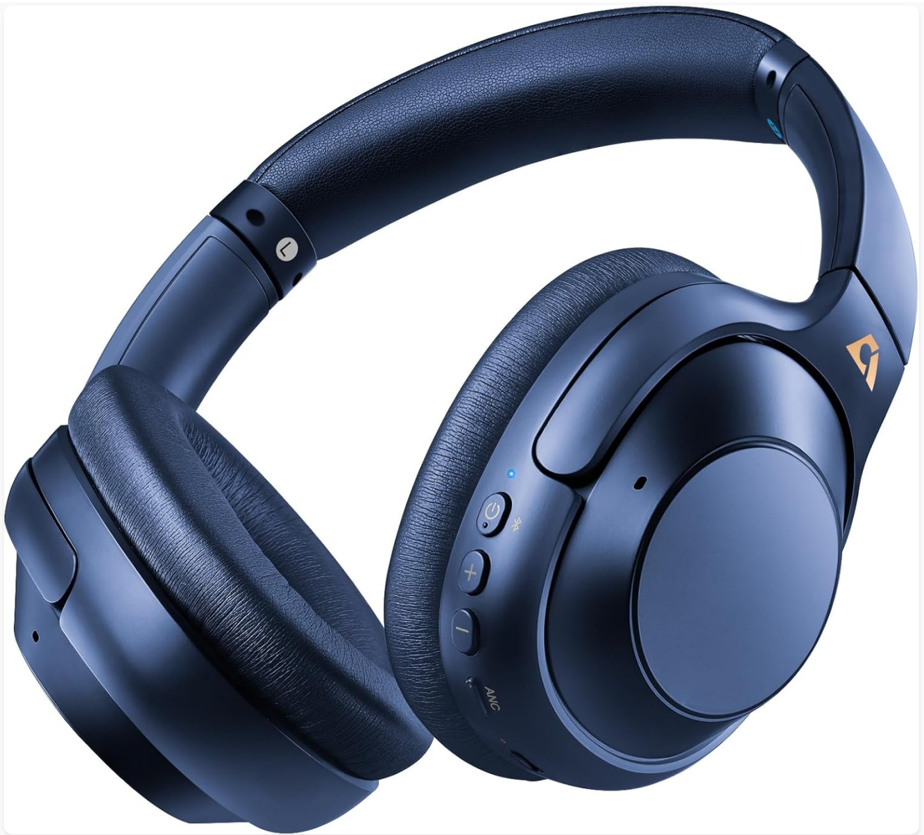
Image 1.1: YMOO Bluetooth 5.2 Hybrid Active Noise Cancelling Headphones in blue.

This image displays the YMOO Y7 headphones from an angled perspective, highlighting their over-ear design and blue finish. The left earcup shows control buttons and ports.