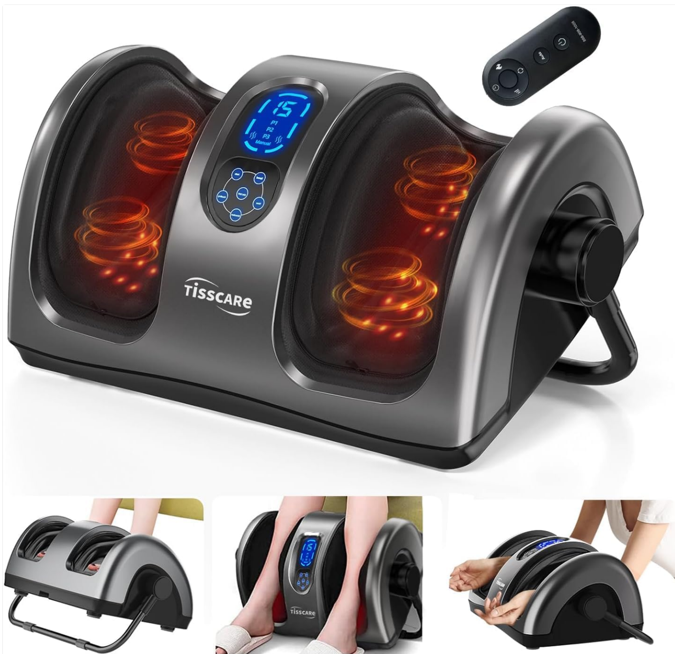
Image 1: The TISSCARE Foot Massager Model 212ZLJ-PL, showcasing its design, integrated control panel, and included remote control.