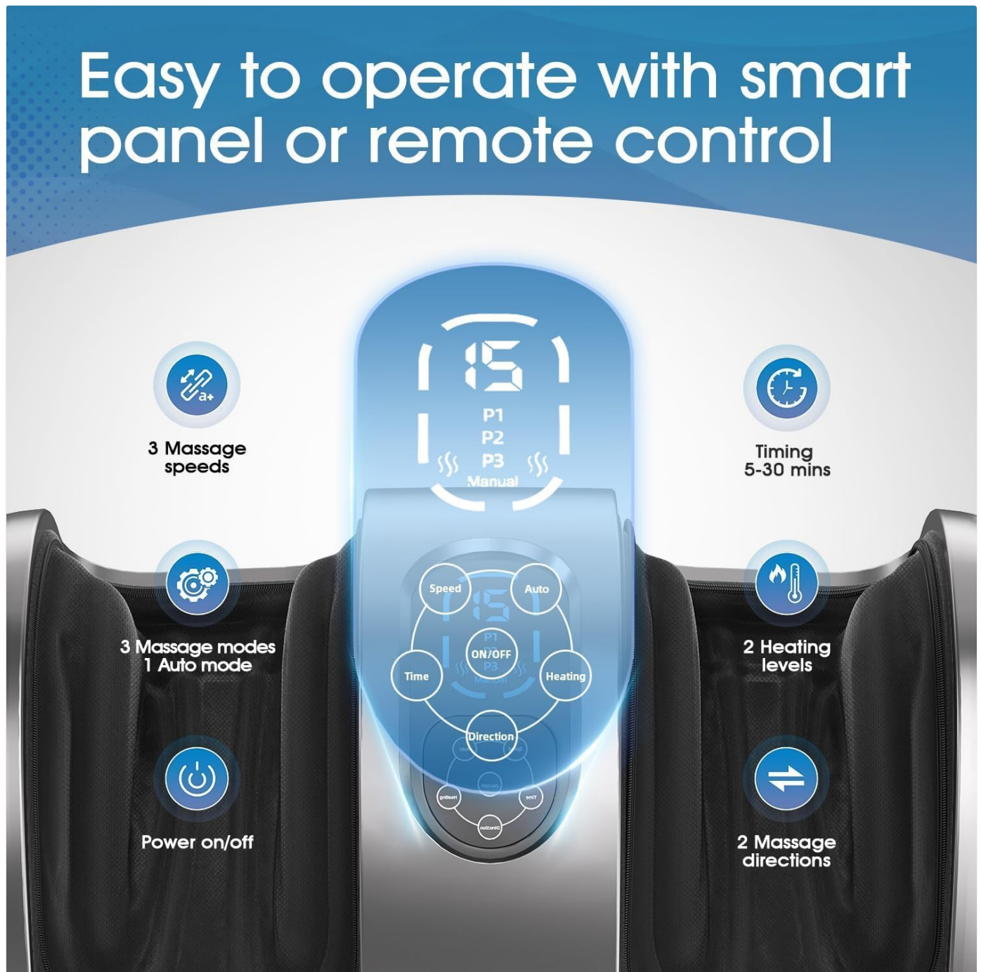
Image 3: Detailed view of the control panel and remote control, illustrating the various function buttons.

The TISSCARE Foot Massager can be operated using the integrated control panel or the included remote control.