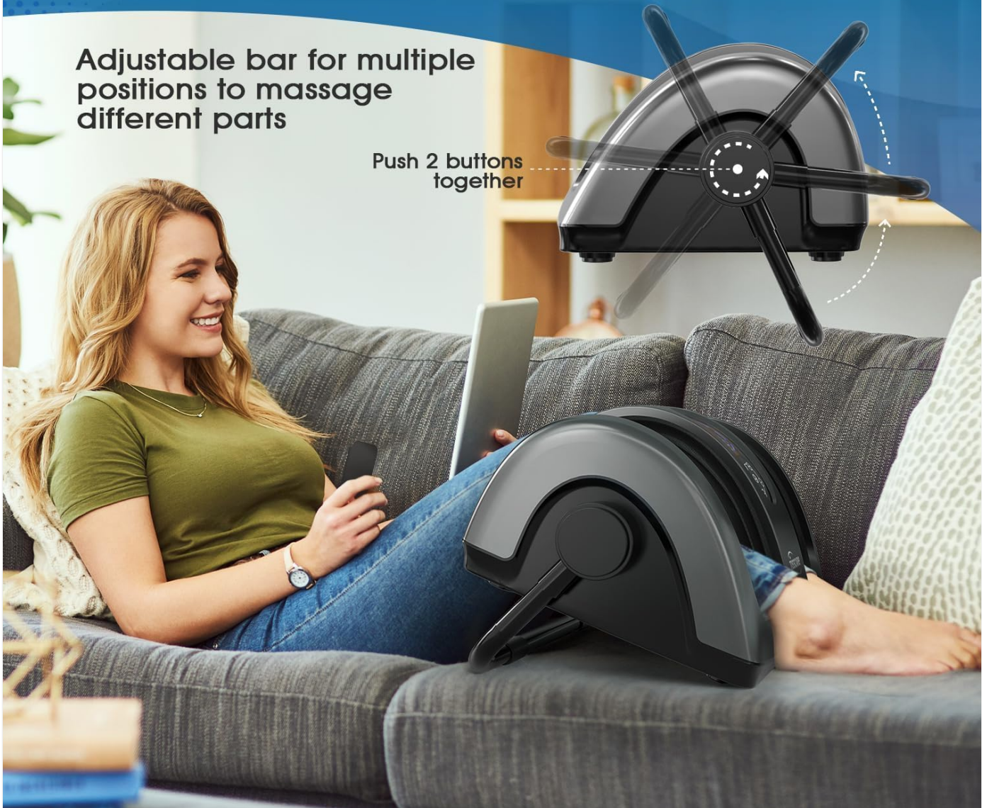
Image 2: A user demonstrating the adjustable support bar feature, positioning the massager to target the calves for relaxation.