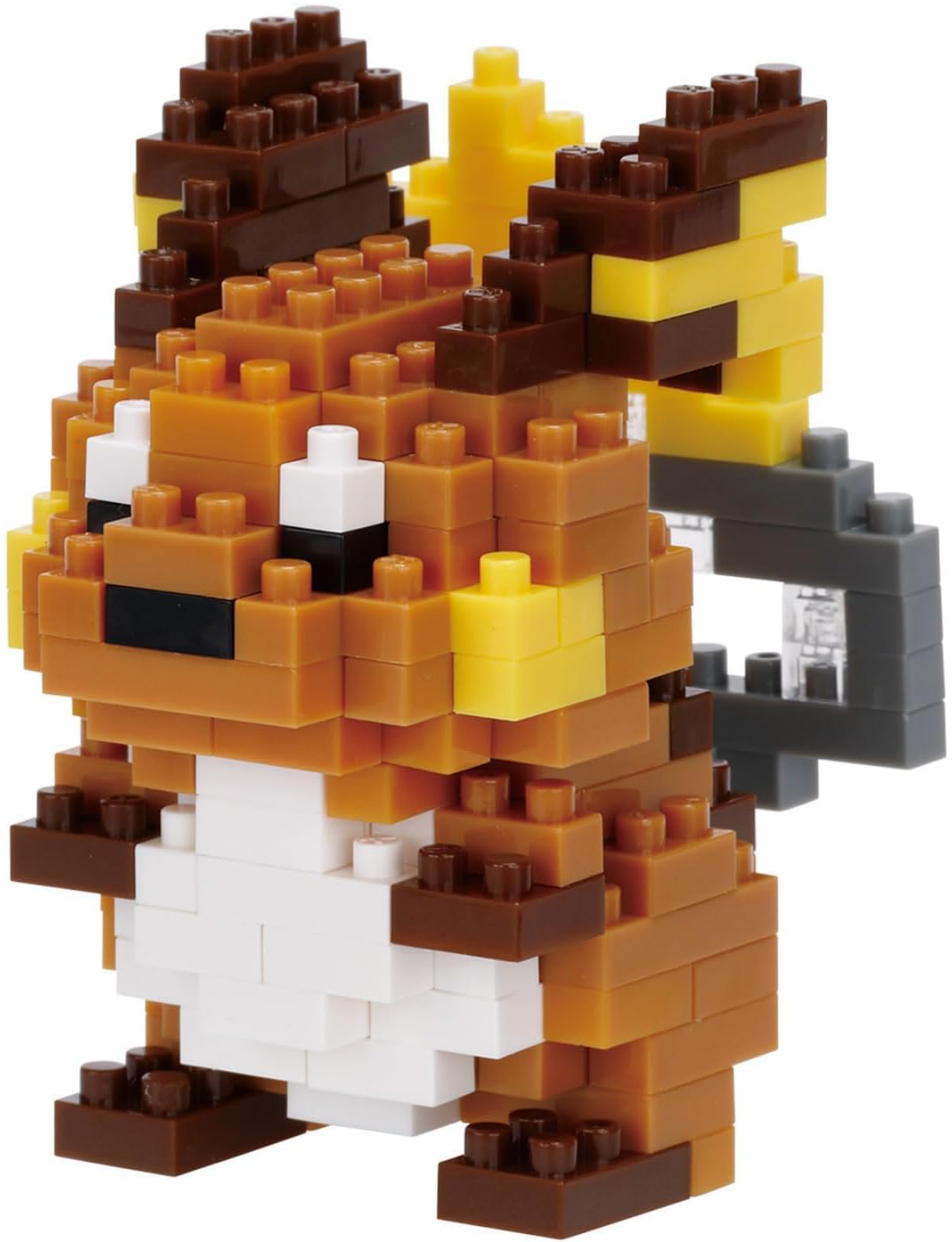
Image 1.1: Front view of the assembled nanoblock Raichu model. The model is constructed from small brown, yellow, white, and black building blocks, depicting Raichu's characteristic features.