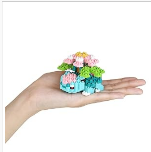
Image 4.1: A nanoblock model held in a hand, illustrating the small scale of the building blocks and the finished product.