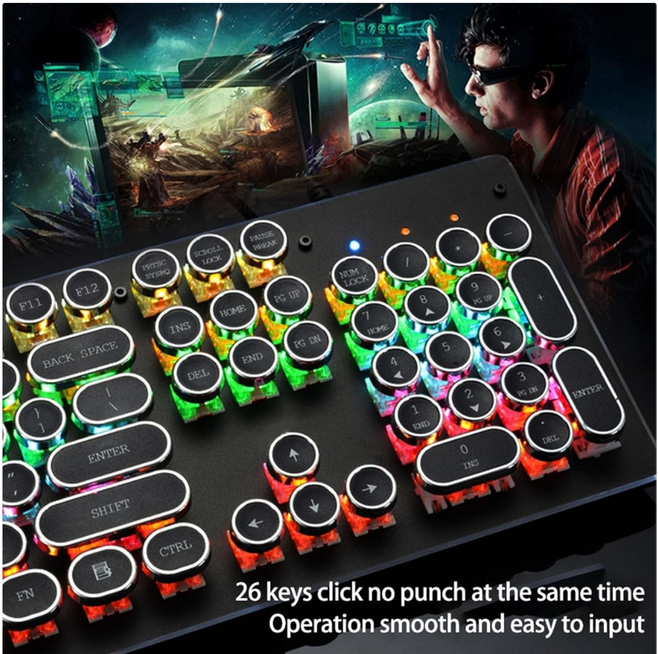
Image: A user interacting with the keyboard, illustrating the simultaneous input of multiple keys, indicating the anti-ghosting feature. The text overlay states "26 keys click no punch at the same time Operation smooth and easy to input".