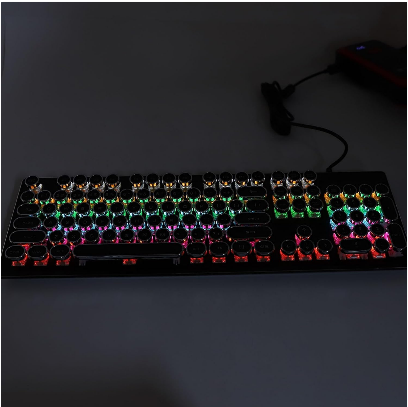
Image: The ASHATA Mechanical Gaming Keyboard glowing with RGB lights in a dimly lit setting, demonstrating its visual impact.