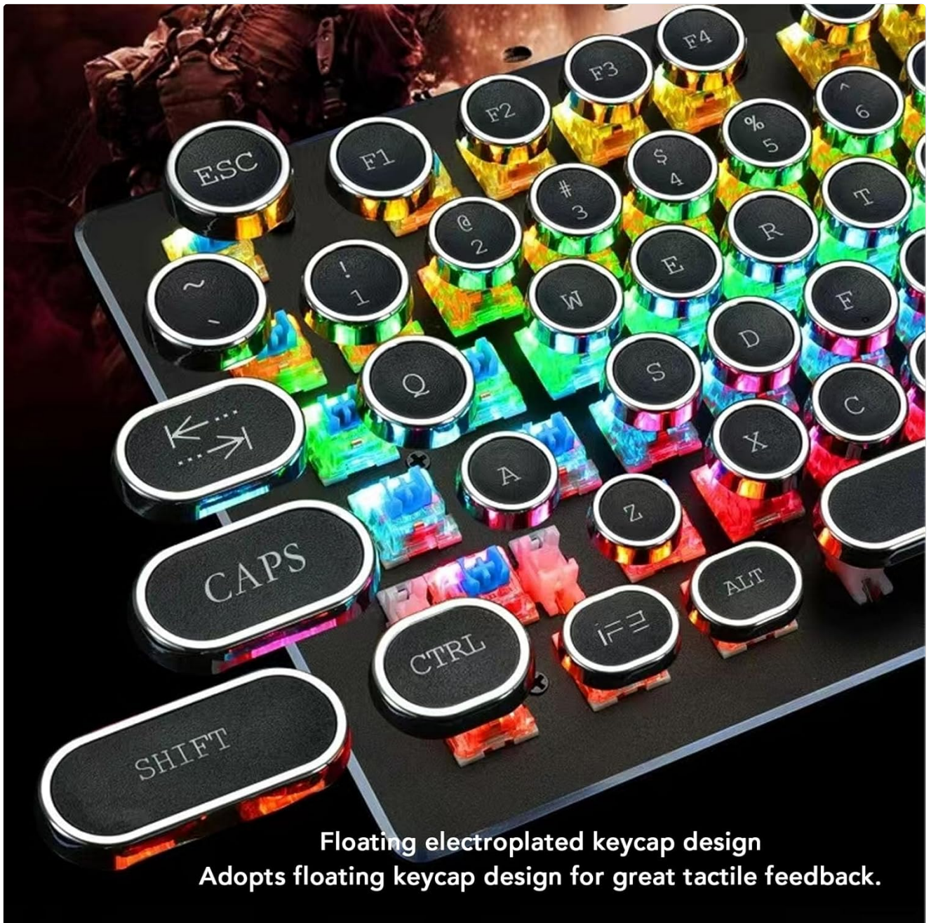
Floating electroplated keycap design Adopts floating keycap design for great tactile feedback.

Image: A detailed view of the floating electroplated keycap design, which contributes to the keyboard's tactile feedback and ergonomic profile.