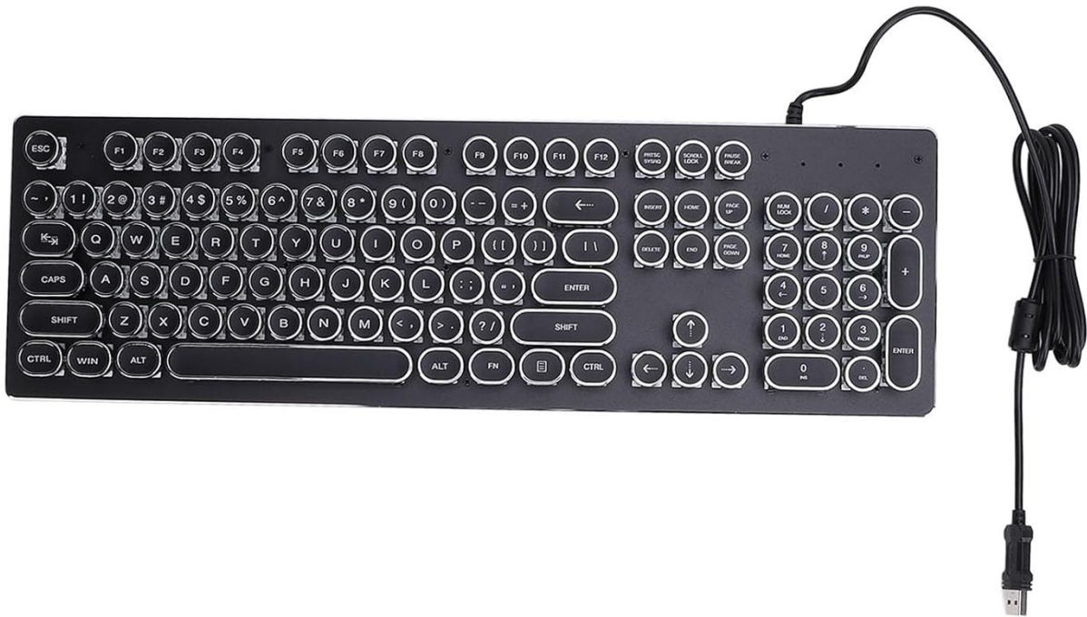
Image: The ASHATA Mechanical Gaming Keyboard with its USB cable, ready for connection. A user is visible in the background, indicating a typical setup environment.