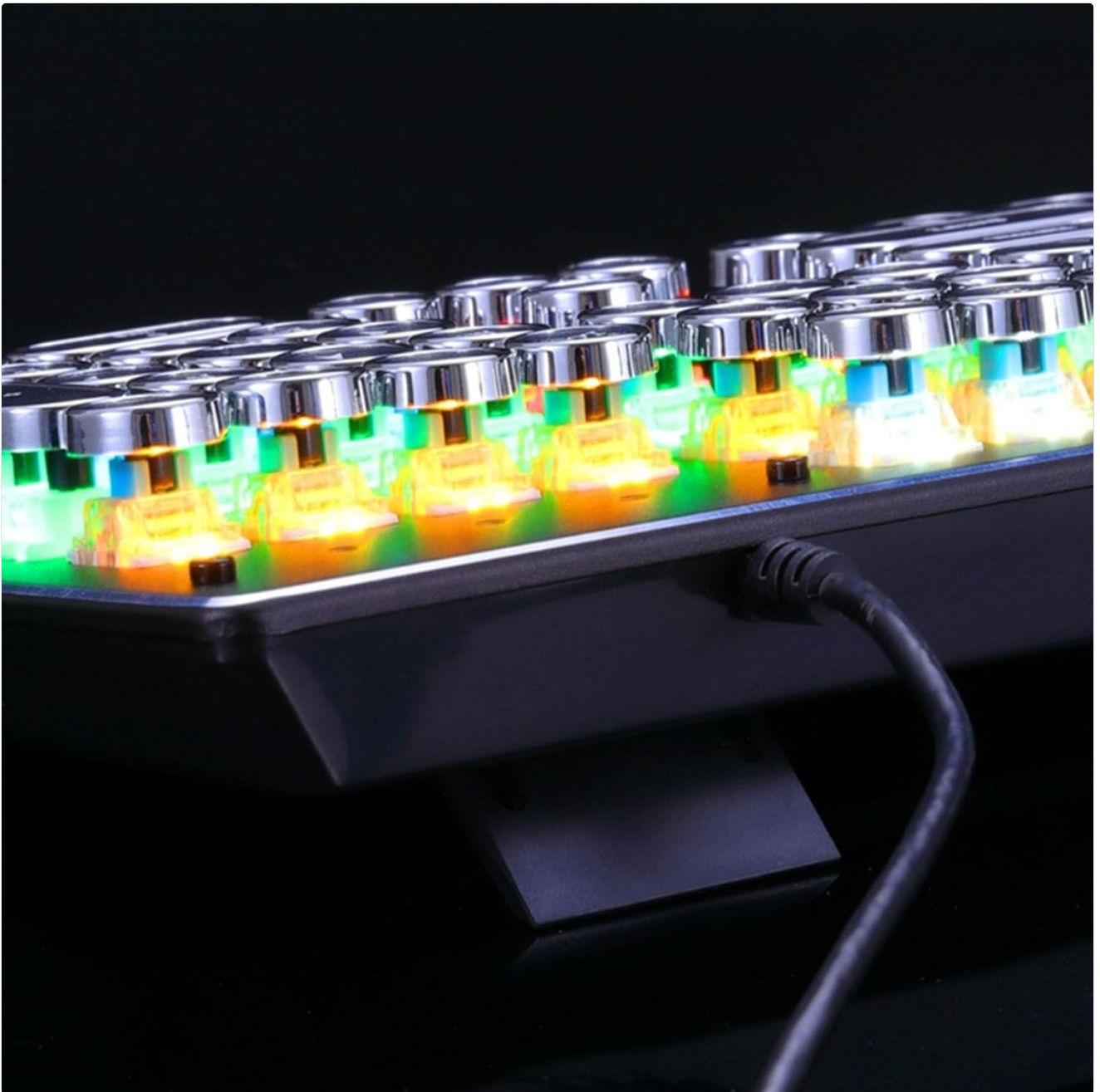
Image: A side view of the keyboard, showing the foldable rear stands extended, which allow for angle adjustment and improved ergonomics.