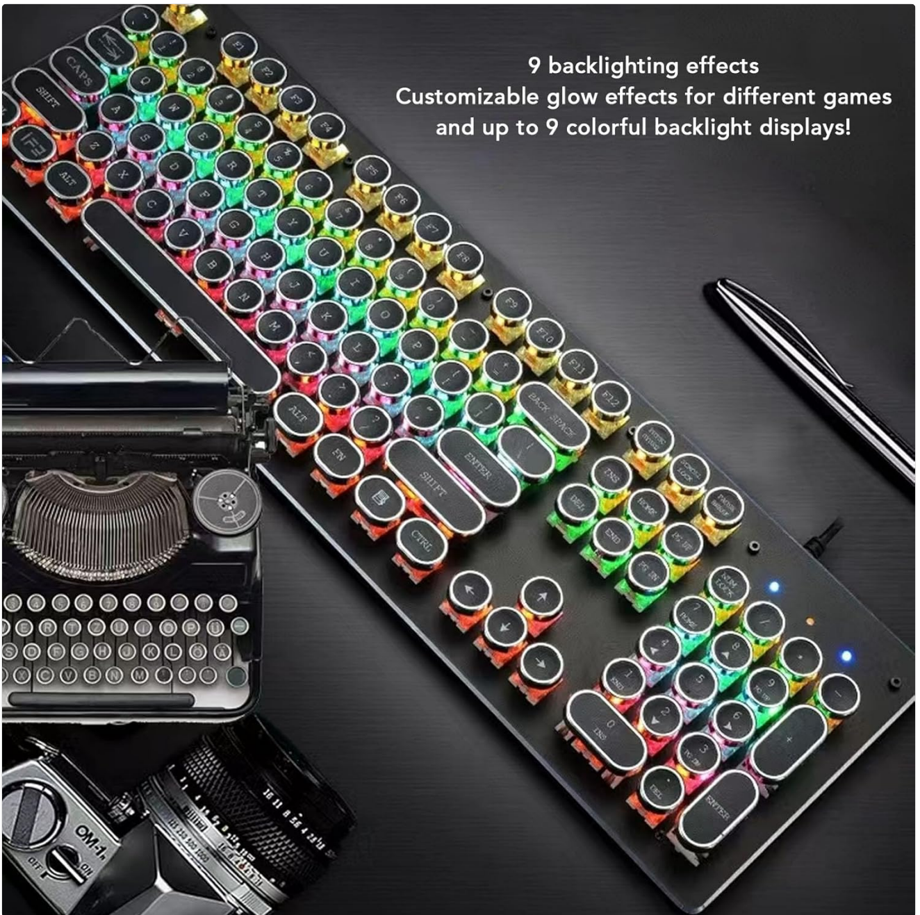
Image: The keyboard illuminated with colorful RGB backlighting, showcasing multiple lighting effects. A vintage typewriter and camera are in the background, emphasizing the retro aesthetic.

9 backlighting effects Customizable glow effects for different games and up to 9 colorful backlight displays!