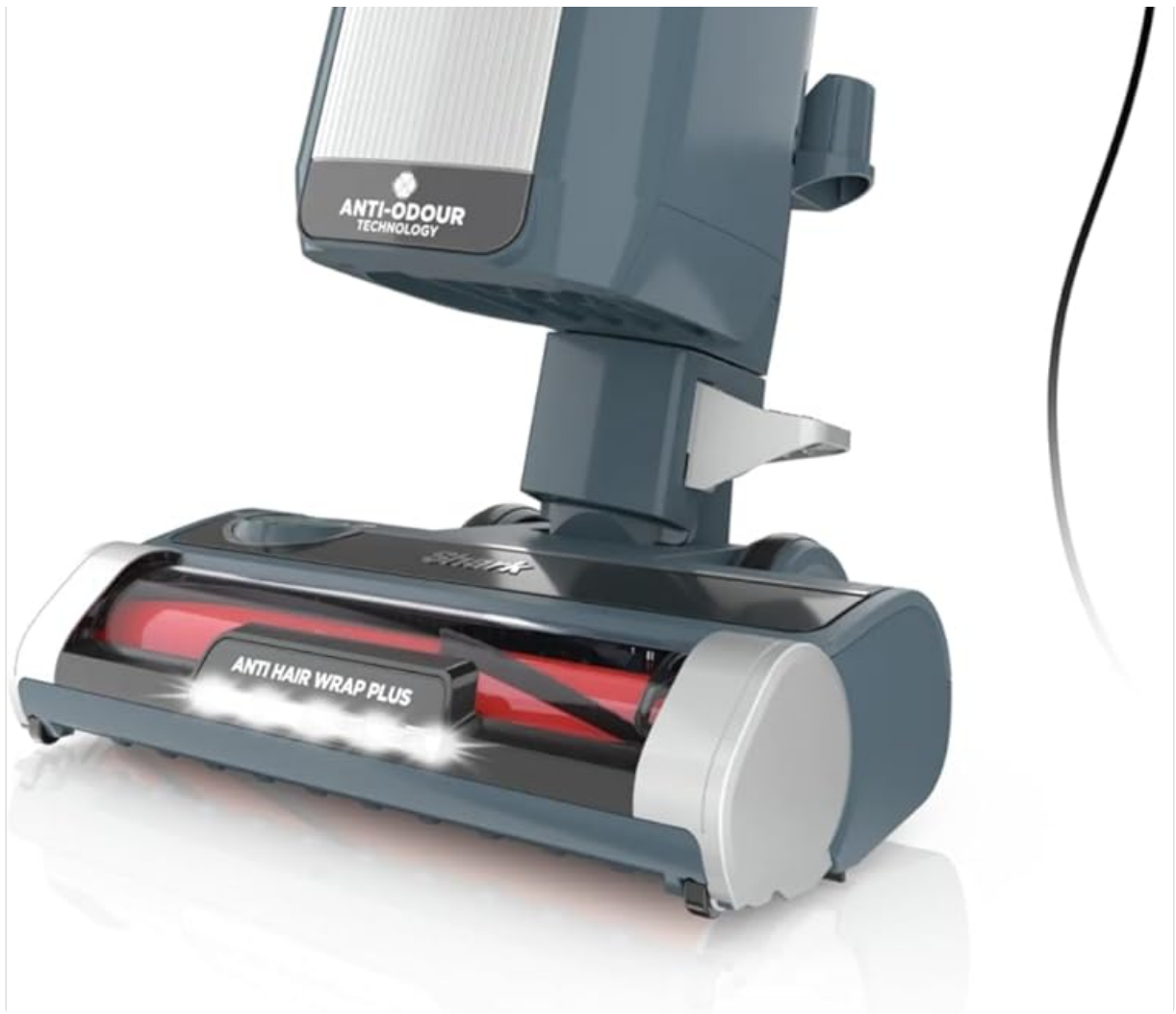
Image: The fully assembled Shark NZ780UKT upright vacuum cleaner, ready for use.