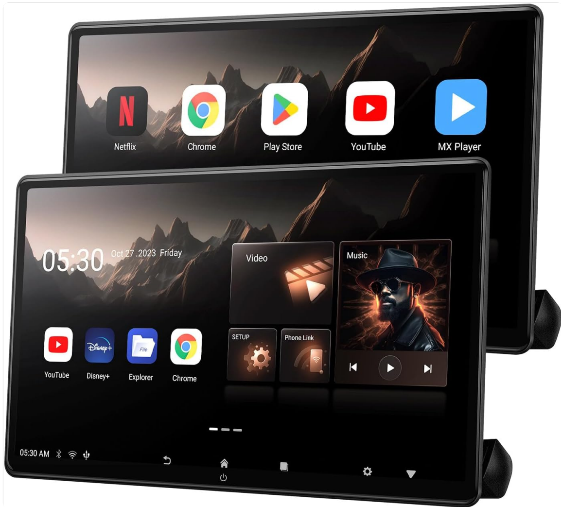
Image 1.1: The Seventour 15.6 inch Android Car TV Headrest Monitor displaying its user interface with various applications like Netflix, YouTube, and Chrome.