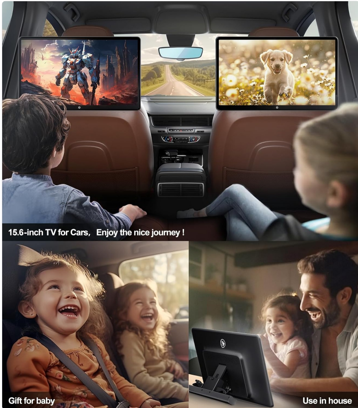
Image 3.2: The 15.6-inch car TV headrest monitors provide entertainment for rear-seat passengers, enhancing long journeys.

Your browser does not support the video tag.