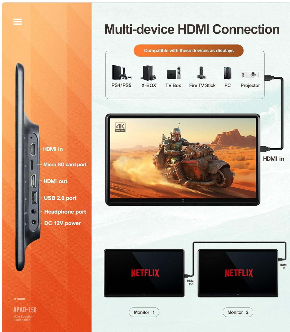
Image 2.3: The side panel of the monitor features multiple expansion ports, including HDMI input/output, Micro SD card slot, USB 2.0 port, headphone port, and DC 12V power input.