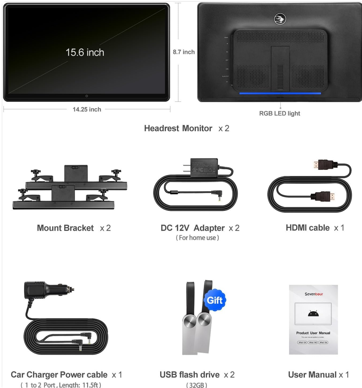
Image 2.1: Visual representation of the items included in the product package, such as the monitors, mounting brackets, power adapters, and cables.