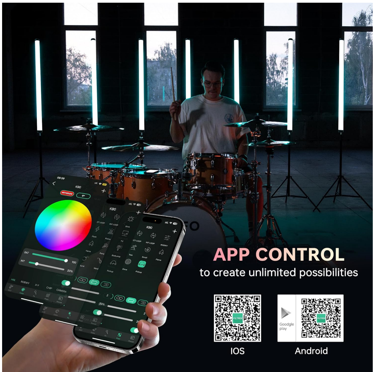
Image: A smartphone screen displaying the VILTROX app interface for controlling the K90 light, with QR codes for iOS and Android app downloads.

Download the ViltroxLink app here: iOS App Store