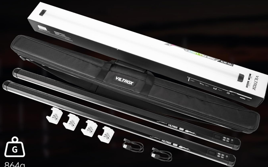
Image: Contents of the VILTROX K90 2 Pack RGB Tube Light kit, including two tube lights, a carry bag, magnetic clips, and charging cables.