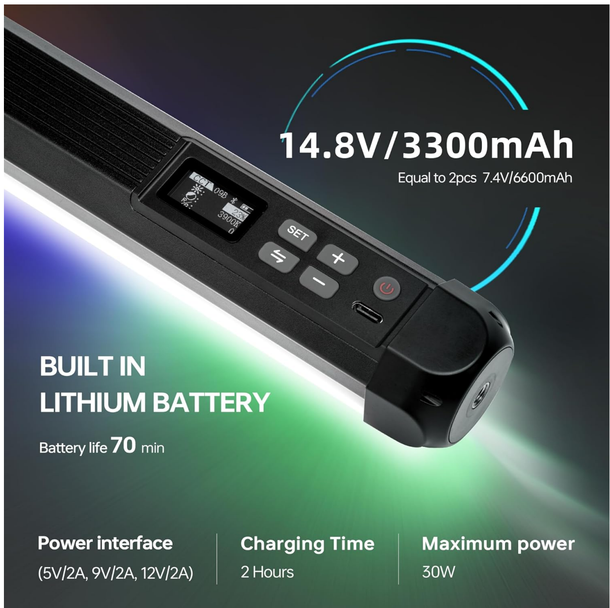
Image: Close-up of the VILTROX K90's charging port and LCD screen displaying battery information.