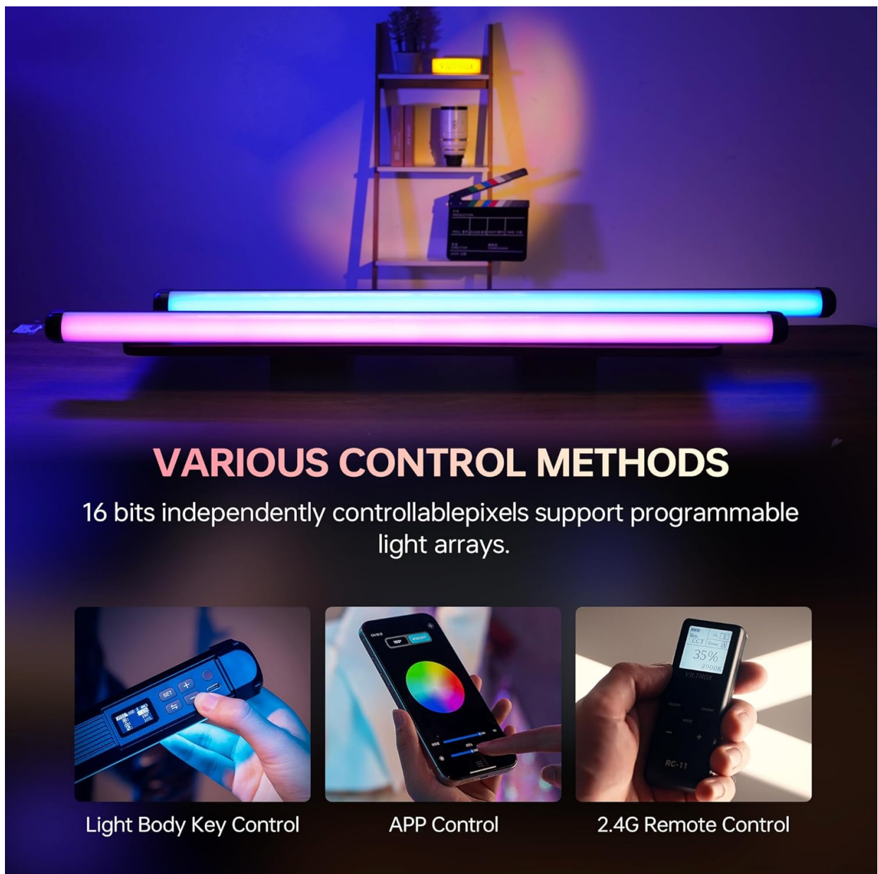
Image: Illustration of the various control methods for the VILTROX K90, including on-body buttons, smartphone app, and remote control.