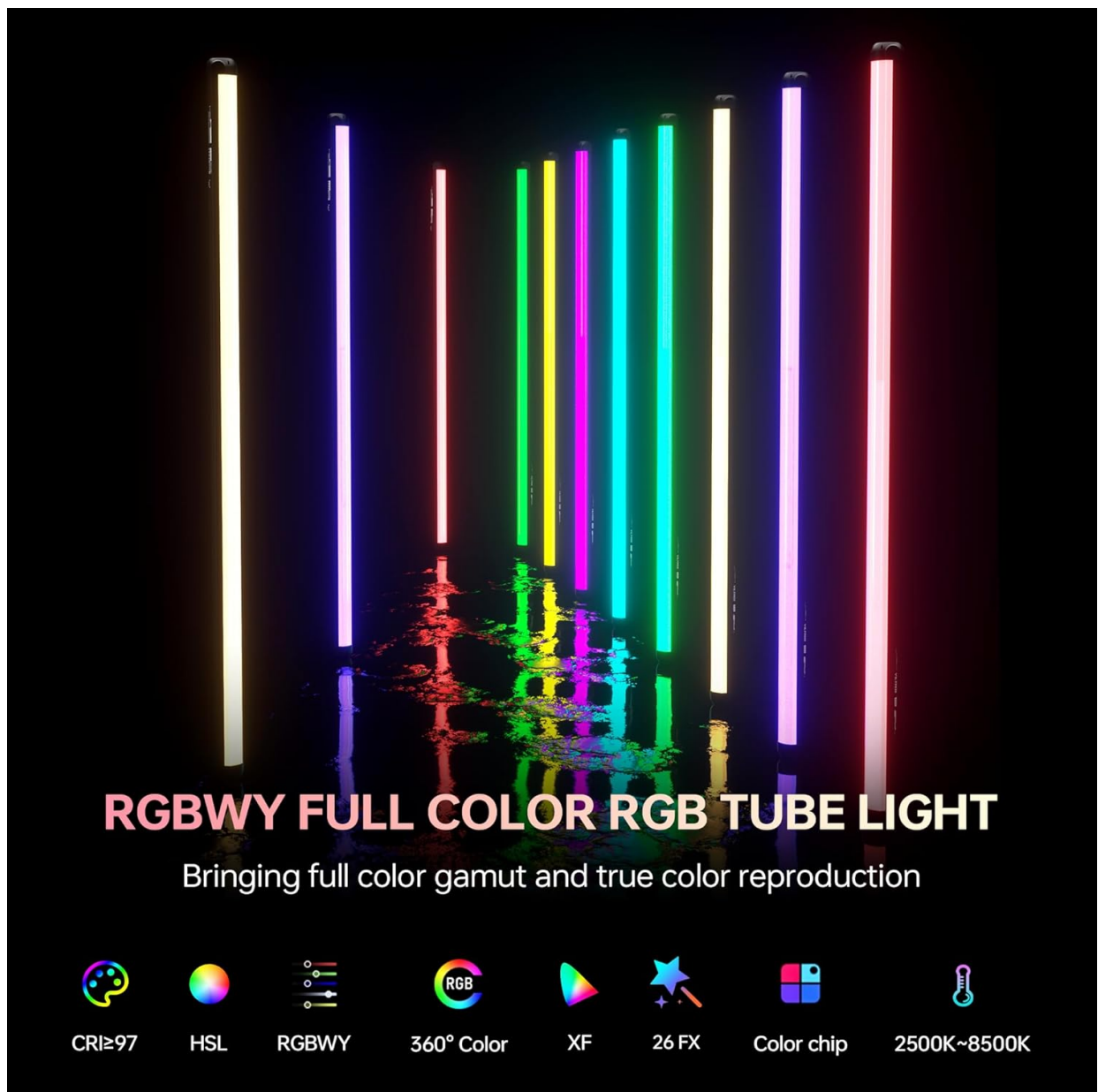
Image: The VILTROX K90 tube light displaying a range of vibrant RGBWY colors.