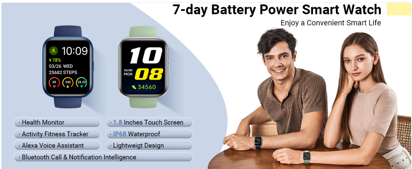
Image: A display of various customizable watch faces, demonstrating the personalization options available for the Quican Smart Watch ID208 Plus.

The Quican Smart Watch ID208 Plus features a 1.8-inch HD touchscreen display for intuitive navigation. Swipe across the screen to access different functions and menus. The watch also supports over 110 customizable watch faces, allowing you to personalize its appearance.