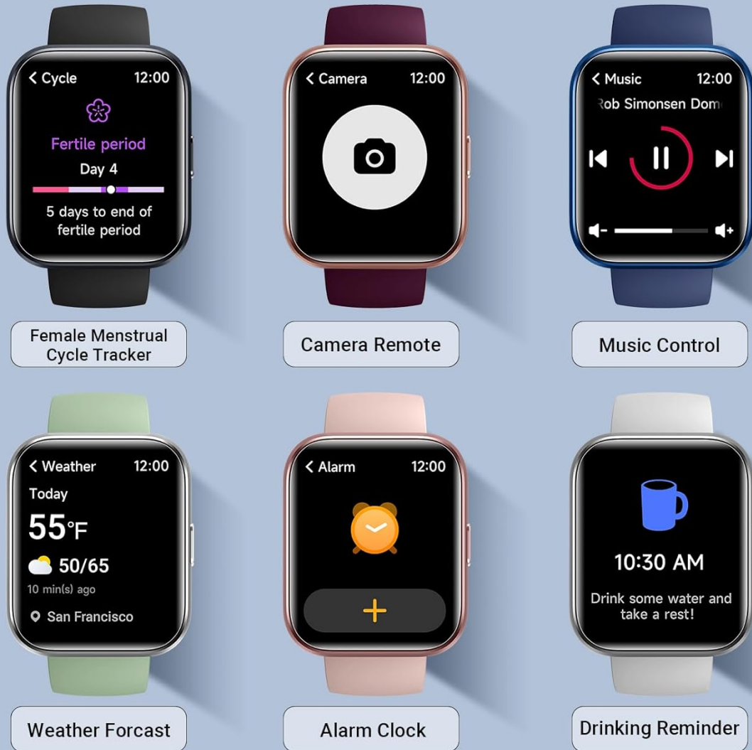
Image: A grid of smartwatch screens showcasing various smart features: Female Menstrual Cycle Tracker, Camera Remote, Music Control, Weather Forecast, Alarm Clock, and Drinking Reminder.