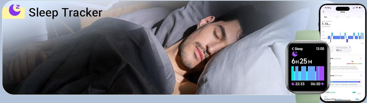
Image: A composite image showing the smartwatch and corresponding app screens for Heart Rate Monitor, Blood Oxygen Monitor, and Sleep Tracker, illustrating the health data monitoring capabilities.