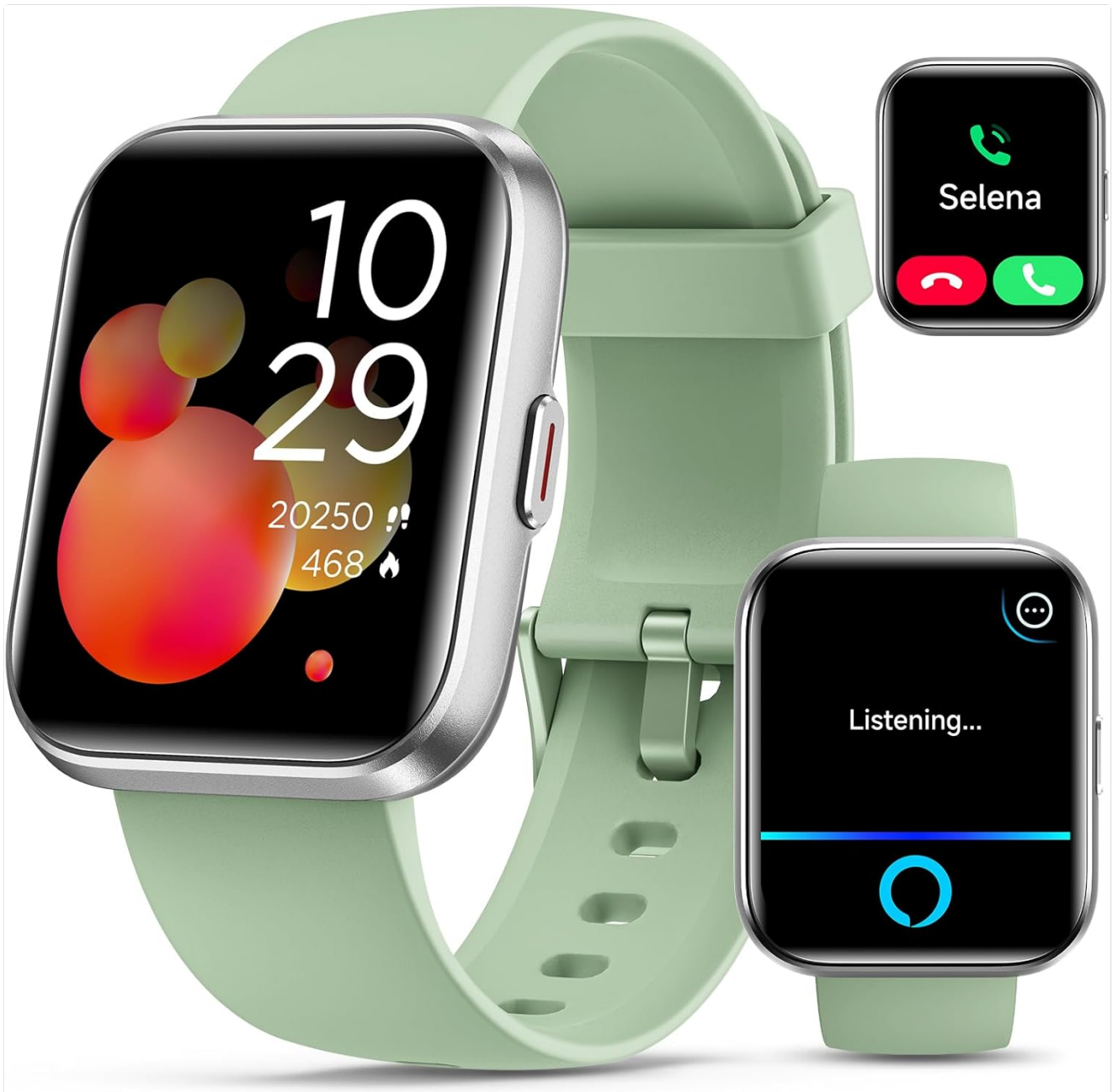
Image: The Quican Smart Watch ID208 Plus in green, displaying the time and activity data, alongside a visual representation of incoming call and Alexa listening functions. This image illustrates the watch's primary interface and key features.