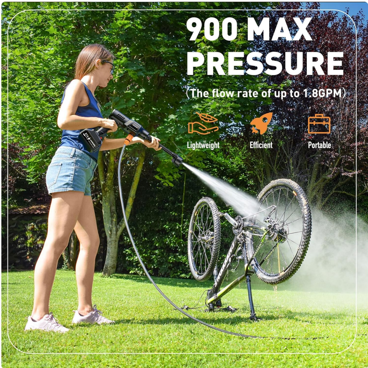
Figure 5.3: A woman demonstrating the use of the WADADDY Cordless Power Washer to clean a bicycle wheel, highlighting its lightweight, efficient, and portable design with 900 PSI maximum pressure.