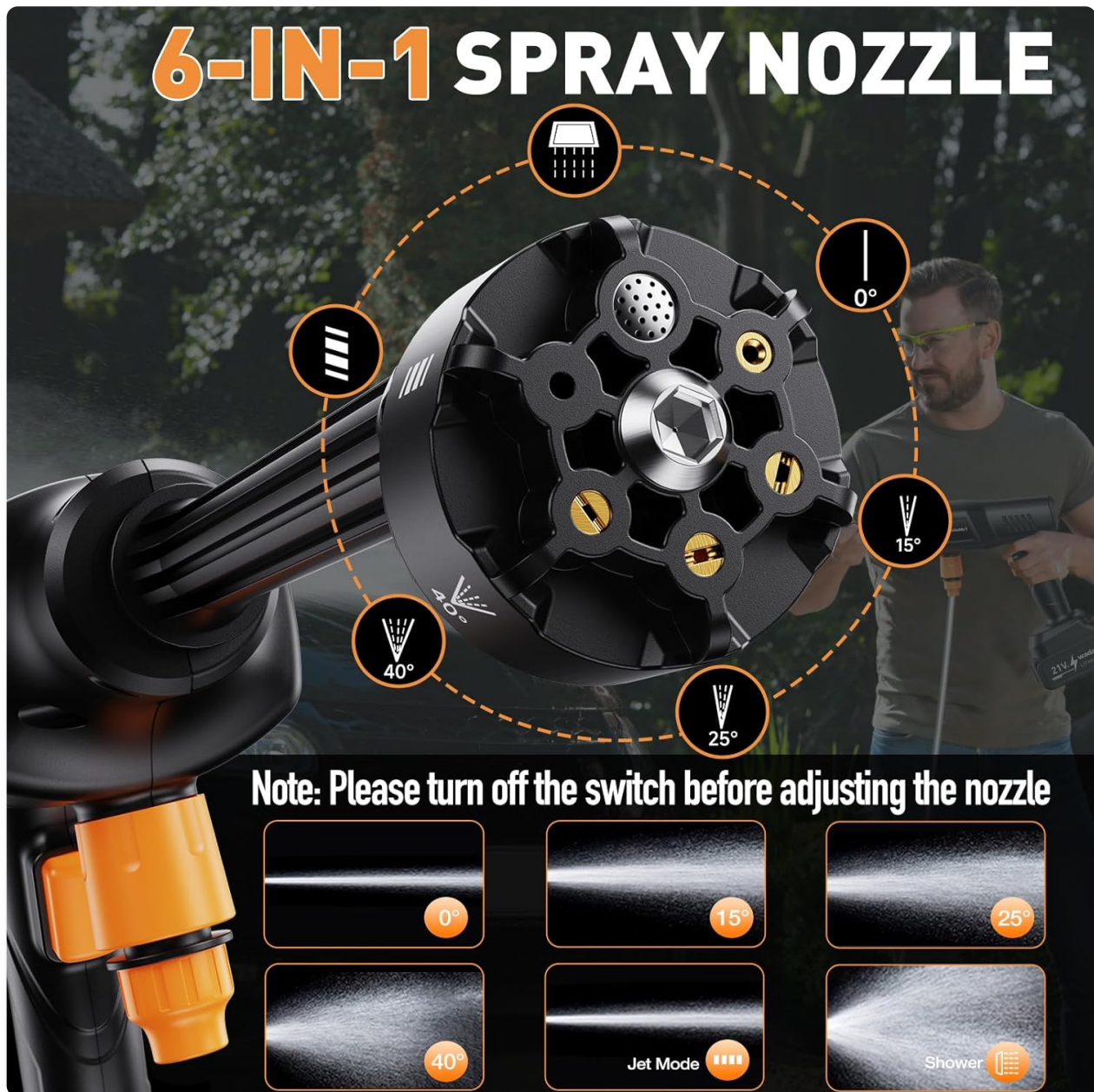
Figure 5.1: A detailed view of the 6-in-1 spray nozzle, illustrating its different settings: 0° (direct jet), 15°, 25°, 40° (fan sprays), Jet Mode, and Shower Mode. Note: Turn off the switch before adjusting the nozzle.

The 6-in-1 nozzle allows you to easily switch between different spray patterns for various cleaning tasks. Always turn off the power washer before adjusting the nozzle.