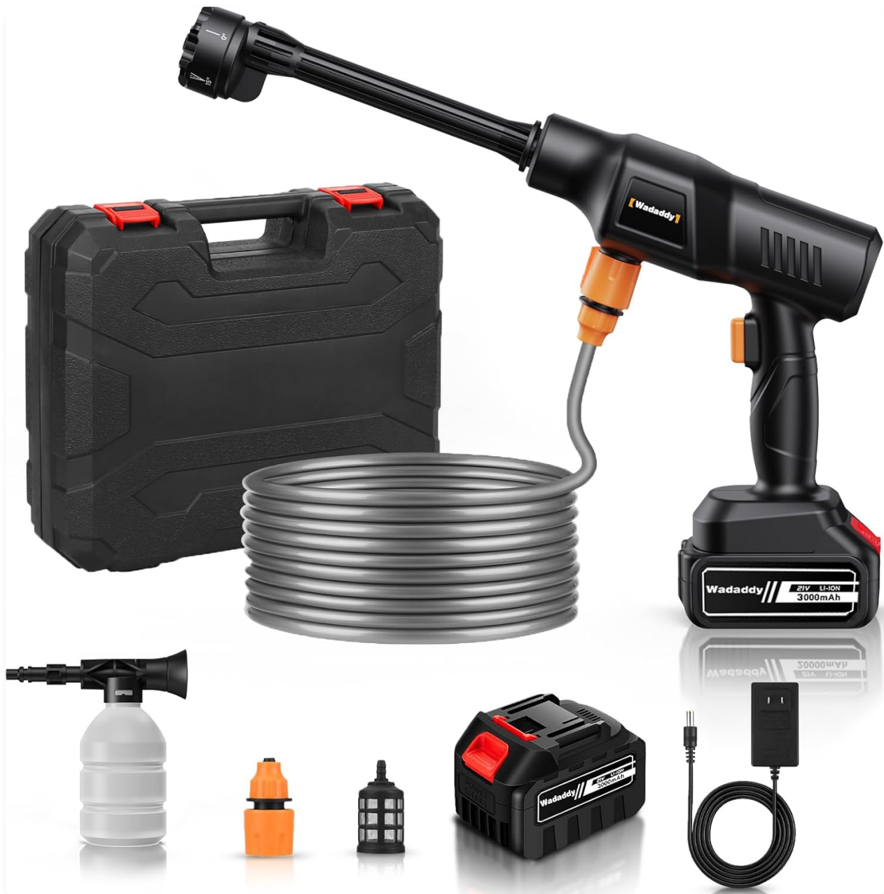
Figure 2.1: The WADADDY Cordless Power Washer unit shown with its primary accessories including the hose, battery, charger, foam cannon, and storage case.

outdoor tasks. It offers powerful cleaning performance with a maximum pressure of 900 PSI and a flow rate of 1.8 GPM, making it suitable for washing cars, cleaning yards, and more.