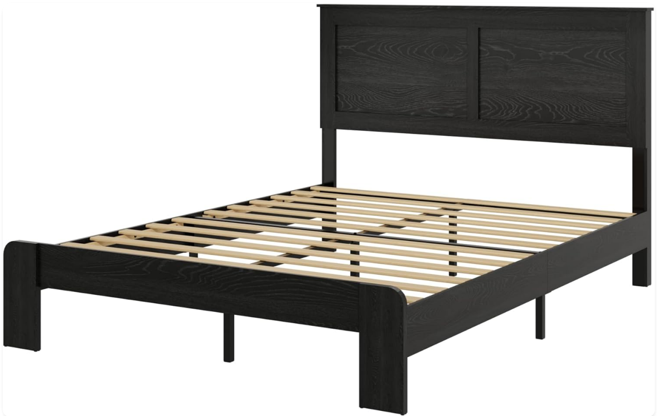
Image: The bed frame without a mattress, clearly showing the arrangement of the wooden slats and the central support beam.

Video: This video demonstrates the wooden slat support system, highlighting the Velcro design for easy installation and the EVA silent cotton for a noiseless experience.