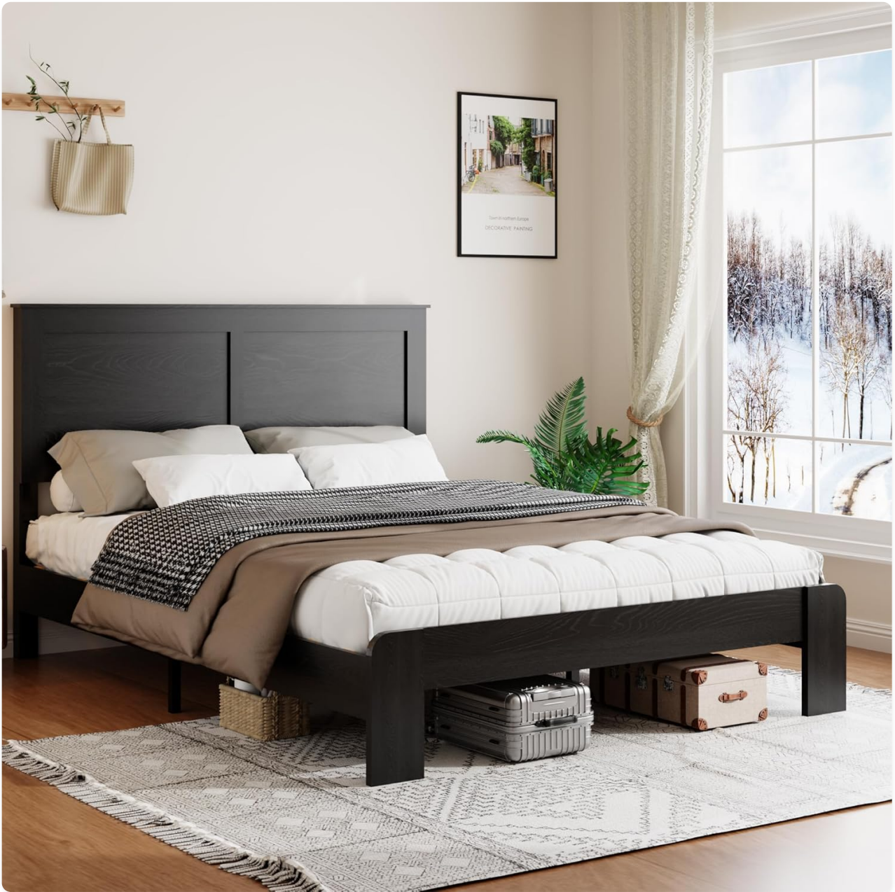
Image: The SAMTRA Full Size Wooden Bed Frame in Rustic Black, set up in a bedroom with a mattress and bedding.

Your browser does not support the video tag.